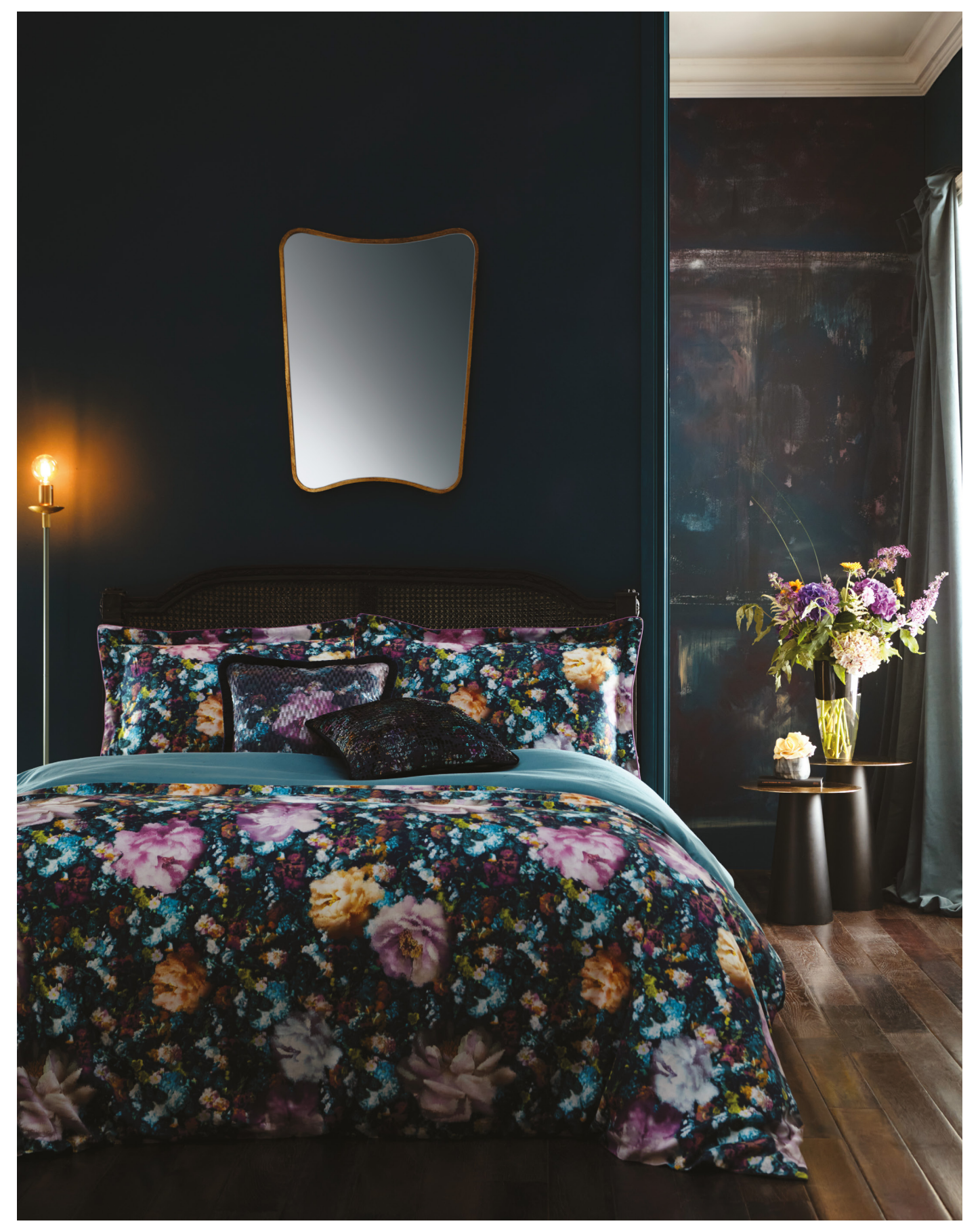
Left to right: Camile bedlinen set midnight, Camile cushion, Scintilla cushion.