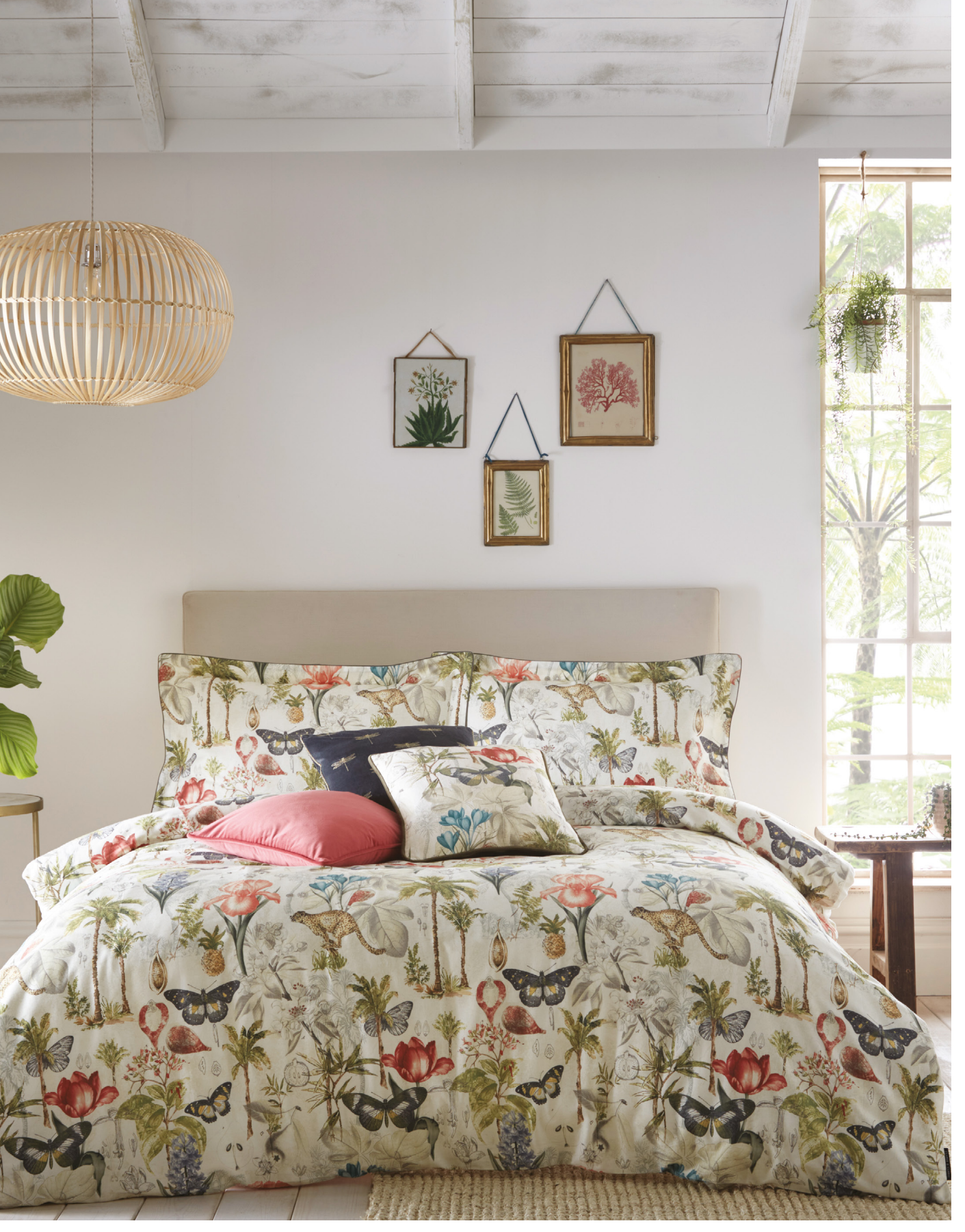
Left to right: Botany bedlinen set tropical, velvet cushion made from Alvar peony, Azure cushion, Botany cushion.