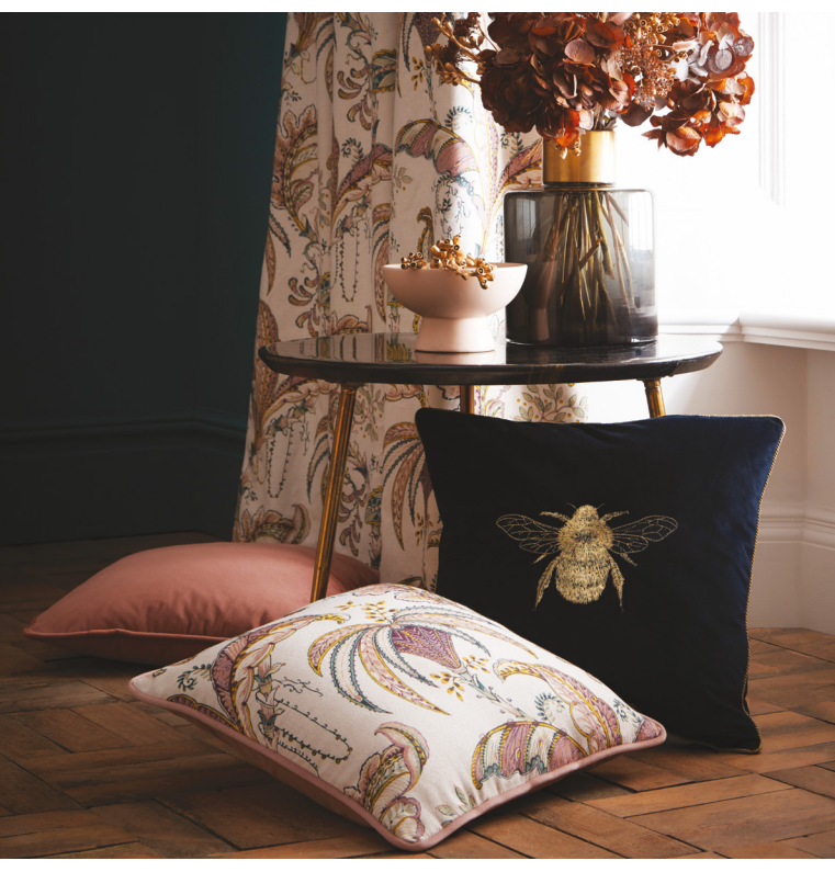
Top to bottom: curtain Ophelia fabric, velvet cushion Alvar rose, Abeja cushion, Ophelia cushion.