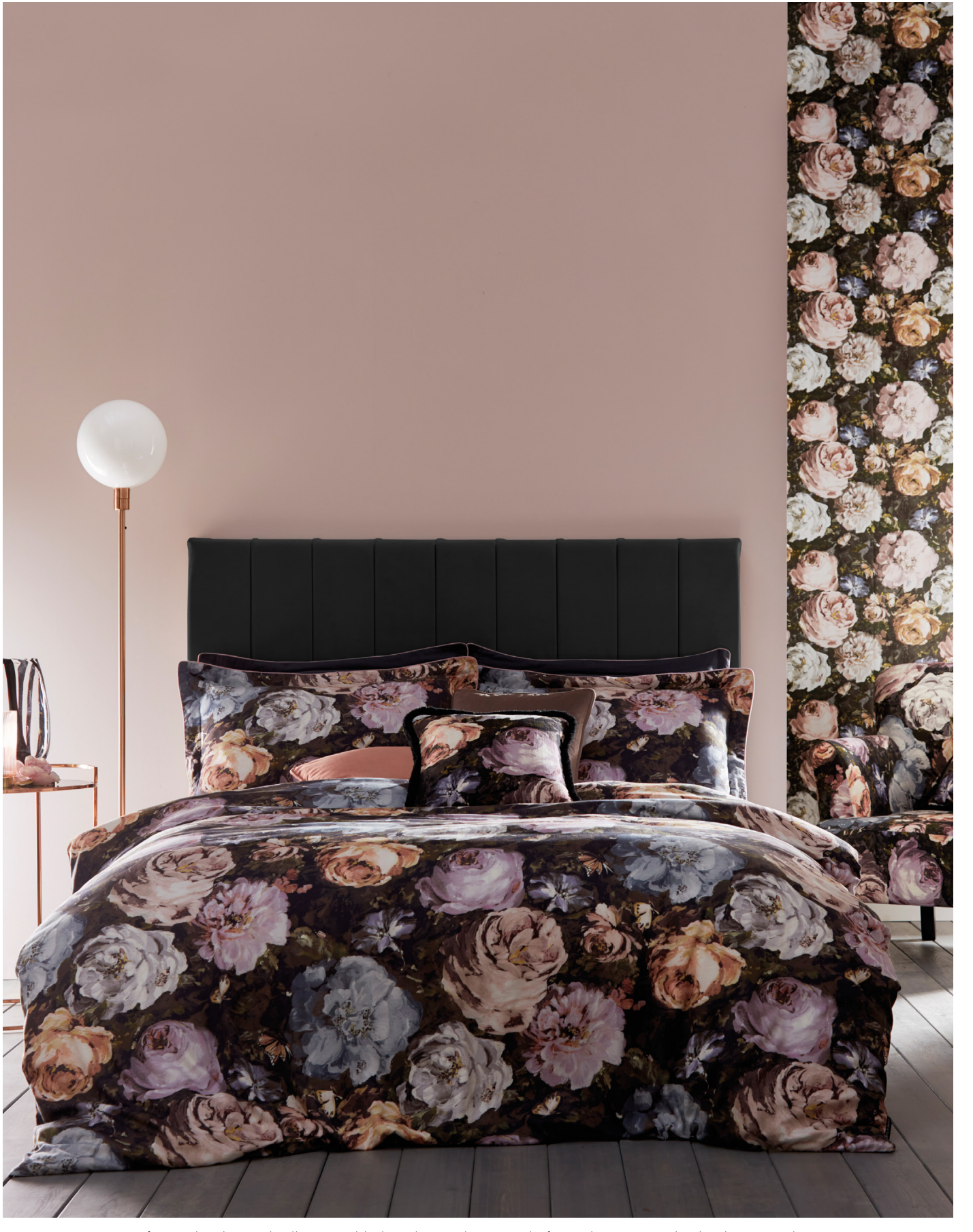
Left to right: Floretta bedlinen set blush, velvet cushions made from Alvar rose and ash, Floretta cushion, Floretta wallcovering blush/charcoal, Dalston chair Floretta blush.