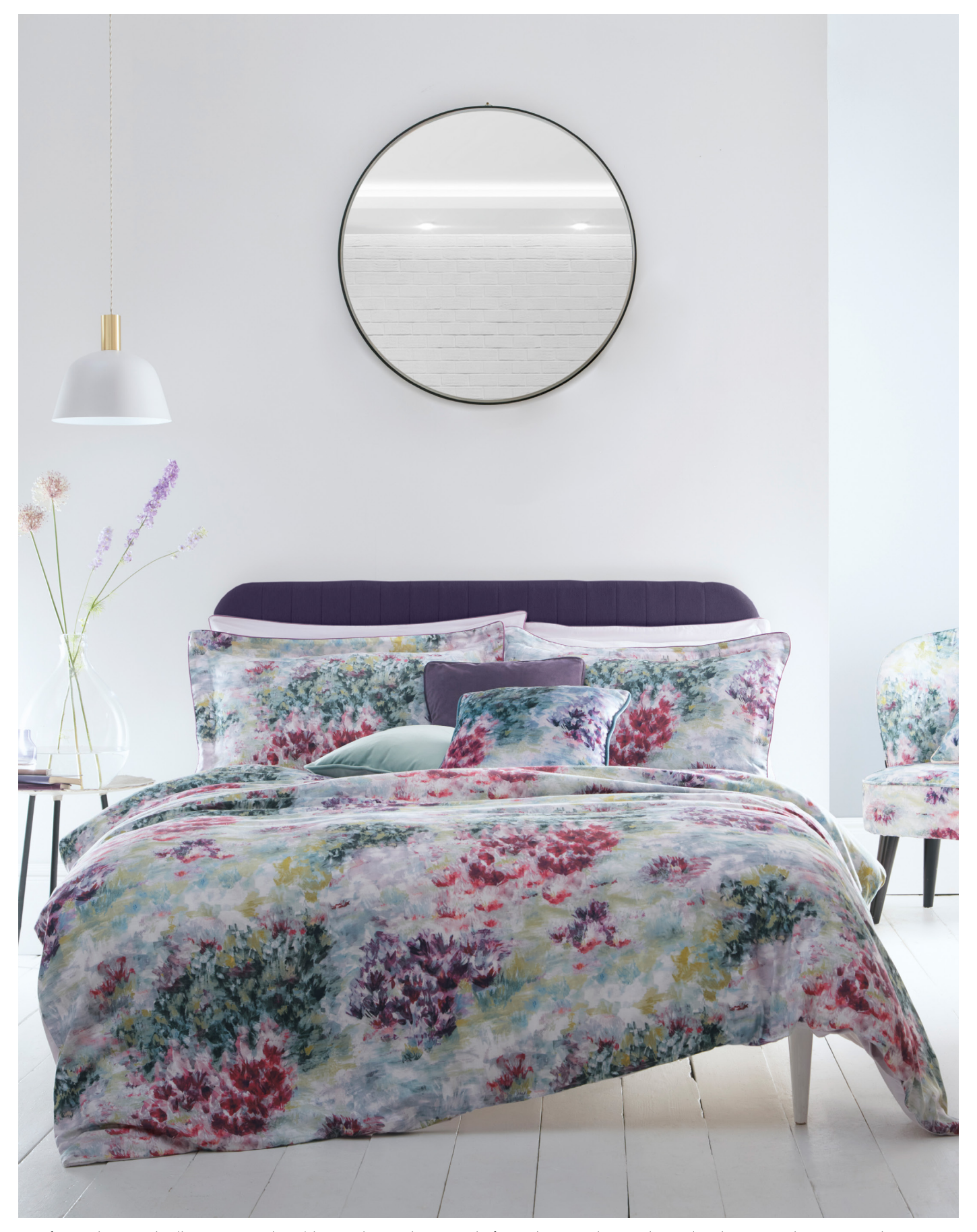
Left to right: Fiore bedlinen set amethyst/slate, velvet cushions made from Alvar amethyst and eau de nil, Fiore cushion, Ascot chair Fiore amethyst/slate.