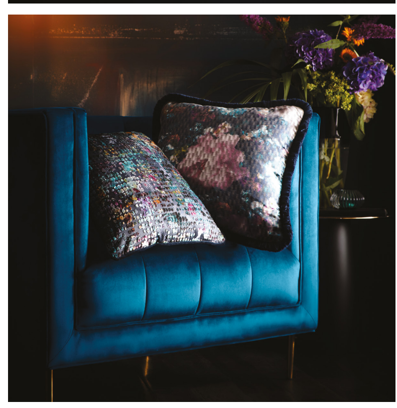
Top to bottom: Scintilla cushion, Camile cushion, Camile bedlinen set midnight.

Elevate your space with the beautiful distorted floral blooms of Camile, contrasted against a deep midnight ground. Add an extra layer of luxury with the coordinating Camile & Scintilla cushions.