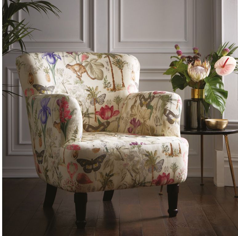
Top to bottom: Botany cushion, Botany bedlinen set tropical, Dalston chair Botany summer.