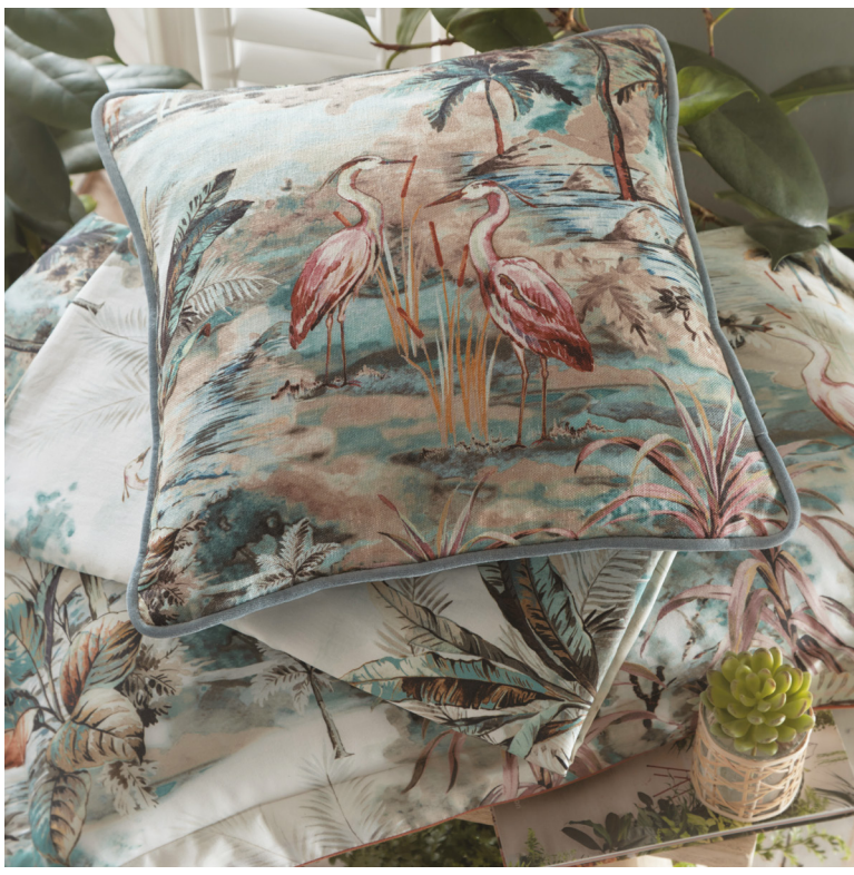
Top to bottom: Azure cushion, Habitat cushion, Habitat bedlinen set mineral.