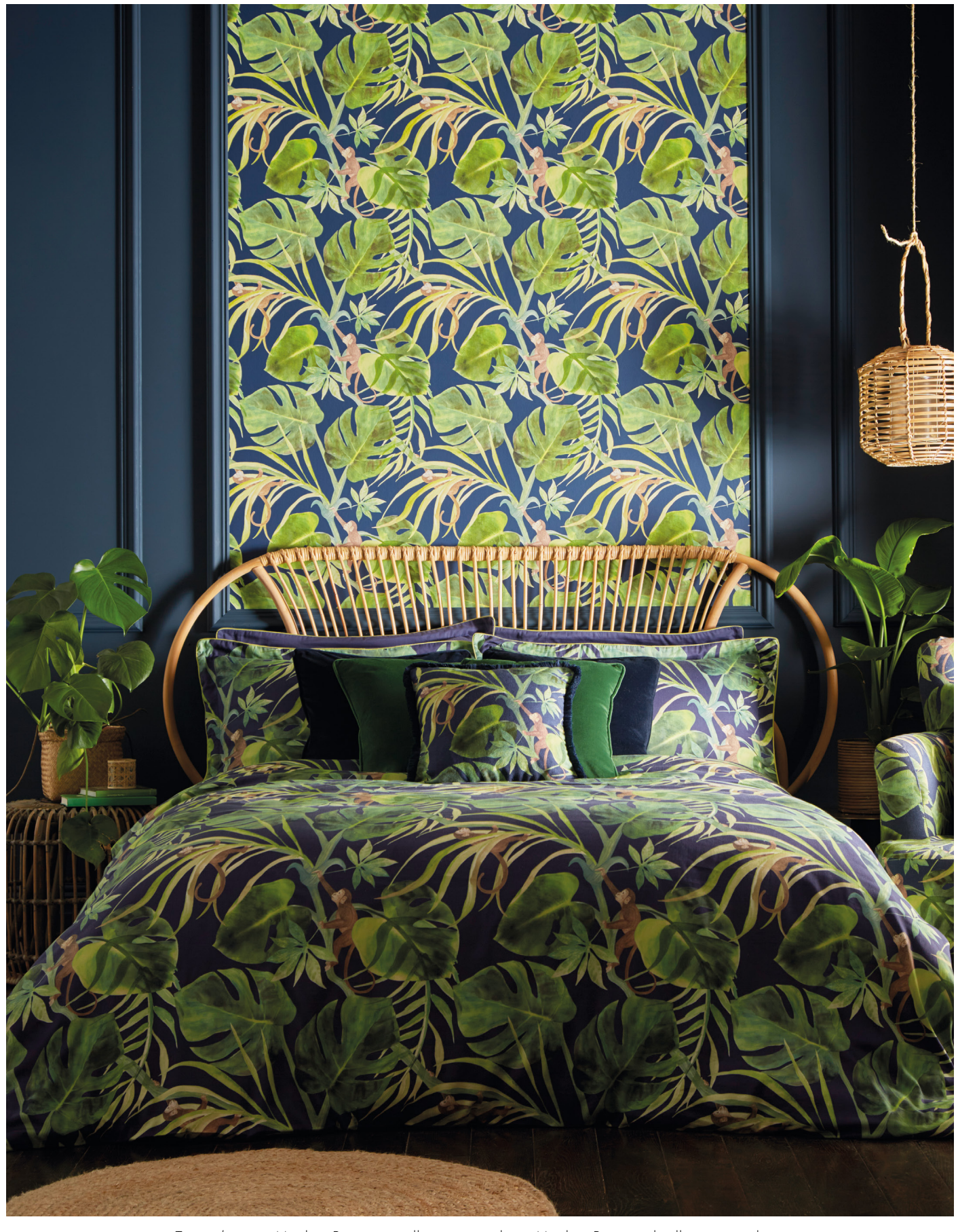
Top to bottom: Monkey Business wallcovering indigo, Monkey Business bedlinen set indigo, velvet cushions made from Alvar navy and hunter, Monkey Business cushion.