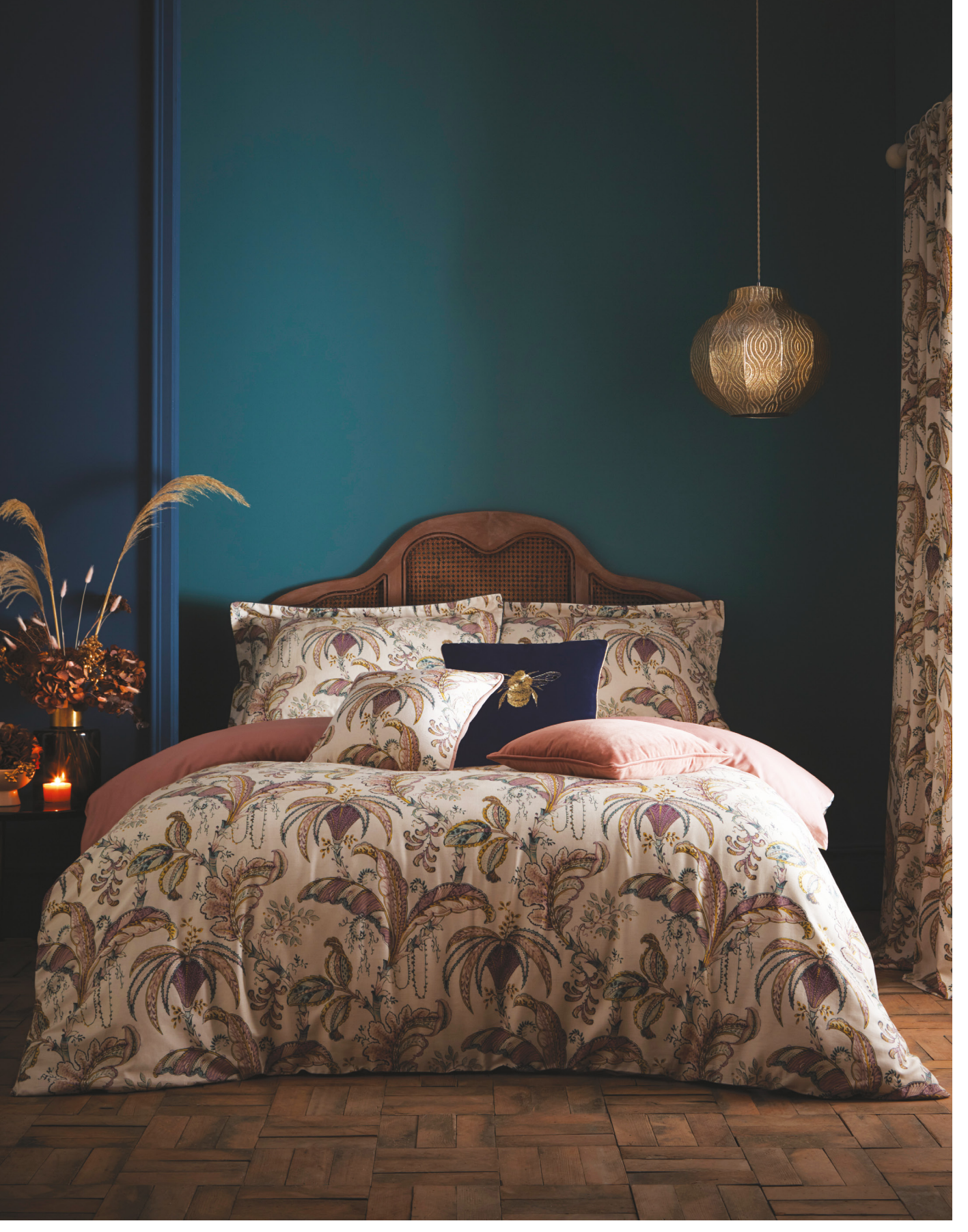
Left to right: Ophelia bedlinen set multi, Ophelia cushion, Abeja cushion, curtain Ophelia fabric.