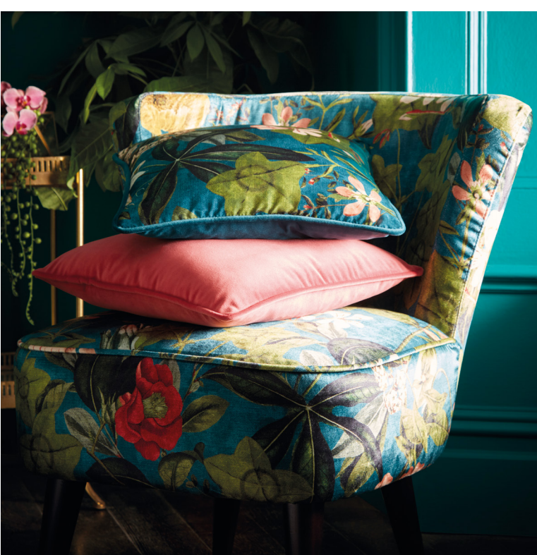
Top to bottom: Passiflora bedlinen set kingfisher, Passiflora cushion, Lexi chair Passiflora kingfisher.