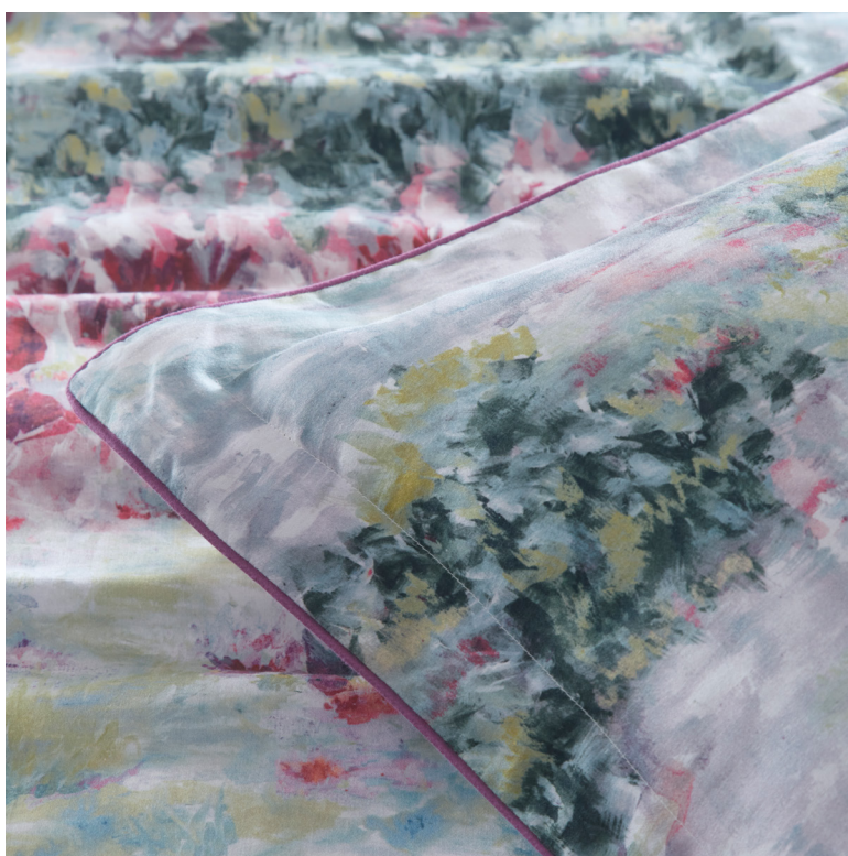
Top to bottom: Fiore cushion, velvet cushion Alvar amethyst, Ascot chair Fiore amethyst/slate, Fiore bedlinen set amethyst/slate.