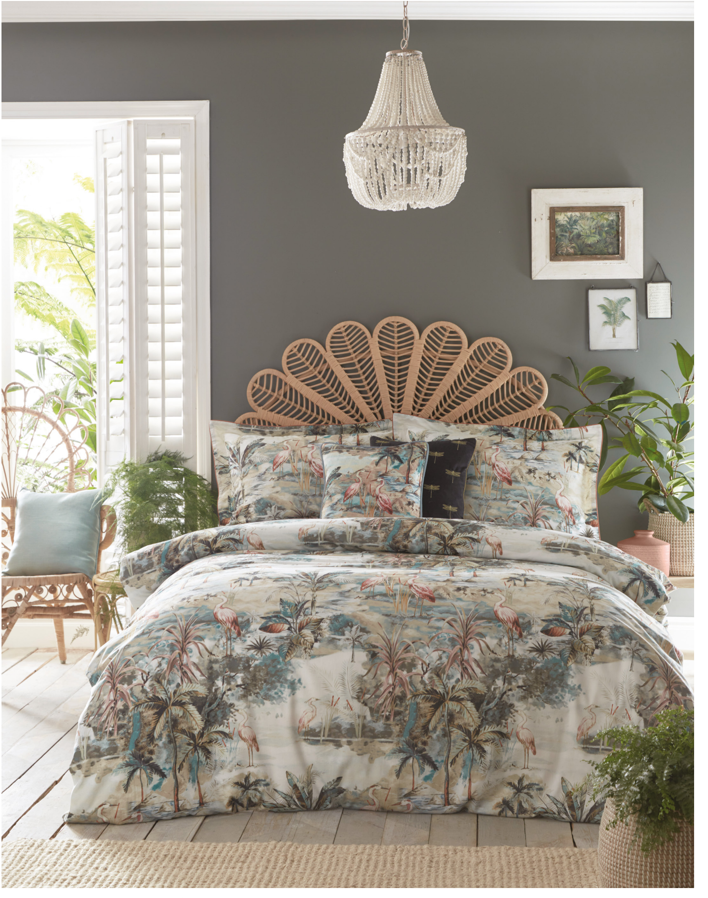
Left to right: Habitat bedlinen set mineral, Habitat cushion, Azure cushion.