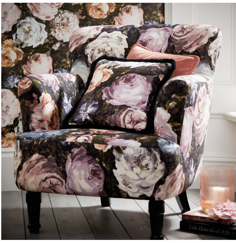
Top to bottom: Floretta bedlinen set blush, Dalston chair Floretta blush, velvet cushion Alvar rose, Floretta cushion.