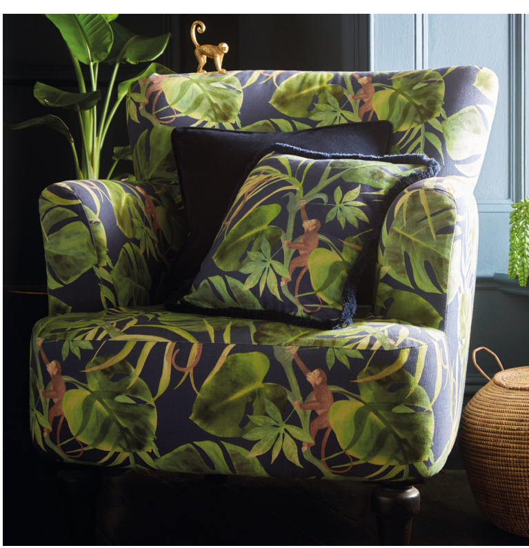
Top to bottom: Monkey Business bedlinen set indigo, Dalston chair Monkey Business indigo, velvet cushion Alvar navy, Monkey Business cushion.