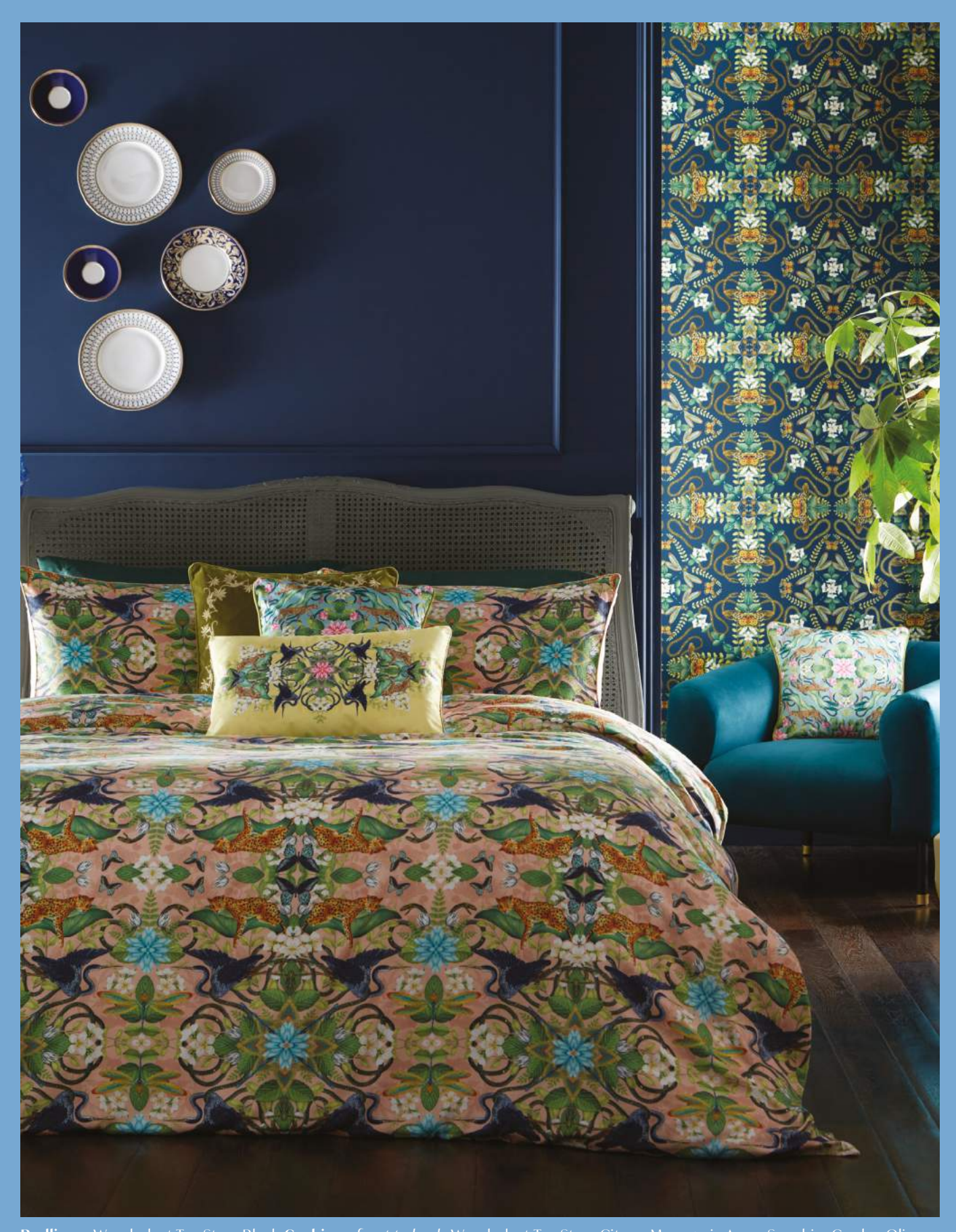
Bedlinen: Wonderlust Tea Story Blush Cushions front to back : Wonderlust Tea Story Citron, Menagerie Aqua, Sapphire Garden Olive Ceramics left to right: Wonderlust Sapphire Garden Mug, Renaissance Gold Saucer, Renaissance Gold Dinner Plate, Renaissance Gold Side Plate, Florentine Accent Wallcovering: Wonderlust Tea Story Teal