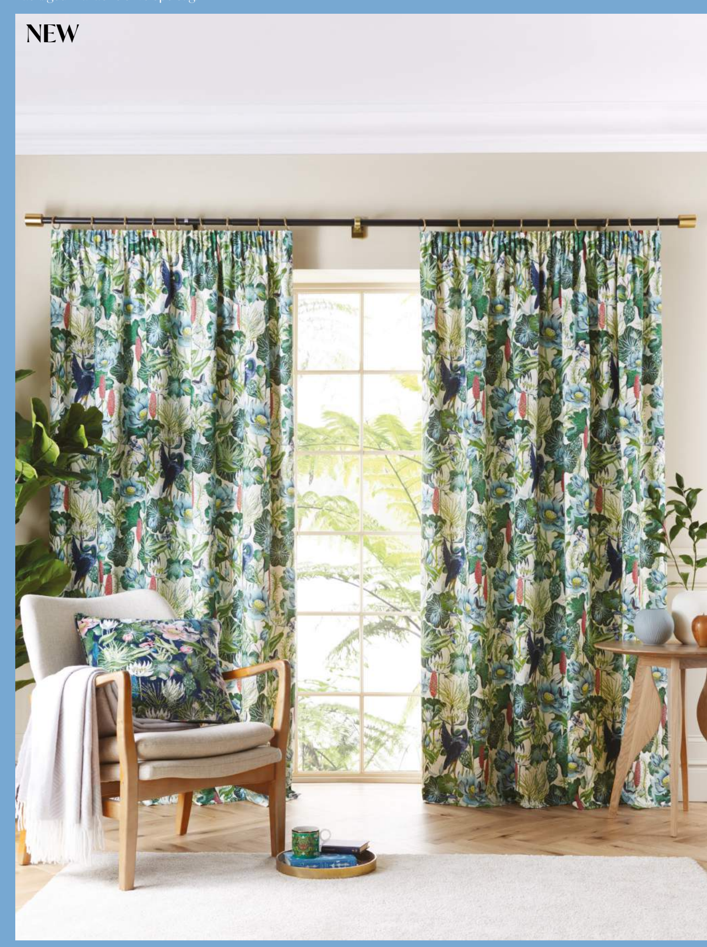
Curtains: Waterlily Natural Cushion: Waterlily Midnight Throw: Folia Smoke Ceramics left to right: Wonderlust Emerald Forest Mug, Jasper Folia Warm White Rose Bowl, White Folia Large Lithophane

The Waterlily Natural curtains have a lovely dry handle, cream polycotton lining and pencil pleat header. Packaged in a fabric envelope bag.