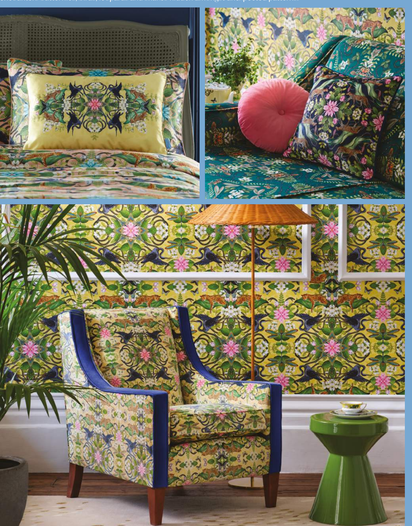
(Top left) Bedlinen: Wonderlust Tea Story Blush Cushion: Wonderlust Tea Story Citron (Top right) Sofa: Emerald Forest Teal Velvet Fabric Cushions: Alvar Candy Fabric, Menagerie Midnight (Bottom) Armchair: Wonderlust Tea Story Citron Velvet Fabric Wallcovering: Wonderlust Tea Story Citron Ceramics: Wonderlust Waterlily Teacup & Saucer, Waterlily Side Plate

From the Amazon basin's tropical heat to the humid jungles of Vietnam, harness the spirit of wanderlust and discover exotic, uncharted territories. Celebrating the world's most unusual flora and fauna, this bold, kaleidoscopic pattern encounters butterflies, birds, leopards and snakes hidden amongst unexpected patterns.