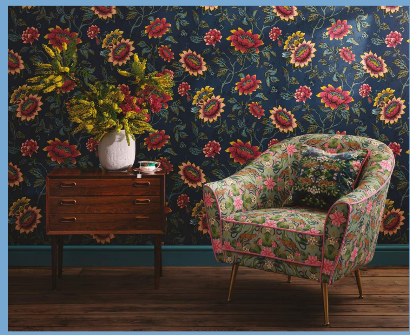
(Top left) Cushion: Firefly Emerald Bedlinen: Tonquin Midnight (Top right) Ceramics: Paeonia Blush Tea for one Bedlinen: Tonquin Midnight (Bottom) Ceramics: Jasper Folia Dove Grey Rounded Vase, Wonderlust Pink Lotus Teacup & Saucer Wallcovering: Tonquin Midnight Armchair: Menagerie Aqua Fabric Cushion: Wonderlust Tea Story Teal Velvet Fabric