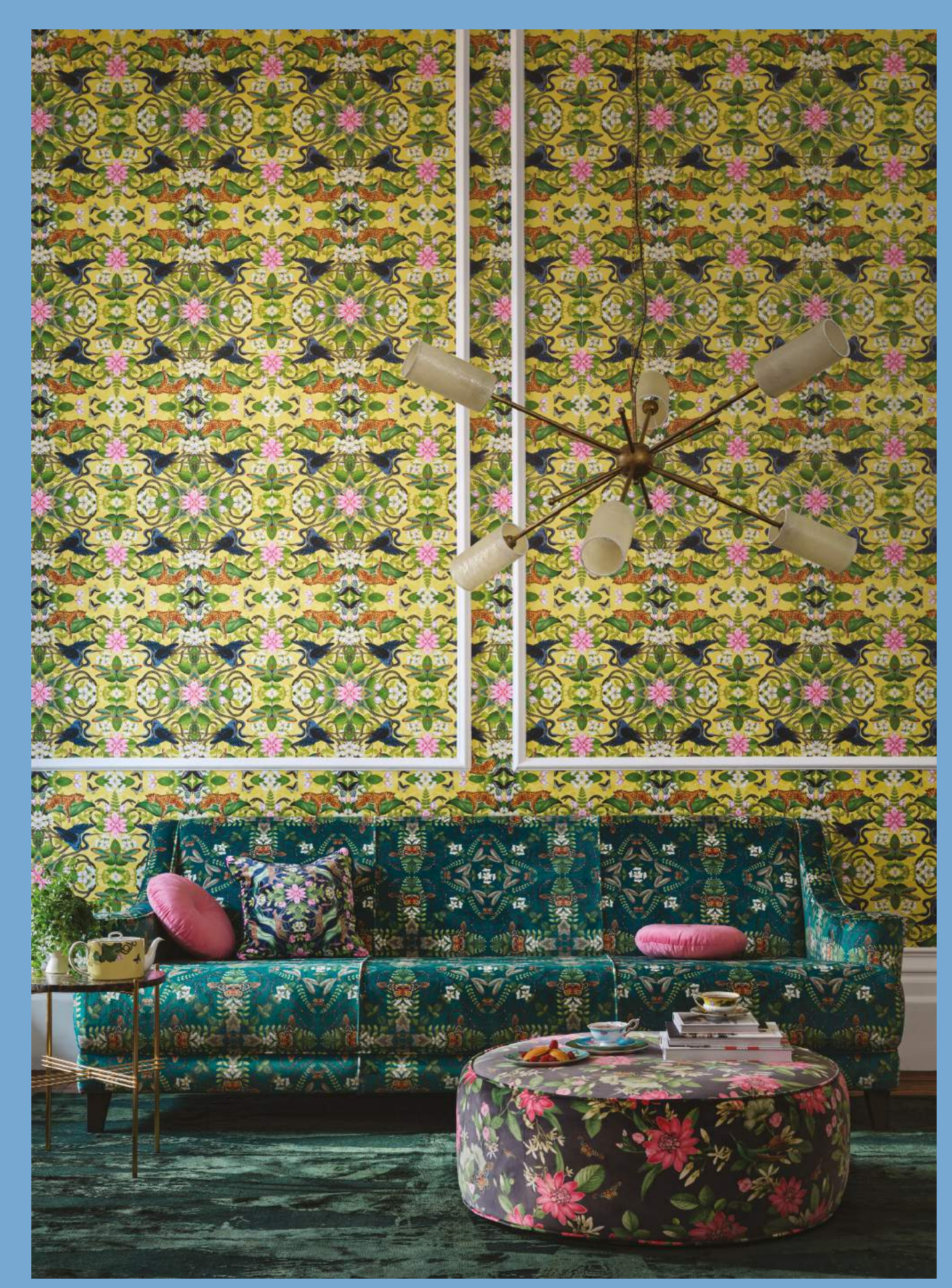
(Front Cover) Bedlinen: Hummingbird White Cushions front to back: Hummingbird Midnight, Wonderlust Tea Story Citron Sapphire Garden Olive Ceramics: Hummingbird Teacup & Saucer (Above) Wallcovering: Wonderlust Tea Story Citron Sofa: Emerald Forest Teal Velvet Fabric Cushions: Alvar Candy Fabric, Menagerie Midnight Drum: Pink Lotus Noir Velvet Fabric Ceramics: Waterlily Teapot, Wonderlust Menagerie Plate, Wonderlust Apple Blossom Teacup & Saucer, Wonderlust Fmerald Forest Plate, Wonderlust Waterlily Teacup & Saucer