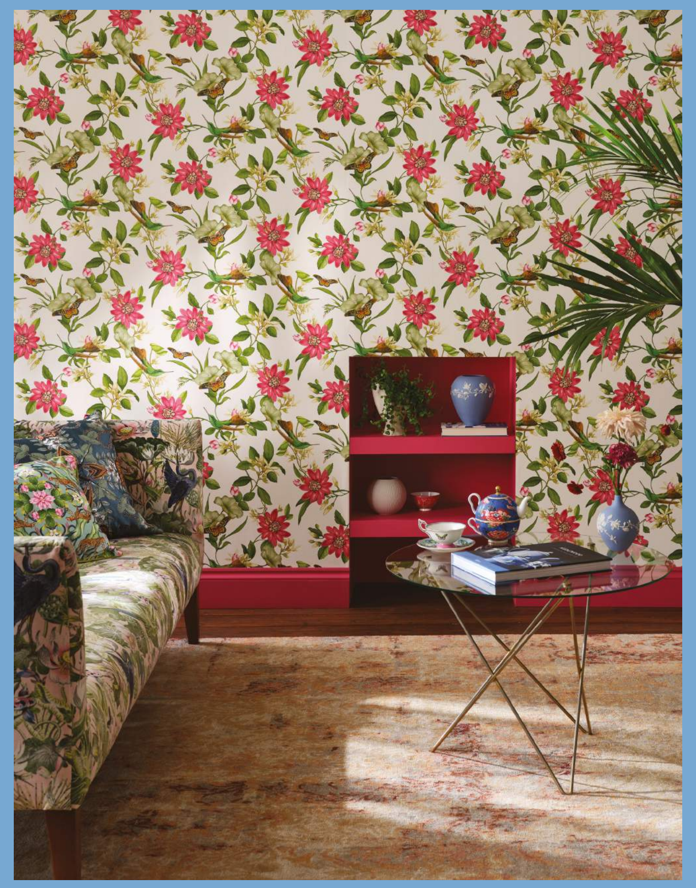
Wallcovering: Pink Lotus Ivory Sofa: Waterlily Blush Velvet Fabric Cushions left to right: Menagerie Aqua, Emerald Forest Teal Jacquard Fabric Ceramics left to right: Jasper Folia Warm White Rose Bowl, Wonderlust Crimson Jewel Bowl, Wonderlust Menagerie Teacup & Saucer, Magnolia Blossom Large Jasper Vase, Paeonia Blush Tea for one, Magnolia Blossom Jasper Bud Vase (Back page) left to right Throws: Folia Midnight, Folia Smoke Cushions: Sapphire Garden Midnight, Waterlily Midnight Curtains: Waterlily Midnight, Waterlily Natural Ceramics: Wonderlust Emerald Forest Mug