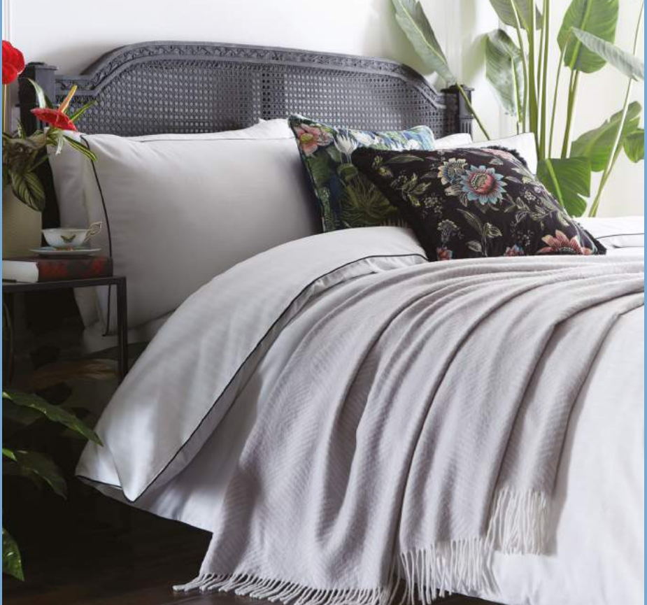
(Above) Top to bottom Cushions: Waterlily Midnight, Tonquin Noir Throw: Folia Smoke Bedlinen: Folia White