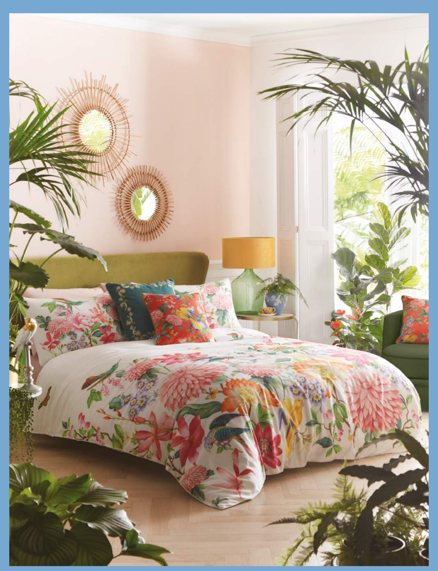
Bedlinen: Golden Parrot Ivory Cushions front to back: Golden Parrot Coral, Sapphire Garden Seagrass Ceramics left to right: Wonderlust Yellow Tonquin Teacup & Saucer, Magnolia Blossom Large Jasper Vase