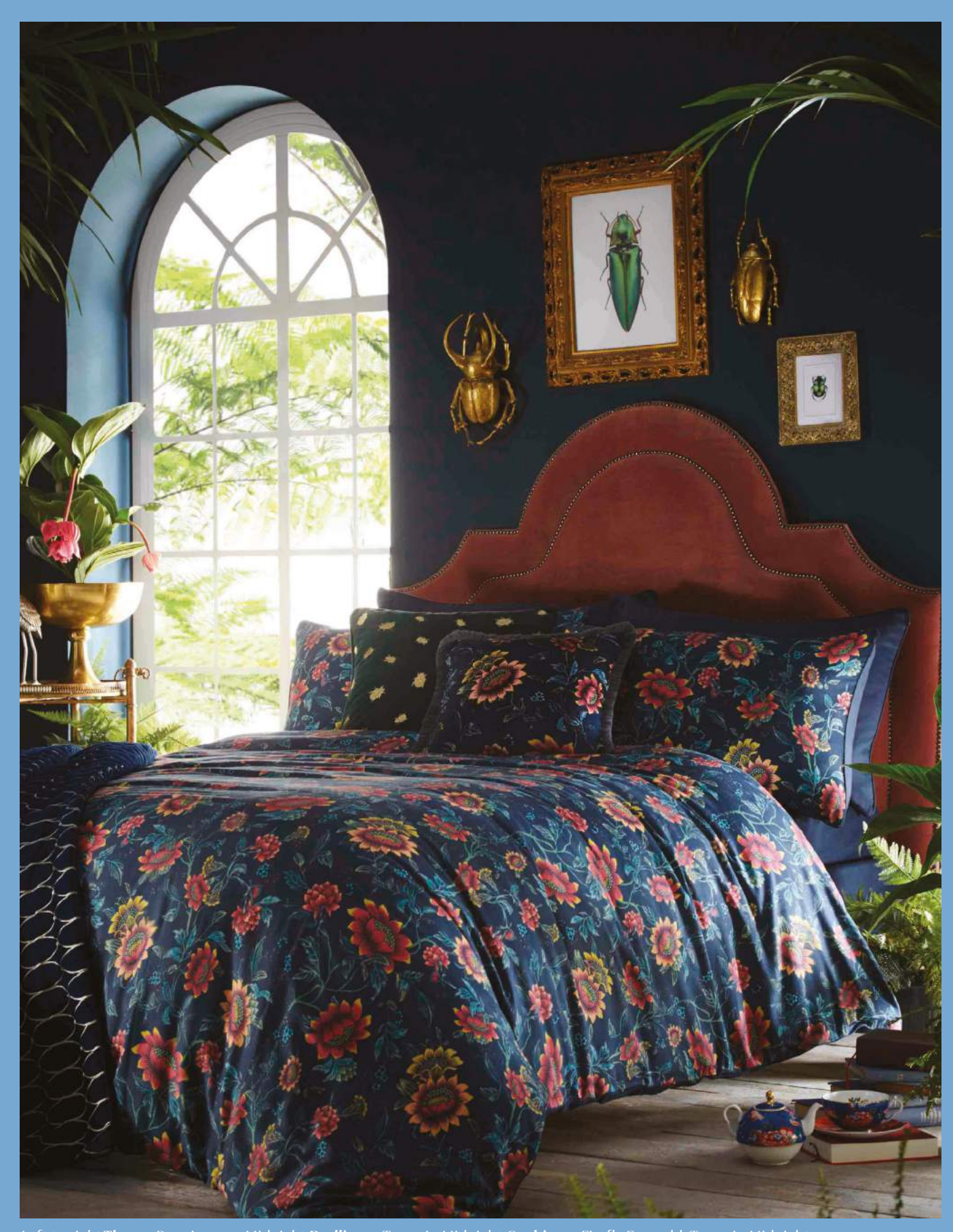
Left to right Throw : Renaissance Midnight Bedlinen : Tonquin Midnight Cushions : Firefly Emerald, Tonquin Midnight Ceramics : Paeonia Blush Tea for one