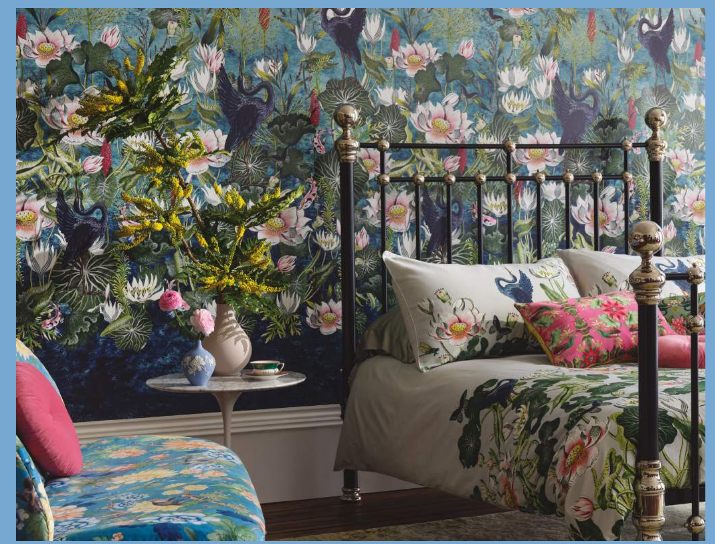
(Top left) Ceramics: Wild Strawberry Teacup & Saucer Peony and White Folia Rose Bowl Wallcovering: Waterlily Dove Sofa: Waterlily Blush Velvet Fabric Cushions left to right: Wild Strawberry Noir, Menagerie Midnight (Top right) Bedlinen: Waterlily Dove Ceramics: Magnolia Blossom Large Jasper Vase (Bottom) Wallcovering: Waterlily Marine Banner Chair: Sapphire Garden Sapphire Velvet Fabric Bedlinen: Waterlily Dove Cushions left to right: Wonderlust Tea Story, Menagerie Aqua Ceramics: Magnolia Blossom Jasper Bud Vase, Jasper Folia Powder Pink Bulb Vase, Wonderlust Pink Lotus Teacup & Saucer

These beautiful velvet curtains have a cream polycotton lining and pencil pleat header. Packaged in a fabric envelope bag.