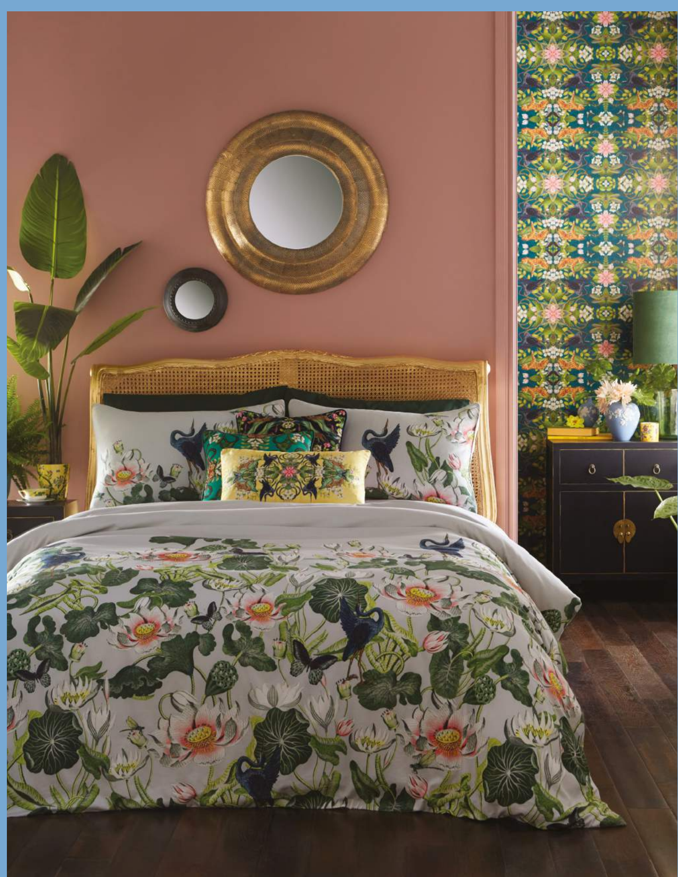
Bedlinen: Waterlily Dove Cushions front to back: Wonderlust Tea Story, Emerald Forest Emerald, Menagerie Midnight Ceramics left to right: Wonderlust Waterlily Teacup & Saucer, Magnolia Blossom Jasper Bud Vase, Magnolia Blossom Large Jasper Vase, Wonderlust Yellow Tonquin Candle Wallcovering: Wonderlust Tea Story Teal

The original Waterlily pattern today has been developed in colour as part of Wedgwood's new Wonderlust collection - a wonderful nod to the past, with a modern, creative and eclectic Wedgwood twist. Waterlily Dove is printed onto luxurious 200 thread count cotton sateen.