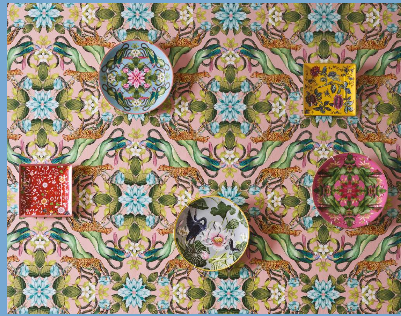
( Top left ) Bedlinen : Magnolia Wedgwood Jasper Cushion : Menagerie Aqua ( Top right ) Wallcovering : Tonquin Midnight Armchair : Menagerie Aqua Fabric Cushion : Wonderlust Tea Story Teal Velvet Fabric ( Bottom ) Wallcovering : Menagarie Blush Ceramics left to right : Wonderlust Crimson Jewel Tray, Wonderlust Menagerie Plate, Wonderlust Waterlily Plate, Wonderlust Yellow Tonquin Tray, Wonderlust Pink Lotus Plate