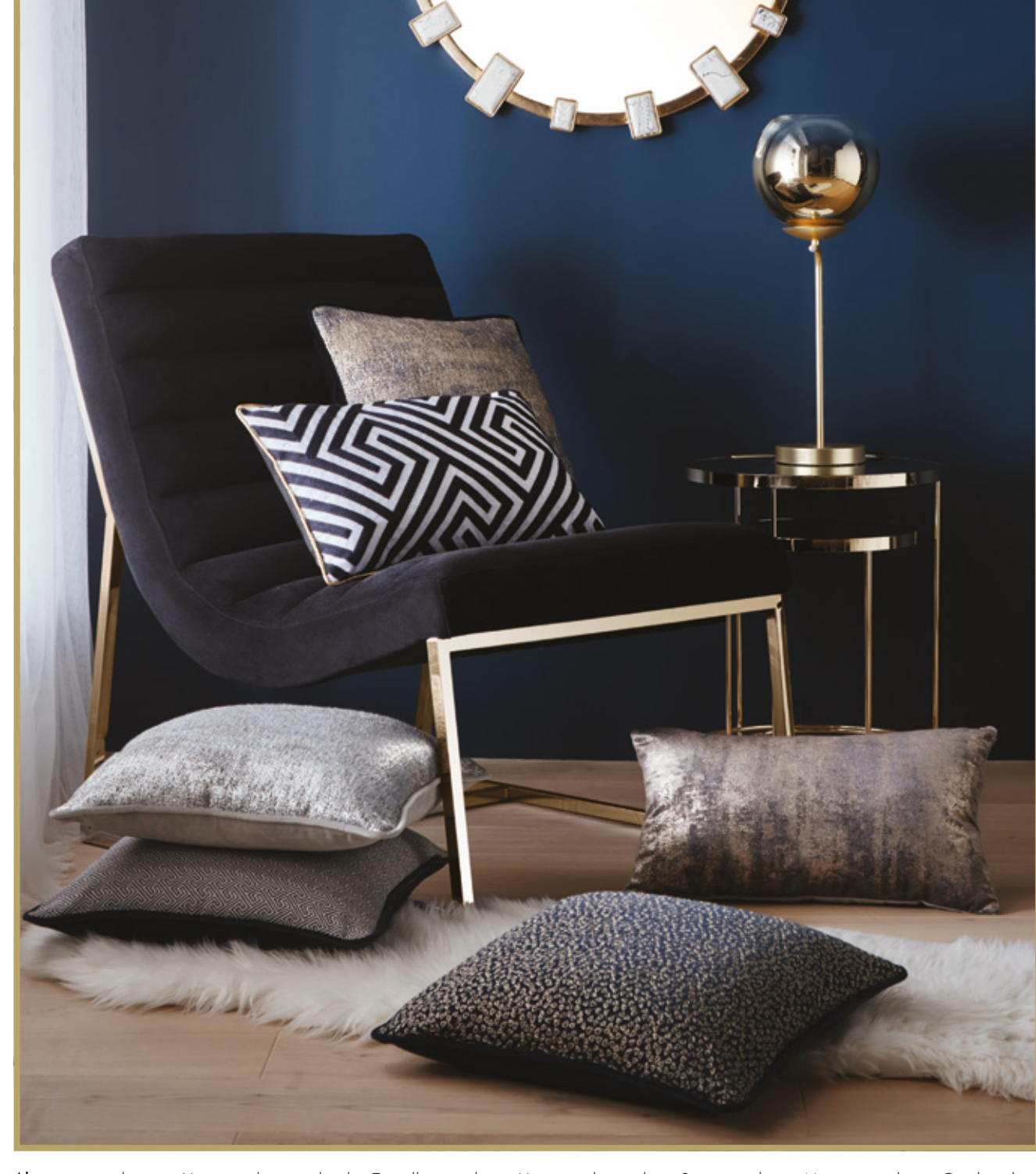
Above top to bottom: Venus cushion midnight, Tessellate cushion, Venus cushion silver, Saturn cushion, Mercury cushion, Opal cushion.