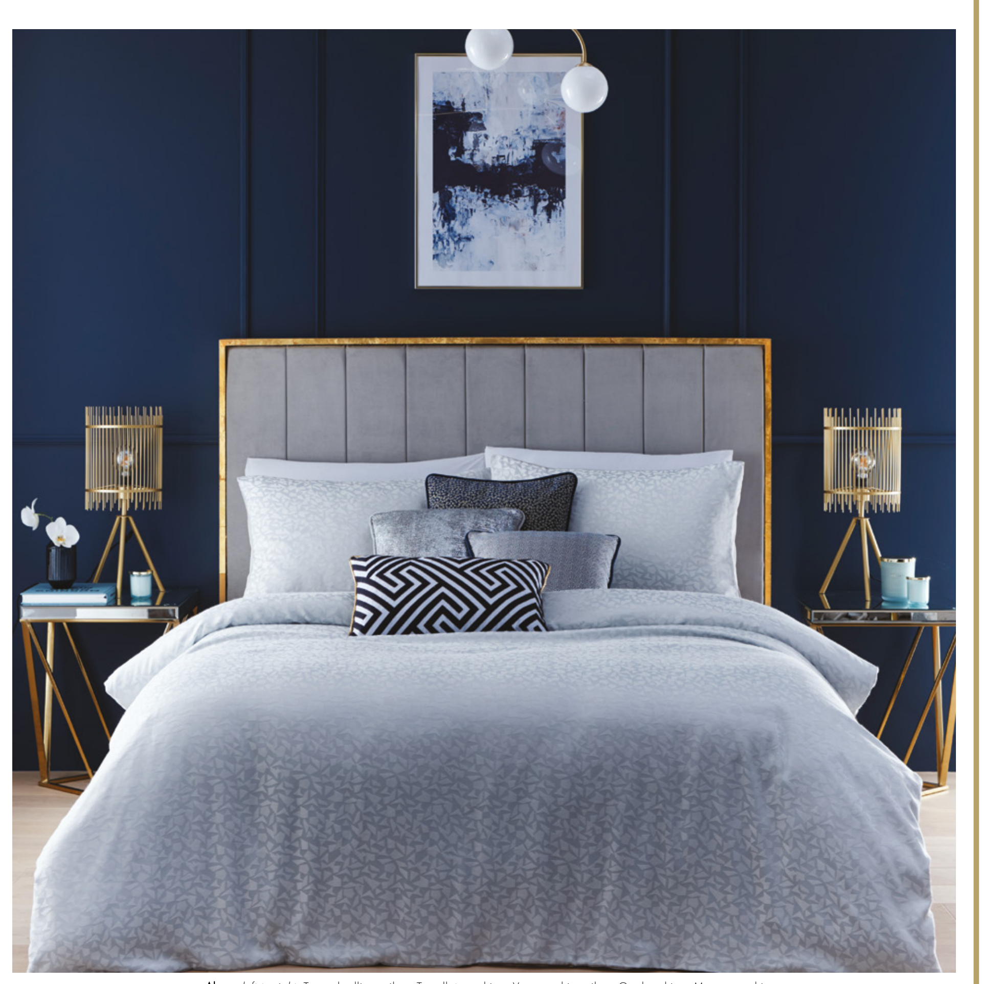
Above left to right: Topaz bedlinen silver, Tessellate cushion, Venus cushion silver, Opal cushion, Mercury cushion.