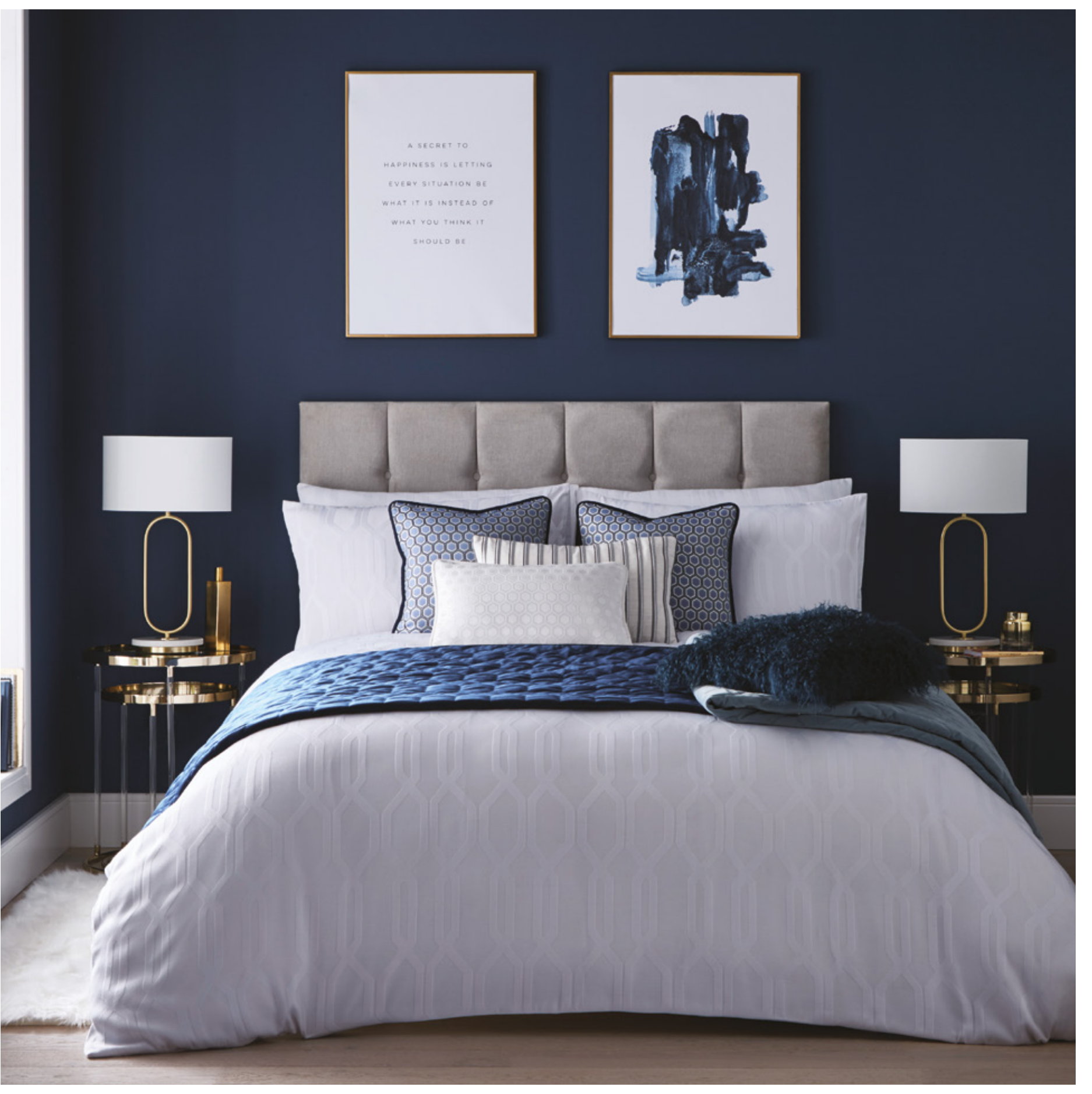
Above top to bottom: Quartz bedlinen, Hexagon cushion navy, Metallic Stripe boudoir, Hexagon boudoir cushion white, Geometric Velvet throw midnight and duckegg, Faux Mongolian cushion midnight.