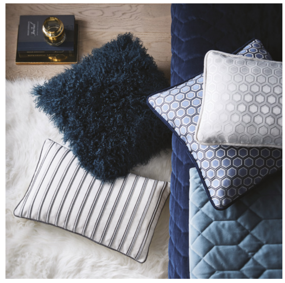
Above left to right: Faux Mongolian cushion midnight, Metallic Stripe boudoir, Geometric Velvet throw midnight & duckegg, Hexagon cushion navy, Hexagon boudoir cushion white.

Quartz bedlinen provides a contemporary update to your interior. For an extra touch of luxury, layer up with the Geometric velvet throw and accompanying Hexagon and Metallic Stripe cushions.