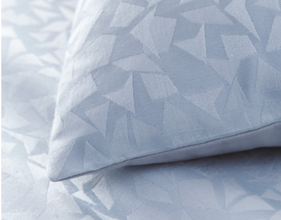
Above left to right: Topaz bedlinen silver, Venus cushion silver, Tessellate cushion, Opal cushion, Mercury cushion.