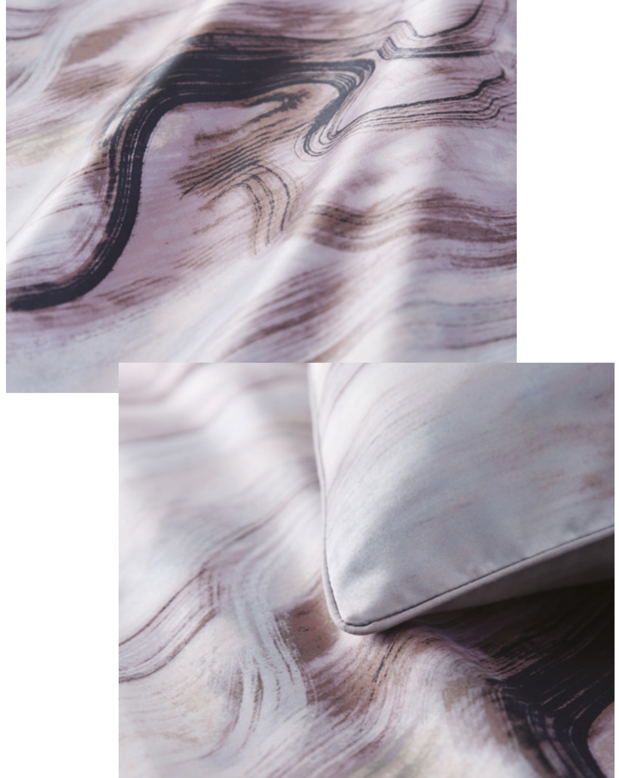
Left top to bottom: Galaxy bedlinen, Venus cushion silver, Saturn cushion.

Drift off into a galaxy of calming sleep, wrapped in the painterly swirls of this beautiful bedlinen. Layer with the metallic Venus Silver and Saturn cushions for an extra touch of luxury.