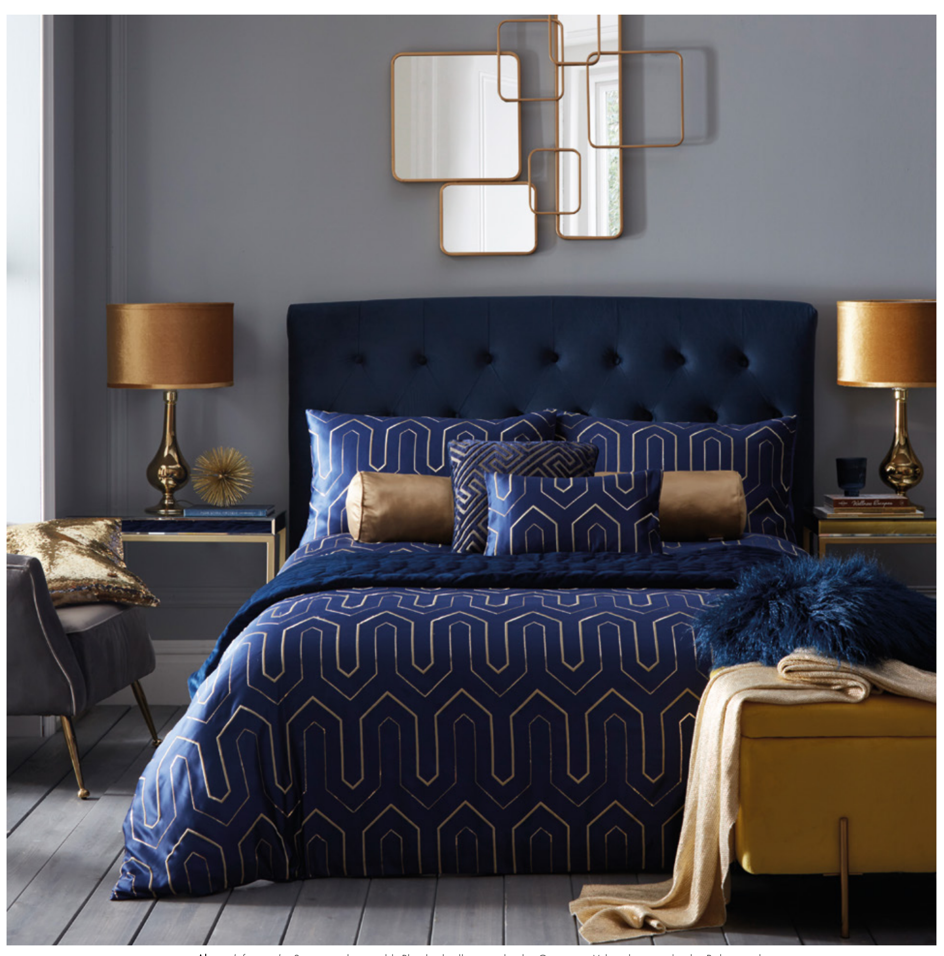
Above left to right : Sequin cushion gold, Phoebe bedlinen midnight, Geometric Velvet throw midnight, Bolster cushion, Phoebe Boudoir cushion midnight, Knit throw gold, Faux Mongolian cushion midnight.