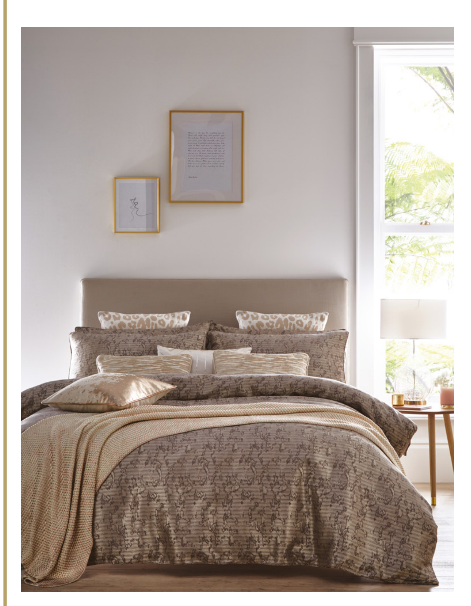
Above left to right: Knit Leopard cushion, Lux bedlinen, Phoebe boudoir cushion champagne, Splatter Foil print cushion, Knit throw rose gold.