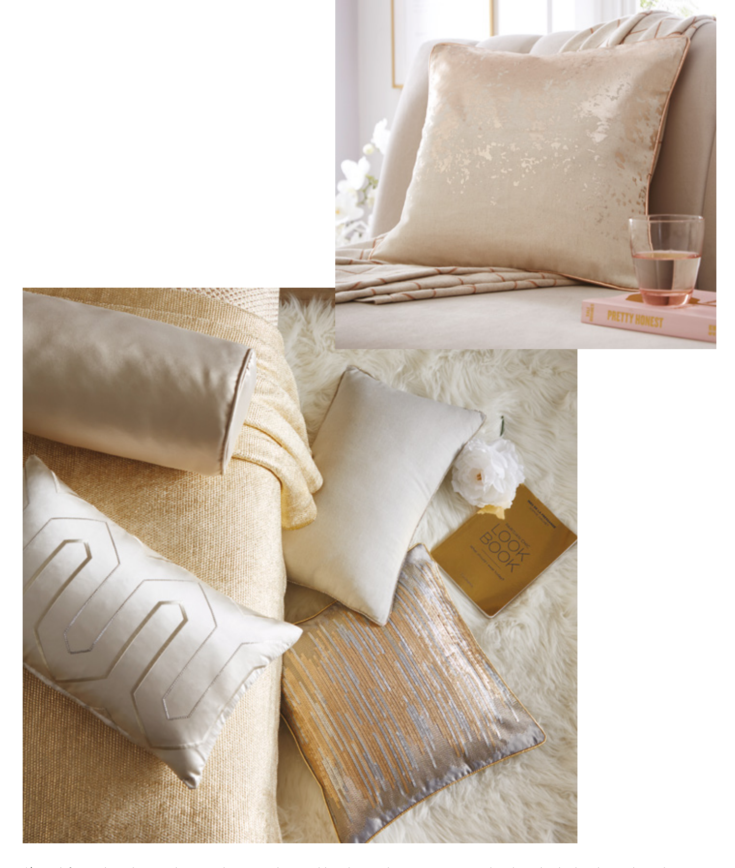
Above left to right: Splatter Foil print cushion, Knit throw gold, Bolster cushion, Diamante Trim boudoir, Phoebe boudoir cushion champagne, Shimmer Sequin cushion.

Create a statement with this luxurious woven bedlinen. Paired with the complementing metallic throw and cushion accessories, this bedroom update oozes indulgence.