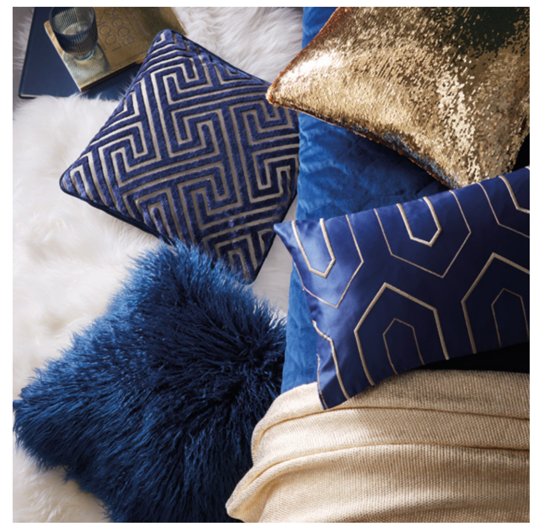
Above top to bottom: Sequin cushion gold, Geometric Velvet throw midnight, Phoebe Boudoir cushion midnight, Faux Mongolian cushion midnight, Knit throw gold.

Phoebe is reimagined in a decadent midnight colourway for an inspired art-deco look. The labyrinth pattern of gold embroidery works its way across this glamorous satin bedlinen, complete with sequin detailing. Add to the 1920s look with beautiful bolster cushions and coordinating Phoebe boudoir cushion in the same deep midnight colourway.