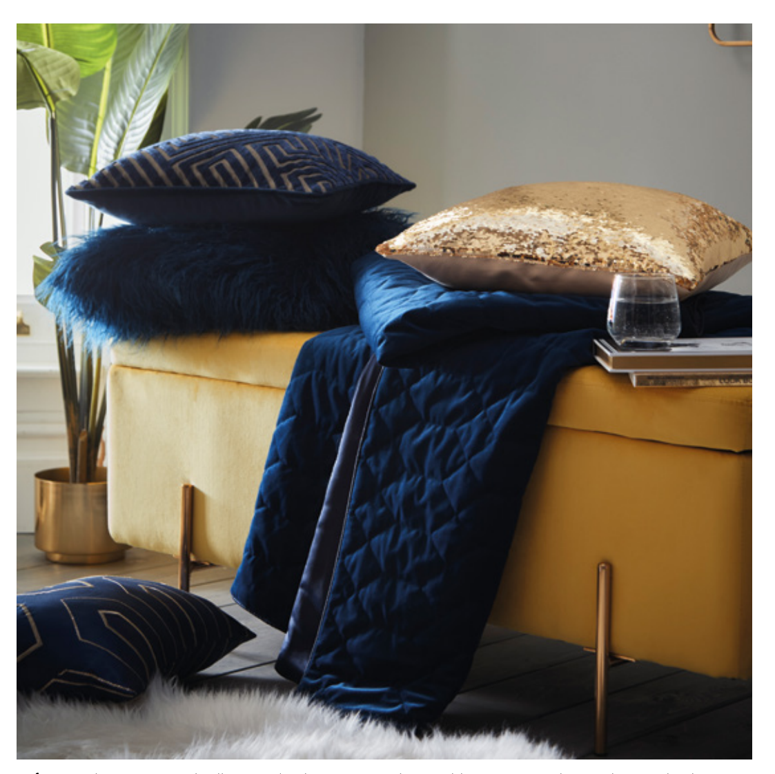
Left top to bottom: Topaz bedlinen midnight, Sequin cushion gold, Faux Mongolian cushion midnight, Knit throw gold Above top to bottom: Faux Mongolian cushion midnight, Sequin cushion gold, Geometric Velvet throw midnight, Phoebe cushion midnight.

A geometric jacquard comprised of intricate tessellated shapes. Topaz midnight adds a stylish edge to your bedroom.