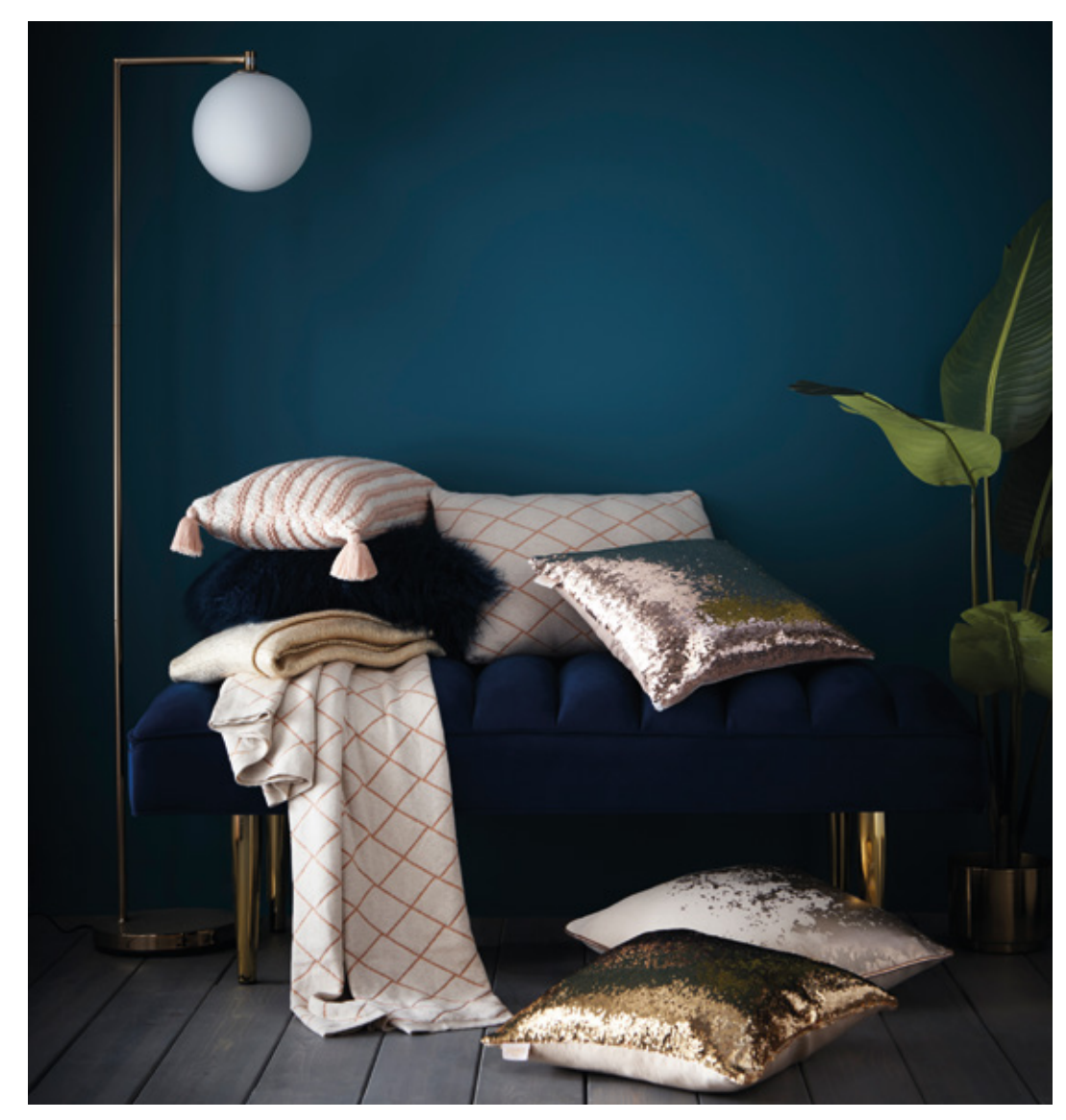
Left top to bottom: Amber pillowcases, Zebra bedlinen, Faux Mongolian cushion blush, Splatter Foil Print cushion, Sequin cushion rose gold, Knitted Stripe cushion, Knit throw gold Above top to bottom: Knitted Stripe cushion, Diamond Knit cushion, Faux Mongolian cushion midnight, Sequin cushion rose gold, Knit throw gold, Diamond Knit throw, Splatter Foil print cushion, Sequin cushion gold.

Add a touch of glamour to your bedroom with this sumptuous cotton jacquard. This fresh white bedlinen is finished with a sophisticated oxford edge. Style with the tasseled knitted stripe cushion and faux Mongolian cushion in blush for a cosy feel.