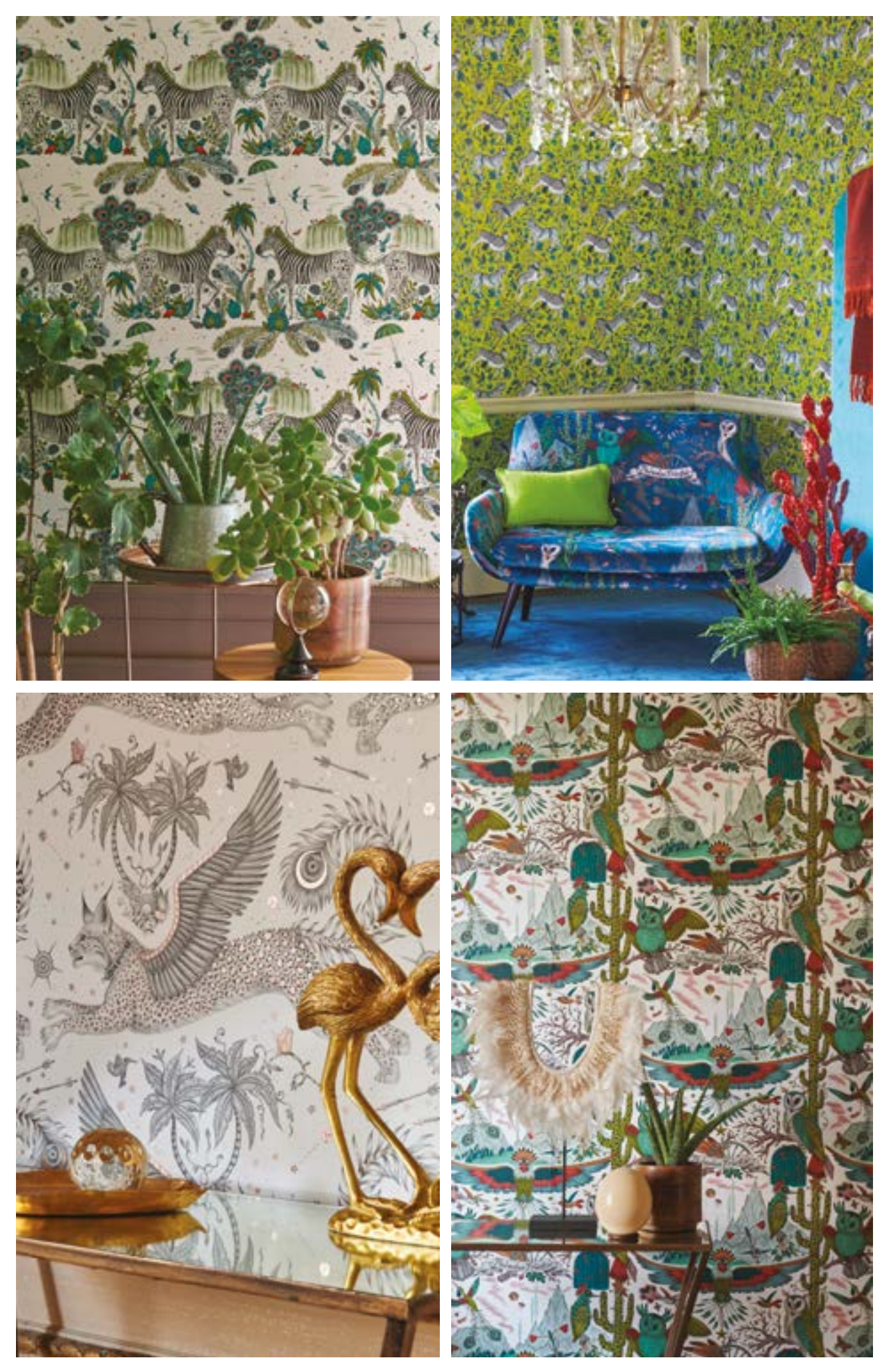
(Top Left) Wallcovering: Lost World Green (Top Right) Wallcovering: Protea Lime Chair: Frontier Teal (Bottom Left) Wallcovering: Lynx Nude (Bottom Right) Wallcovering: Frontier Green