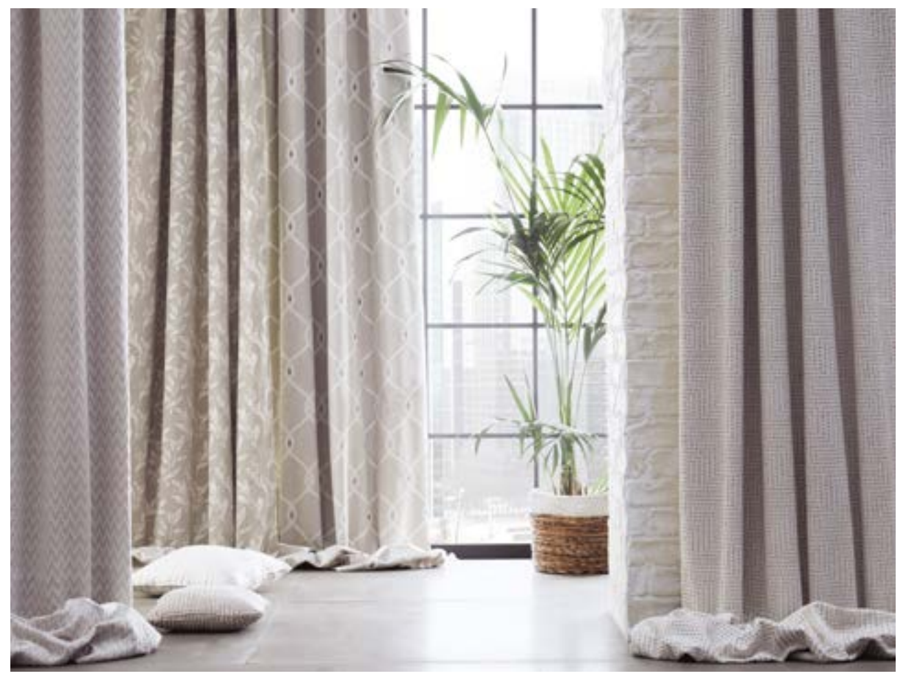
(Top Left) Drape: Paragon Ivory/Linen Chairs left to right: Urban Ivory/Linen, Aztec Ivory mixed with Ramie Ivory (Top Right) Cushions top to bottom: Mizo, Urban, Insignia Charcoal, Martinque Pewter, Aztec Charcoal (Bottom) Drapes left to right: Gallioni, Eternal Ivory, Opus Linen, Solitaire Ivory/Linen