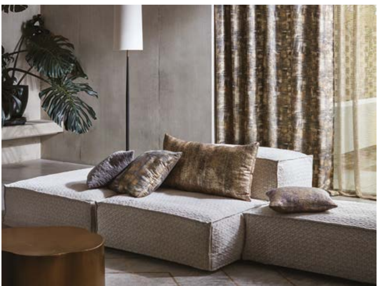
(Top Left) Cushion: Tessellati Natural/Gilver Throw: Maddox Pebble (Top Right) Headboard: Quarzo Ivory Cushions: Oro Ivory/Gold (Bottom) Drapes left to right: Tessellati Charcoal/Gold, Maddox Antique Cushions left to right: Quarzo Slate, Oro Ebony/Gold Sofa: Quarzo Dove