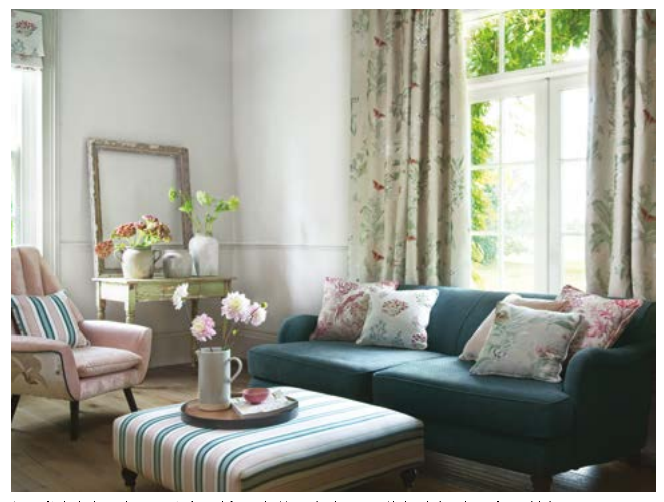
(Top Left) Blind: Floris Chartreuse Cushions left to right: Monarch Chartreuse, Abelia Blush, Belvoir Charcoal/Chartreuse Chair: Kauai Linen Drum: Avium Charcoal (Top Right) Cushions top to bottom: Floris Summer, Belvoir Emerald/Blush, Abelia Emerald, Avium Raspberry (Bottom) Drapes: Monarch Summer Sofa: Kauai Kingfisher