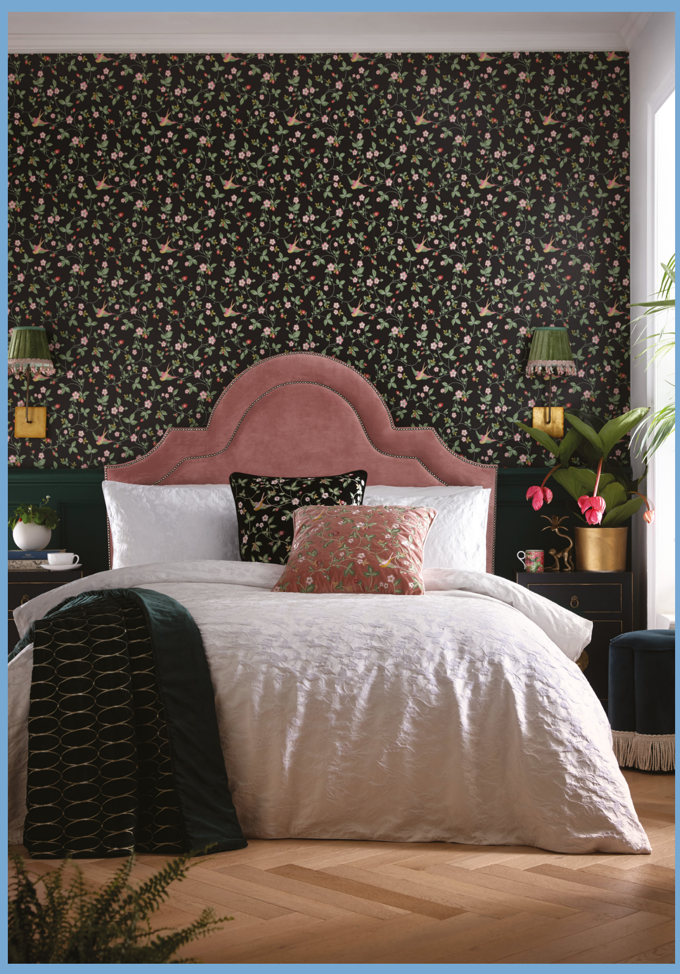
Wallcovering: Wild Strawberry Noir Cushions front to back: Wild Strawberry Blush, Noir Bedlinen: Wild Strawberry White Throw: Renaissance Emerald Ceramics left to right: White Folia Rose Bowl, Wild Strawberry White Teacup & Saucer, Wonderlust Pink Lotus Mug