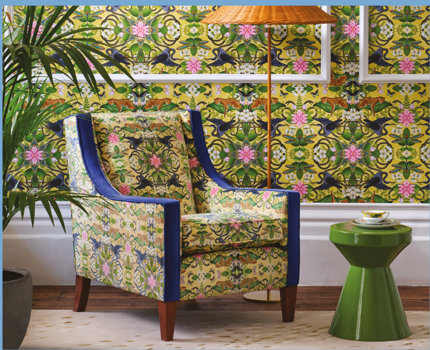
( Top left ) Bedlinen: Waterlily Dove Cushion: Wonderlust Tea Story Citron ( Top right ) Sofa: Emerald Forest Teal Velvet Fabric Cushions: Alvar Candy Fabric, Menagerie Midnight ( Bottom ) Armchair: Wonderlust Tea Story Citron Velvet Fabric Wallcovering: Wonderlust Tea Story Citron Ceramics: Wonderlust Waterlily Teacup & Saucer