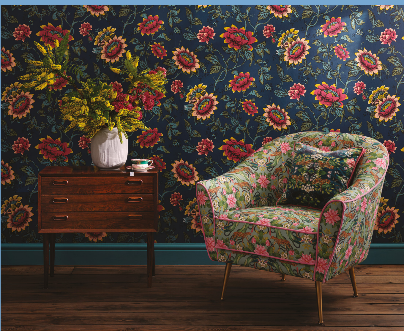
( Top left ) Cushion: Firefly Emerald Bedlinen: Tonquin Midnight ( Top right ) Ceramics: Paeonia Blush Tea for one Bedlinen: Tonquin Midnight ( Bottom ) Ceramics: Jasper Folia Dove Grey Rounded Vase, Wonderlust Pink Lotus Teacup & Saucer Wallcovering: Tonquin Midnight Armchair: Menagerie Aqua Fabric Cushion: Wonderlust Tea Story Teal Velvet Fabric