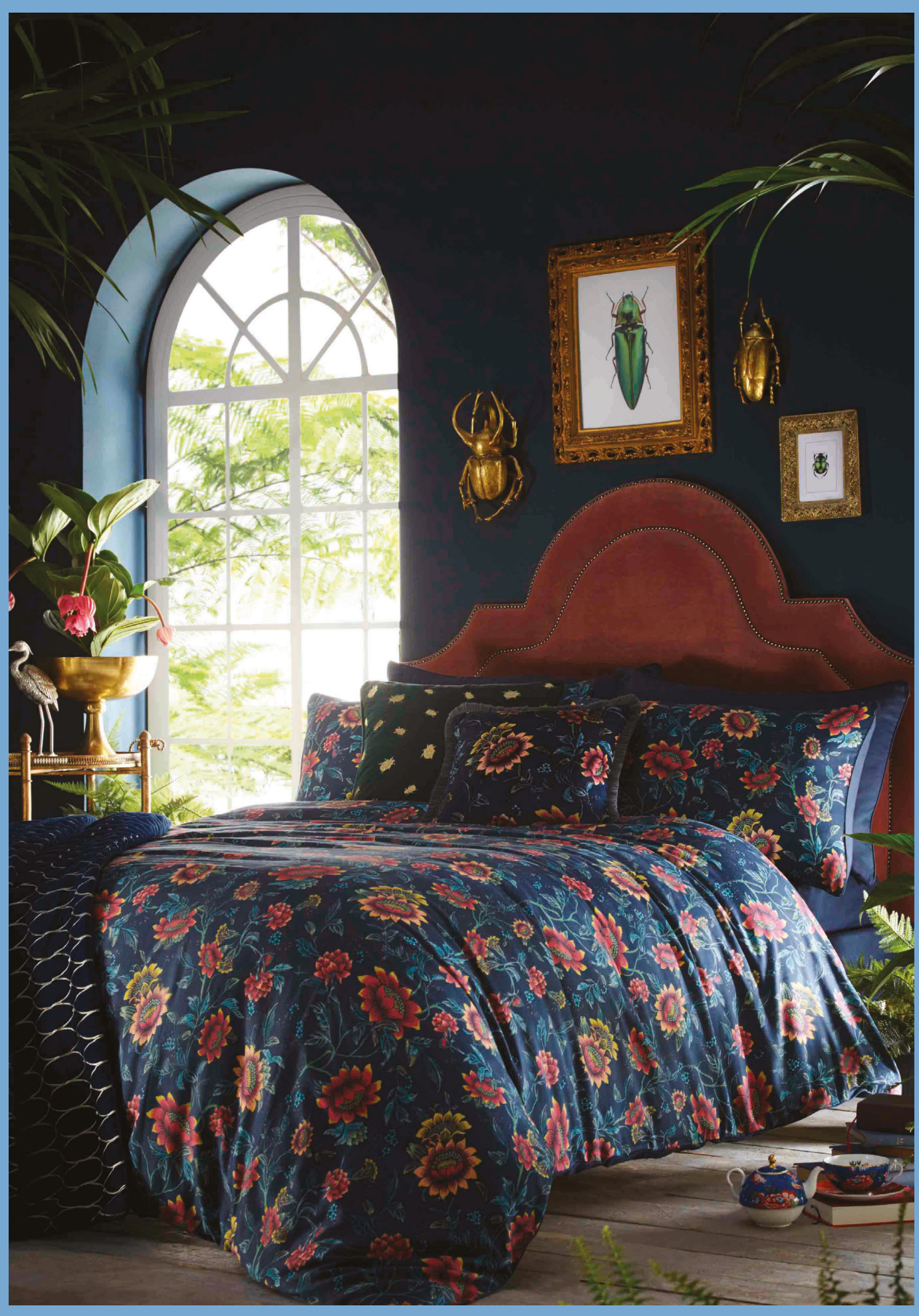
Left to right Throw: Renaissance Midnight Bedlinen: Tonquin Midnight Cushions: Firefly Emerald, Tonquin Midnight Ceramics: Paeonia Blush Tea for one