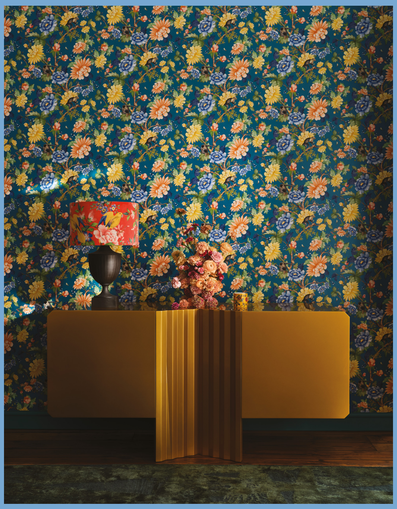
Wallcovering: Sapphire Garden Sapphire Lampshade: Golden Parrot Coral Velvet Fabric Ceramics: Wonderlust Yellow Tonquin Candle

Take a voyage of discovery through our Sapphire Garden and make friends with native Rhesus Macaques. Inspired by the Grand Tour from Europe through Asia, this fabric is heavily influenced by Wedgwood's archival patterns. Featuring temple-dwelling monkeys, Indian decorative designs and exotic colours, it will take your interior on a grand tour of its own.