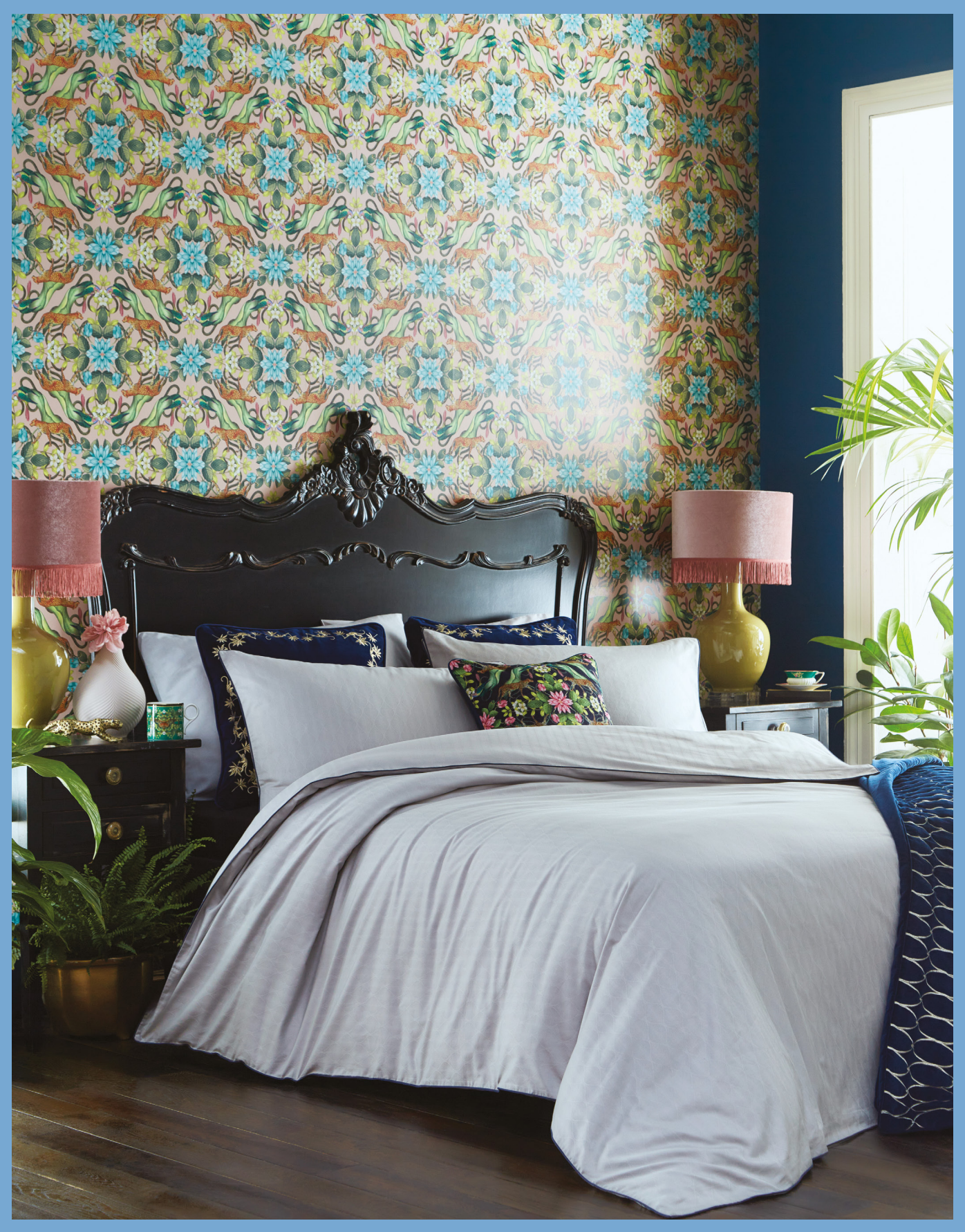
Wallcovering: Menagerie Blush Ceramics left to right: Jasper Folia Powder Pink Bulb Vase, Wonderlust Emerald Forest Mug, Wonderlust Pink Lotus Teacup & Saucer Bedlinen: Folia Smoke Cushions front to back: Menagerie Midnight, Sapphire Garden Midnight Throw: Renaissance Midnight

Nature can be good for the soul and for a restful night's sleep. Fresh air and lush foliage are the inspiration for this calming bedlinen set, that's woven from 100% cotton. Available in a choice of three sizes, the natural design of blooming flowers and verdant leaves create a relaxing simplicity. Framed by contrasting Midnight piping and with two pillowcases included, Folia comes in double, king and super king sizes.