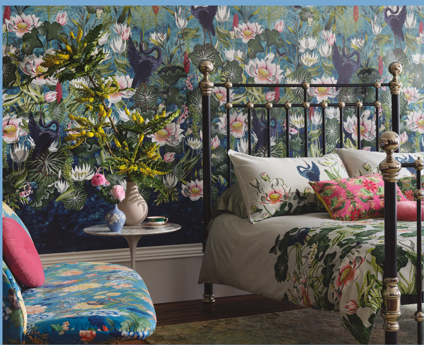
( Top left ) Ceramics : Wild Strawberry Teacup & Saucer Peony and White Folia Rose Bowl Wallcovering : Waterlily Dove Sofa : Waterlily Blush Velvet Fabric Cushions left to right : Wild Strawberry Noir, Menagerie Midnight ( Top right ) Bedlinen : Waterlily Dove Ceramics : Magnolia Blossom Large Jasper Vase ( Bottom ) Wallcovering : Waterlily Marine Banner Chair : Sapphire Garden Sapphire Velvet Fabric Bedlinen : Waterlily Dove Cushions left to right : Wonderlust Tea Story, Menagerie Aqua Ceramics : Magnolia Blossom Jasper Bud Vase, Jasper Folia Powder Pink Bulb Vase, Wonderlust Pink Lotus Teacup & Saucer