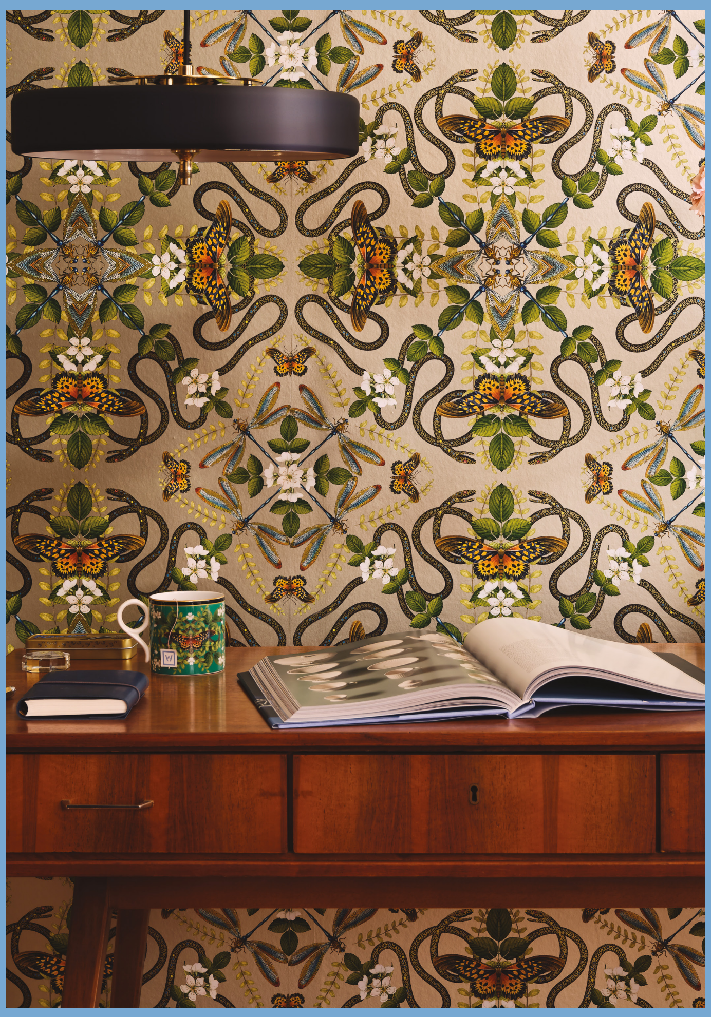
Wallcovering: Emerald Forest Gilver Ceramics: Wonderlust Emerald Forest Mug