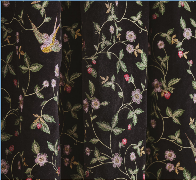
(Top) left to right Ceramics: Jasper Folia Powder Pink Mini Pot, Jasper Folia Powder Pink Bulb Vase, The Floral Eden Venus Bust Wallcovering: Wild Strawberry Noir (Bottom left) Bedlinen: Wild Strawberry White Ceramics: White Folia Rose Bowl (Bottom right) Drape: Wild Strawberry Noir Embroidered Fabric