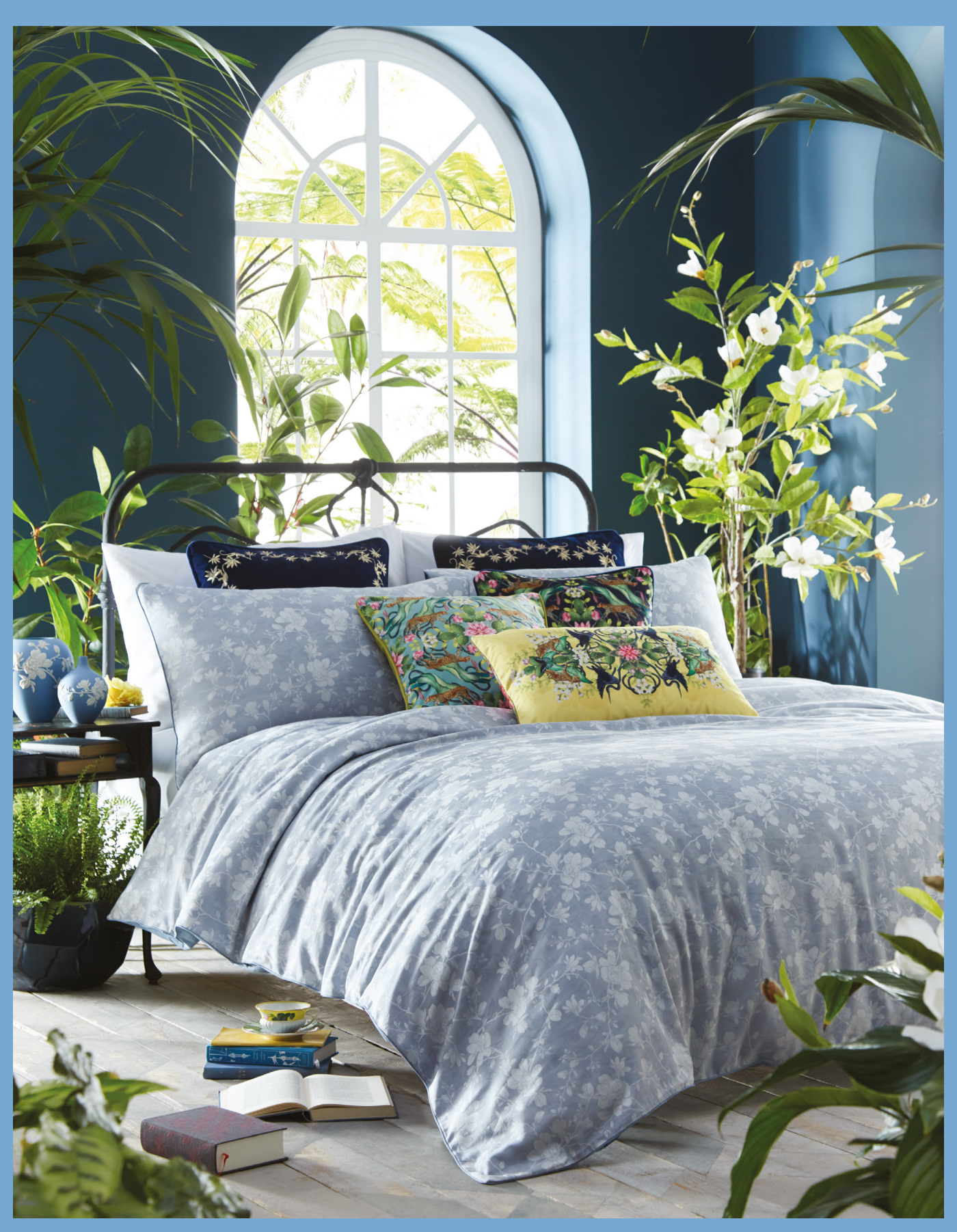
Ceramics top to bottom: Magnolia Blossom Large Jasper Vase, Magnolia Blossom Jasper Bud Vase, Wonderlust Waterlily Teacup & Saucer Bedlinen: Magnolia Wedgwood Jasper Cushions front to back: Wonderlust Tea Story Citron, Menagerie Aqua, Midnight, Sapphire Garden Midnight

Nothing says Wedgwood like blue and white Jasperware. With its quintessentially English colour palette, this duvet set is woven in 100% cotton and encased by a delicate cord piping. A new take on an iconic design, our interpretation includes two matching pillowcases that showcase the same exquisitely sculpted magnolia tree petals as the duvet cover. Available in double, king and super king sizes.