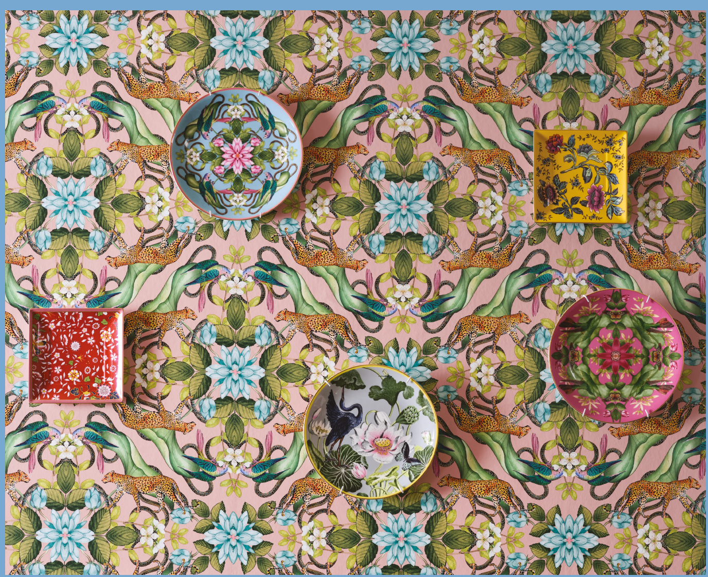
( Top left ) Bedlinen : Magnolia Wedgwood Jasper Cushion : Menagerie Aqua ( Top right ) Wallcovering : Tonquin Midnight Armchair : Menagerie Aqua Fabric Cushion : Wonderlust Tea Story Teal Velvet Fabric ( Bottom ) Wallcovering : Menagarie Blush Ceramics left to right : Wonderlust Crimson Jewel Tray, Wonderlust Menagerie Plate, Wonderlust Waterlily Plate, Wonderlust Yellow Tonquin Tray, Wonderlust Pink Lotus Plate