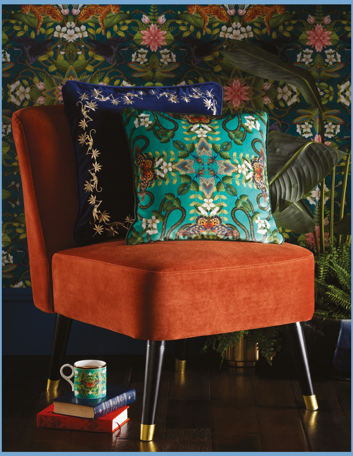
Wallcovering: Wonderlust Tea Story Teal Cushions front to back: Emerald Forest Emerald, Sapphire Garden Midnight Ceramics: Wonderlust Emerald Forest Mug

Step into Emerald Forest's fantastical wonderland and lose yourself amongst lush, abundant foliage. Packed full of flora and fauna, this verdant pattern is reminiscent of a whimsical walk amongst ancient English woodland.