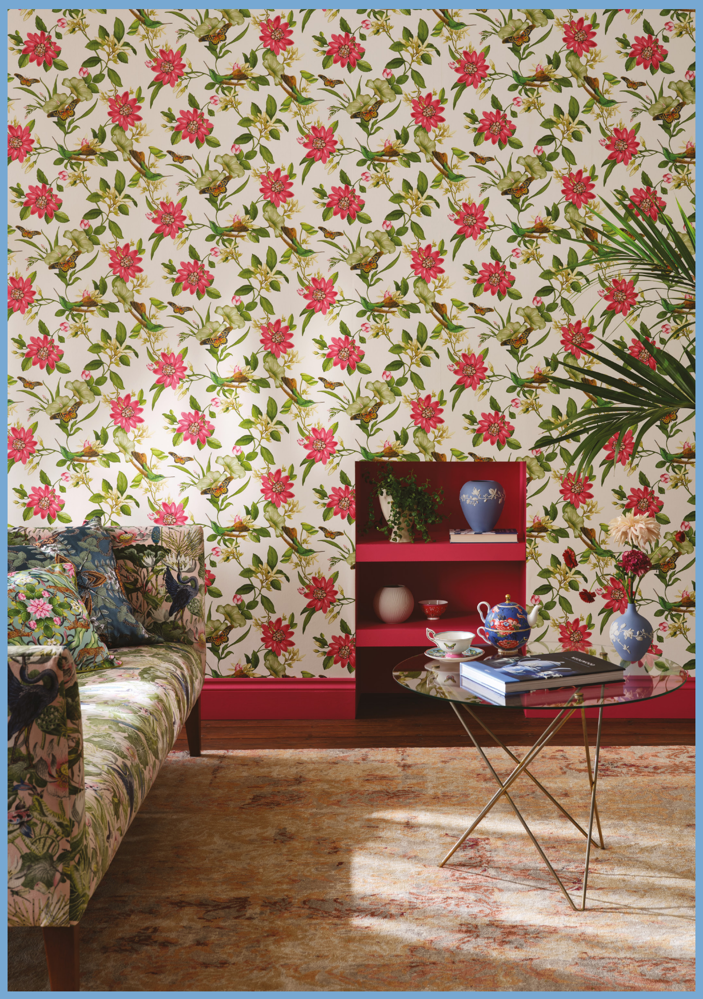
Wallcovering: Pink Lotus Ivory Sofa: Waterlily Blush Velvet Fabric Cushions left to right: Menagerie Aqua, Emerald Forest Teal Jacquard Fabric Ceramics left to right: Jasper Folia Warm White Rose Bowl, Wonderlust Crimson Jewel Bowl, Wonderlust Menagerie Teacup & Saucer, Magnolia Blossom Large Jasper Vase, Paeonia Blush Tea for one, Magnolia Blossom Jasper Bud Vase (Back page) Wallcovering: Wild Strawberry Noir Cushions top to bottom: Wild Strawberry Blush, Noir Throw: Renaissance Emerald Ceramics: White Folia Rose Bowl