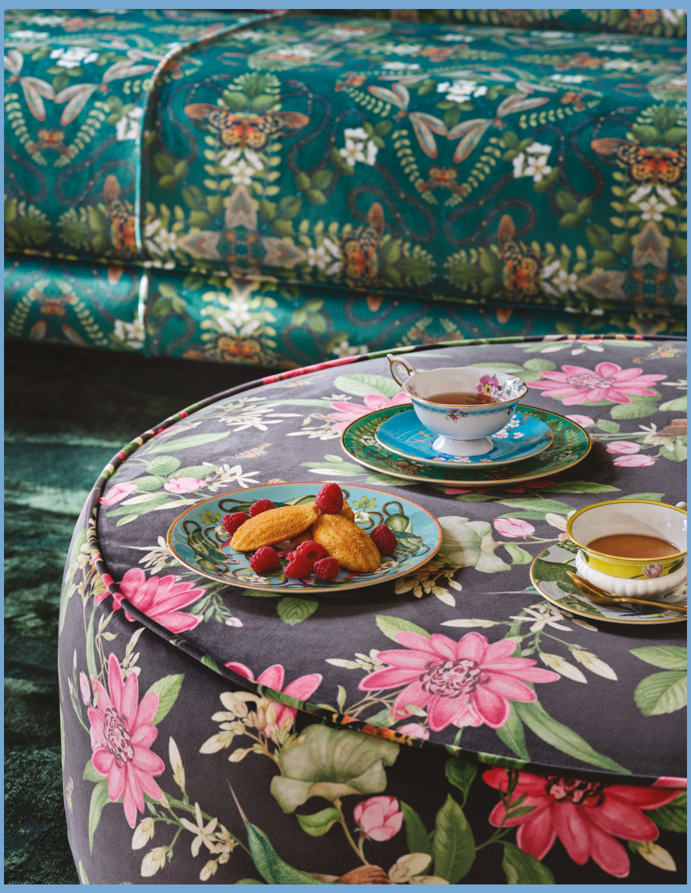
Sofa: Emerald Forest Teal Velvet Fabric Drum: Pink Lotus Noir Velvet Fabric Ceramics left to right: Wonderlust Menagerie Plate, Wonderlust Emerald Forest Plate, Wonderlust Apple Blossom Teacup & Saucer, Wonderlust Waterlily Teacup & Saucer

A symbol of inner wisdom and the sanctity of daily life, the Pink Lotus is considered a sacred flower in the tropics of Asia. Typically found in marshy swamps, it produces gigantic fragrant blossoms and leaves, a haven for flying insects such as bejewelled dragonflies. The delicate balance of daily life is celebrated in this bold and beautiful pattern.