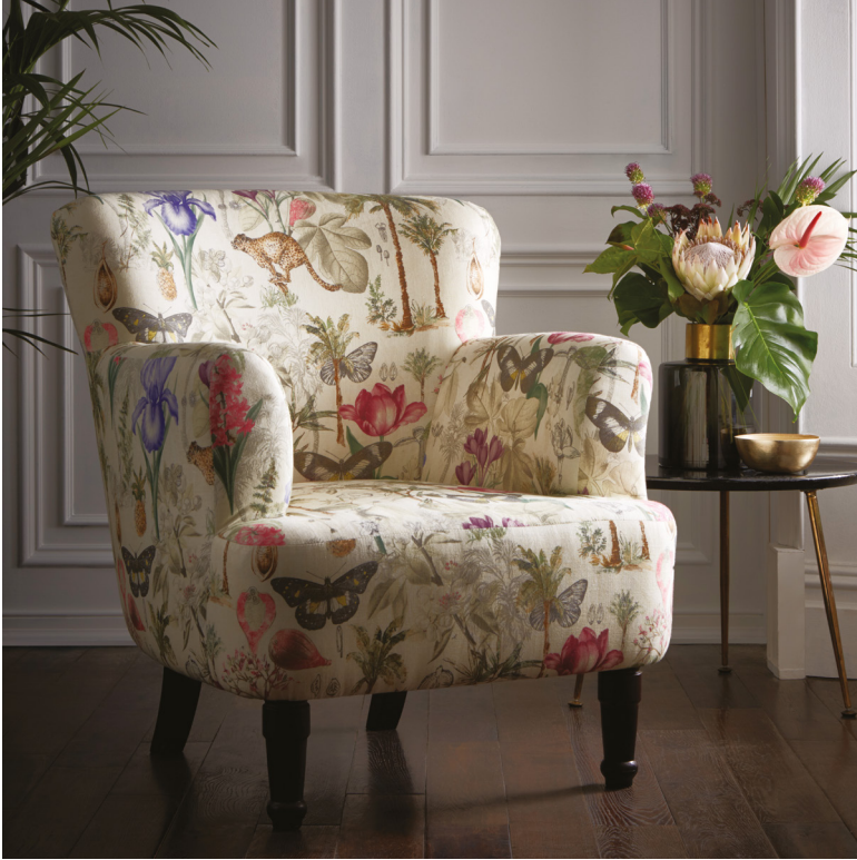
Top to bottom: Botany cushion, Botany bedlinen set tropical, Dalston chair Botany summer.