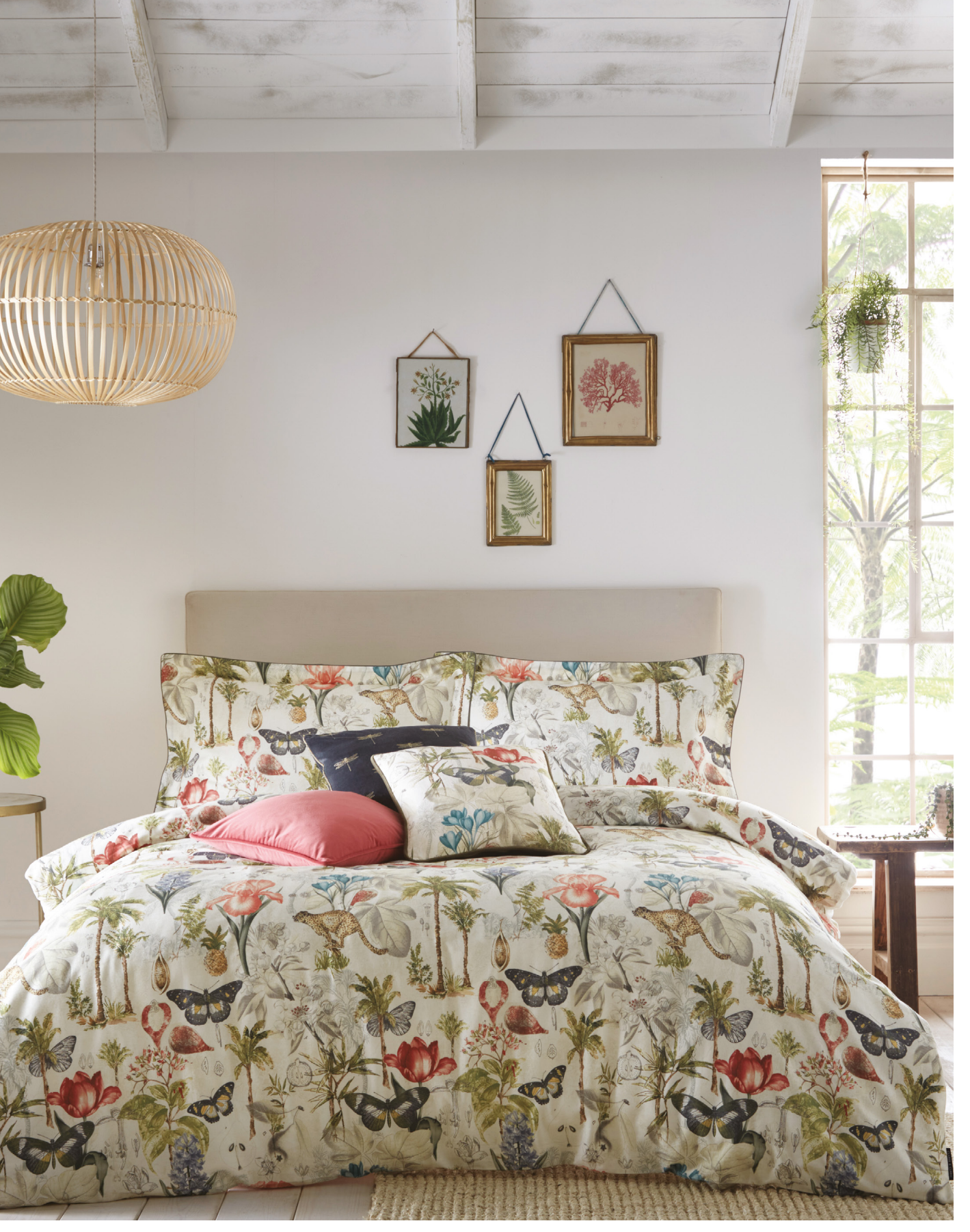
Left to right: Botany bedlinen set tropical, velvet cushion made from Alvar peony, Azure cushion, Botany cushion.