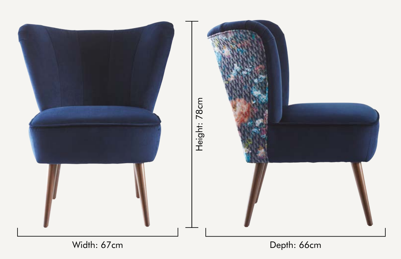
NB: The pattern layout may vary between chairs. Each piece is made in UK.

Seville in Camile Midnight and Alvar Navy is a two-tone inky-coloured dream. Depicting distorted florals, the beauty of Camile on the back draws the eye