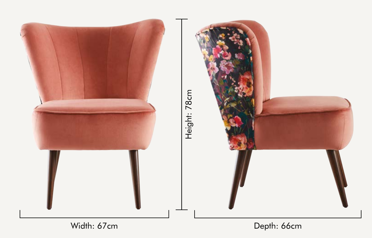
NB: The pattern layout may vary between chairs. Each piece is made in UK.

Pairing beautifully with Alvar rose velvet, Wild Meadow adorns the back of this delightful chair, featuring wild peonies, poppies, daisies, and chrysanthemums in a dramatic noir colourway.