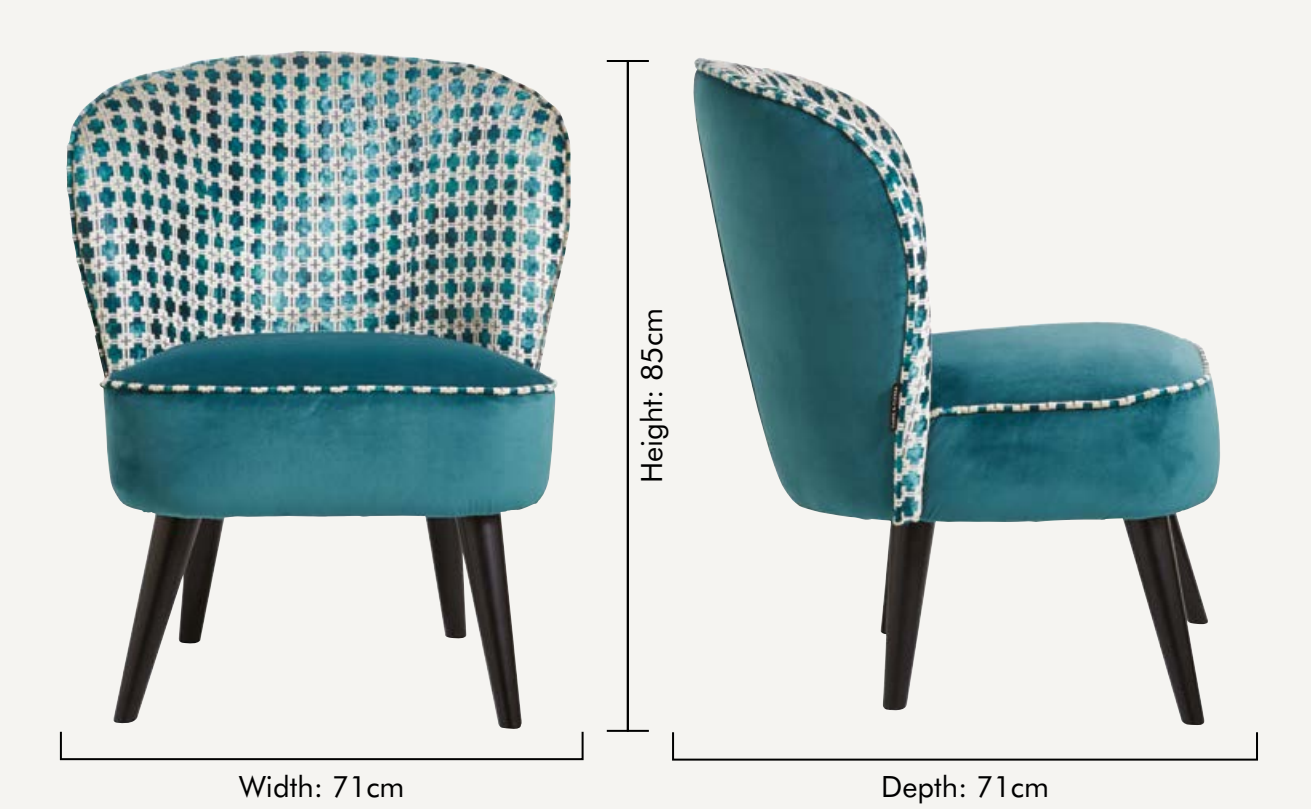
NB: The pattern layout may vary between chairs. Each piece is made in UK.

The contemporary Ascot chair upholstered in plush Maui and teal velvet adds an oppulent addition to your interior.