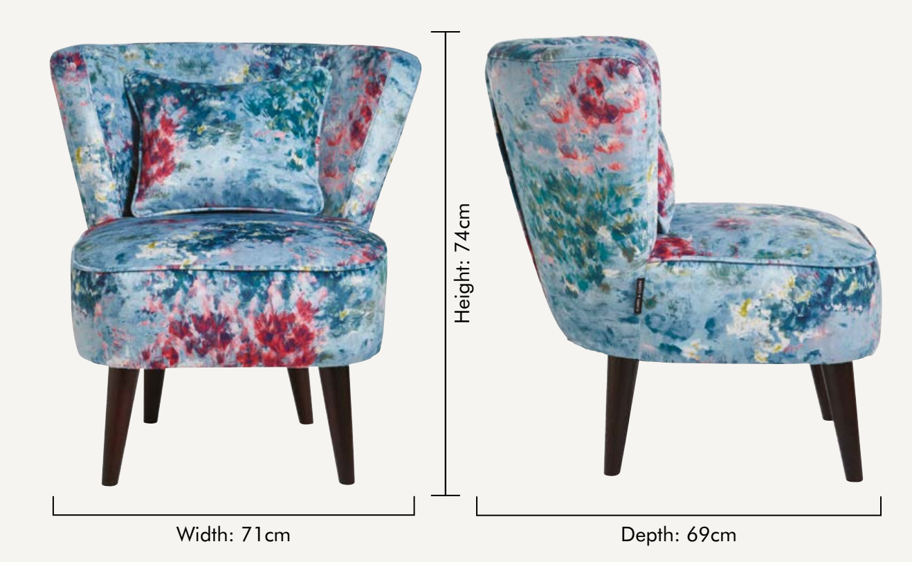
NB: The pattern layout may vary between chairs. Each piece is made in UK.

The beautiful impressionist florals of Fiore featured on an elegant curved shape, adds both comfort and style.