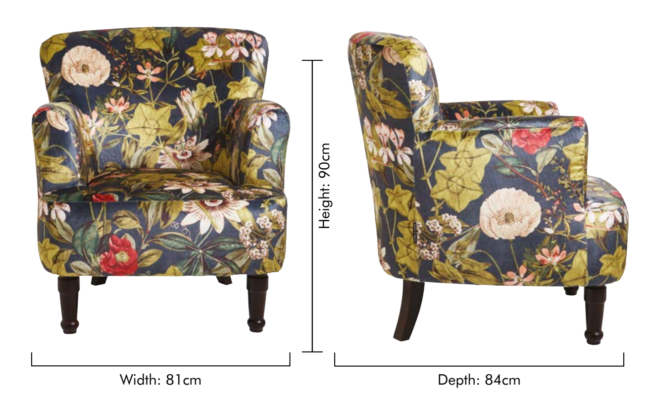
NB: The pattern layout may vary between chairs. Each piece is made in UK.

Allow the exotic vines of Passiflora encase you as you relax, the perfect addition to your home and hint to a tropical island life.