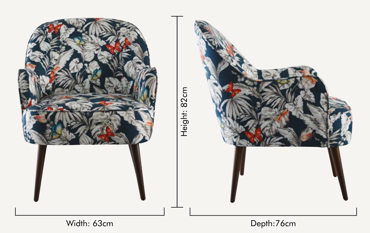
NB: The pattern layout may vary between chairs. Each piece is made in UK.

The Elda Chair has found its match in a midnight garden of Acadia. In Midnight, the palms and leaves reflect a negative reflection of the print, flecked with deep orange and softer green butterflies, giving a botanical feel to this elegantly formed chair.