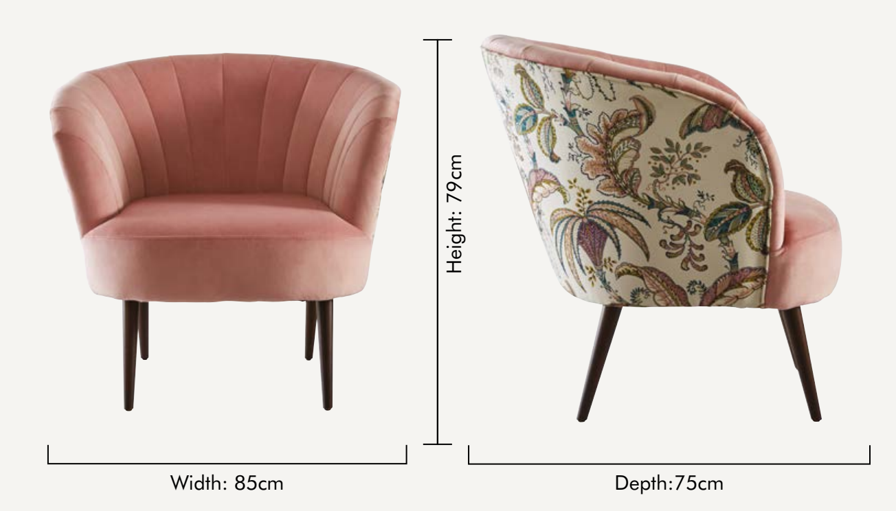
NB: The pattern layout may vary between chairs. Each piece is made in UK.

With a sculpted seashell quality in the back, Prague in Ophelia and Alvar Quartz sits pretty. The sumptuous Jacobean trail design features luxurious hand-drawn vegetation and bejewelled detailing.