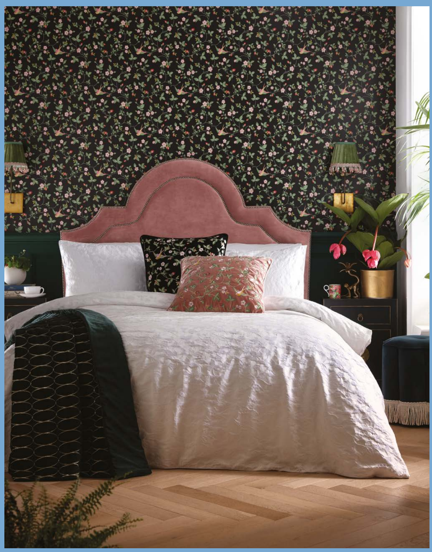
Wallcovering: Wild Strawberry Noir Cushions front to back: Wild Strawberry Blush, Noir Bedlinen: Wild Strawberry White Throw: Renaissance Emerald Ceramics left to right: White Folia Rose Bowl, Wild Strawberry White Teacup & Saucer, Wonderlust Pink Lotus Mug