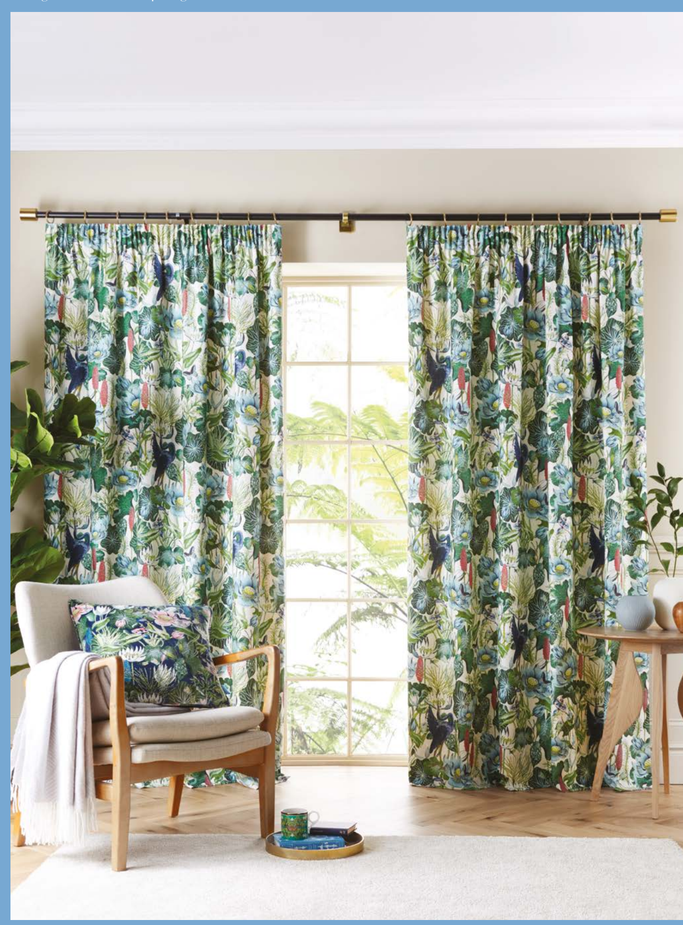
Curtains: Waterlily Natural Cushion: Waterlily Midnight Throw: Folia Smoke Ceramics left to right: Wonderlust Emerald Forest Mug, Jasper Folia Warm White Rose Bowl, White Folia Large Lithophane

The Waterlily Natural curtains have a lovely dry handle, cream polycotton lining and pencil pleat header. Packaged in a fabric envelope bag.