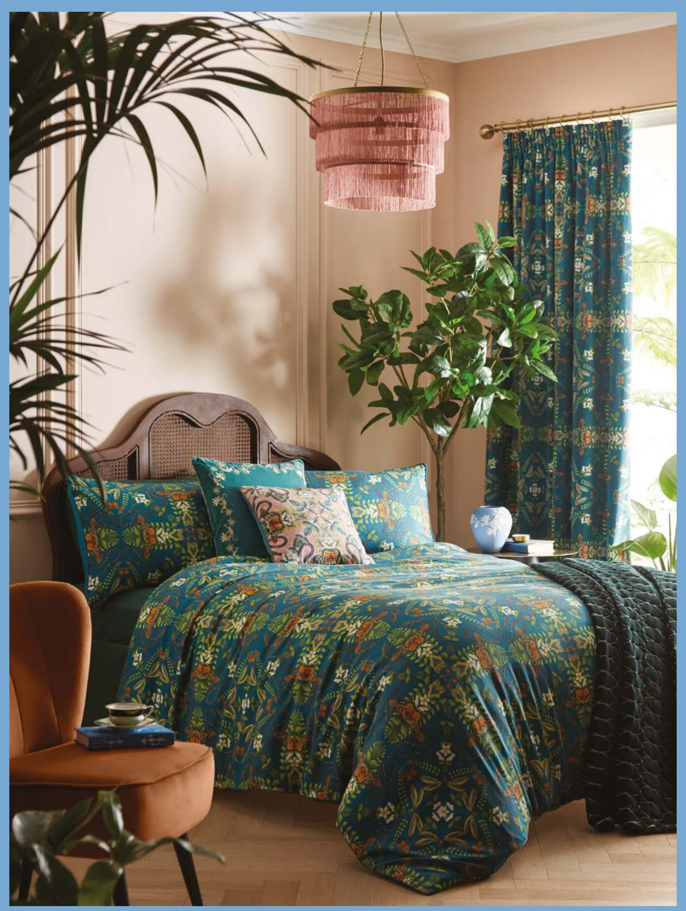
Bedlinen: Emerald Forest Teal Cushions front to back: Emerald Forest Blush, Sapphire Garden Seagrass Drape: Emerald Forest Teal Throw: Renaissance Emerald Ceramics left to right: Wonderlust Emerald Forest Teacup & Saucer, Magnolia Blossom Large Jasper Vase