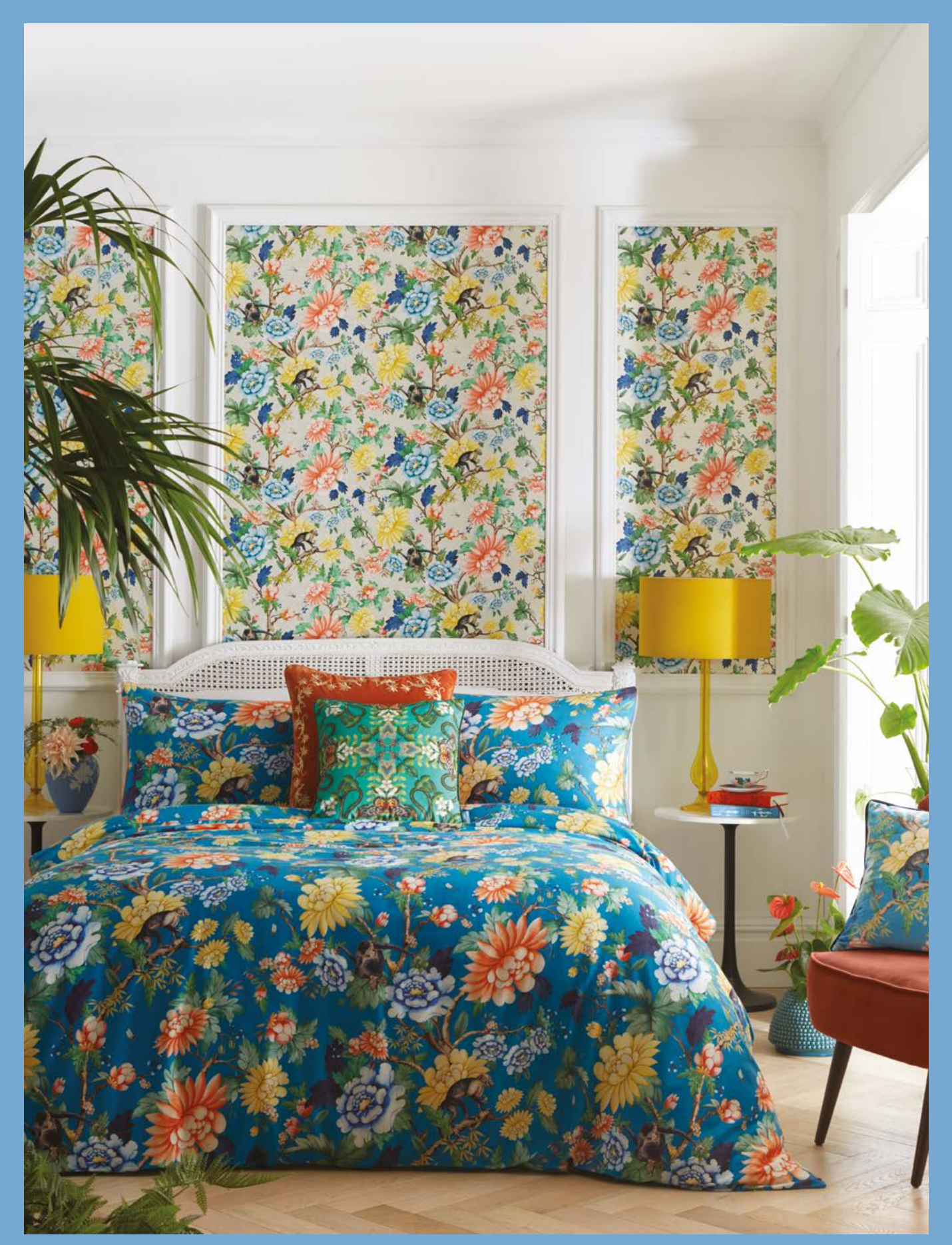
Bedlinen: Sapphire Garden Sapphire Cushions front to back: Sapphire Garden Sapphire, Emerald Forest Emerald, Sapphire Garden Spice Ceramics left to right: Magnolia Blossom Large Jasper Vase, Wonderlust Golden Parrot Teacup & Saucer Wallcovering: Sapphire Garden Ivory