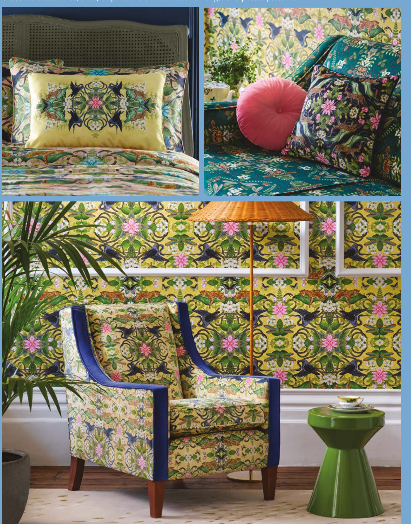
(Top left) Bedlinen: Wonderlust Tea Story Blush Cushion: Wonderlust Tea Story Citron (Top right) Sofa: Emerald Forest Teal Velvet Fabric Cushions: Alvar Candy Fabric, Menagerie Midnight (Bottom) Armchair: Wonderlust Tea Story Citron Velvet Fabric Wallcovering: Wonderlust Tea Story Citron Ceramics: Wonderlust Waterlily Teacup & Saucer, Waterlily Side Plate

From the Amazon basin's tropical heat to the humid jungles of Vietnam, harness the spirit of wanderlust and discover exotic, uncharted territories. Celebrating the world's most unusual flora and fauna, this bold, kaleidoscopic pattern encounters butterflies, birds, leopards and snakes hidden amongst unexpected patterns.