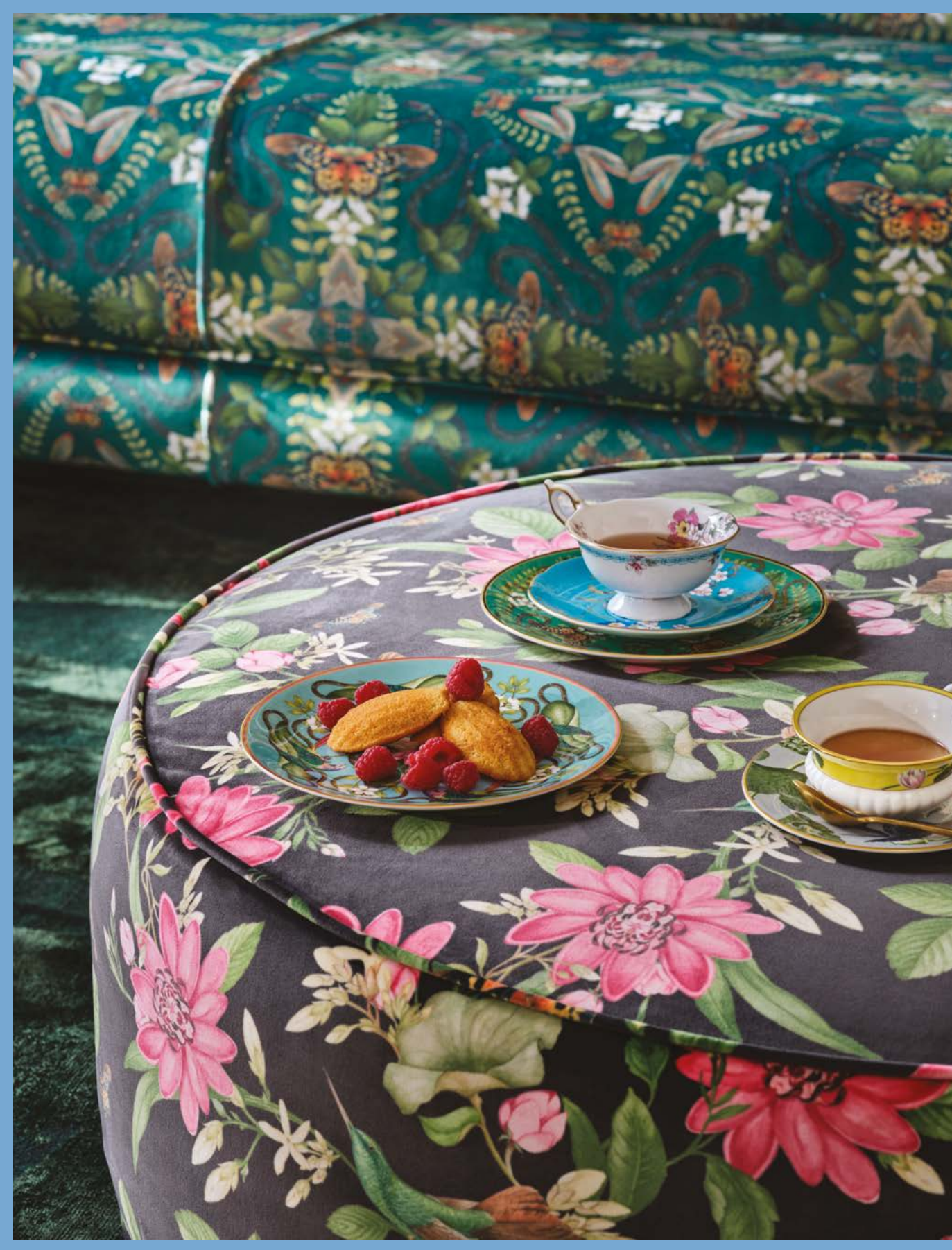
Sofa: Emerald Forest Teal Velvet Fabric Drum: Pink Lotus Noir Velvet Fabric Ceramics left to right: Wonderlust Menagerie Plate, Wonderlust Emerald Forest Plate, Wonderlust Apple Blossom Teacup & Saucer, Wonderlust Waterlily Teacup & Saucer

A symbol of inner wisdom and the sanctity of daily life, the Pink Lotus is considered a sacred flower in the tropics of Asia. Typically found in marshy swamps, it produces gigantic fragrant blossoms and leaves, a haven for flying insects such as bejewelled dragonflies. The delicate balance of daily life is celebrated in this bold and beautiful pattern.