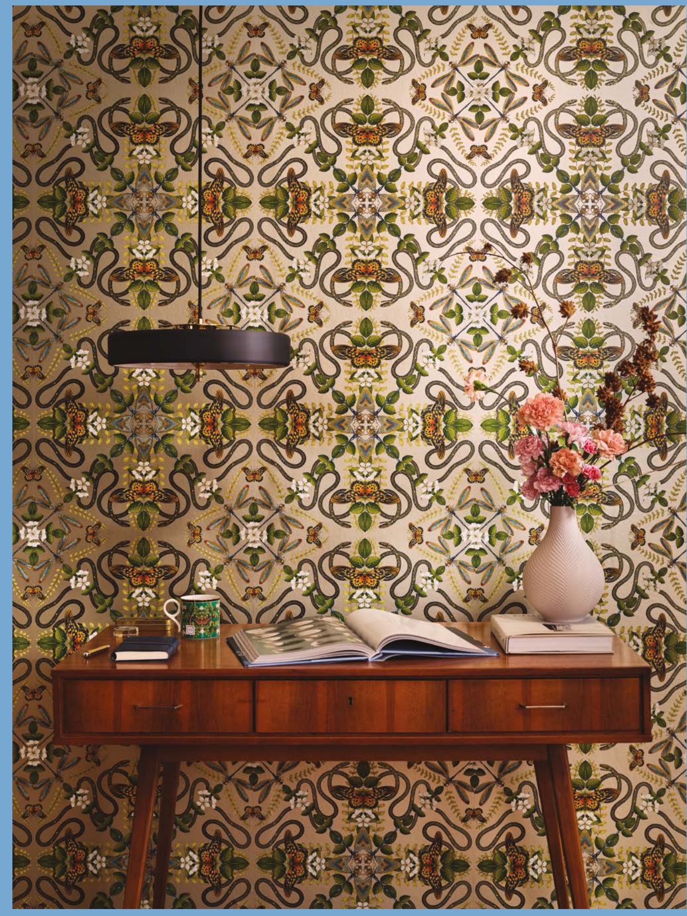
Wallcovering: Emerald Forest Gilver Ceramics: Wonderlust Emerald Forest Mug, Jasper Folia Powder Pink Bulb Vase

Step into Emerald Forest's fantastical wonderland and lose yourself amongst lush, abundant foliage. Packed full of flora and fauna, this verdant pattern is reminiscent of a whimsical walk amongst ancient English woodland.