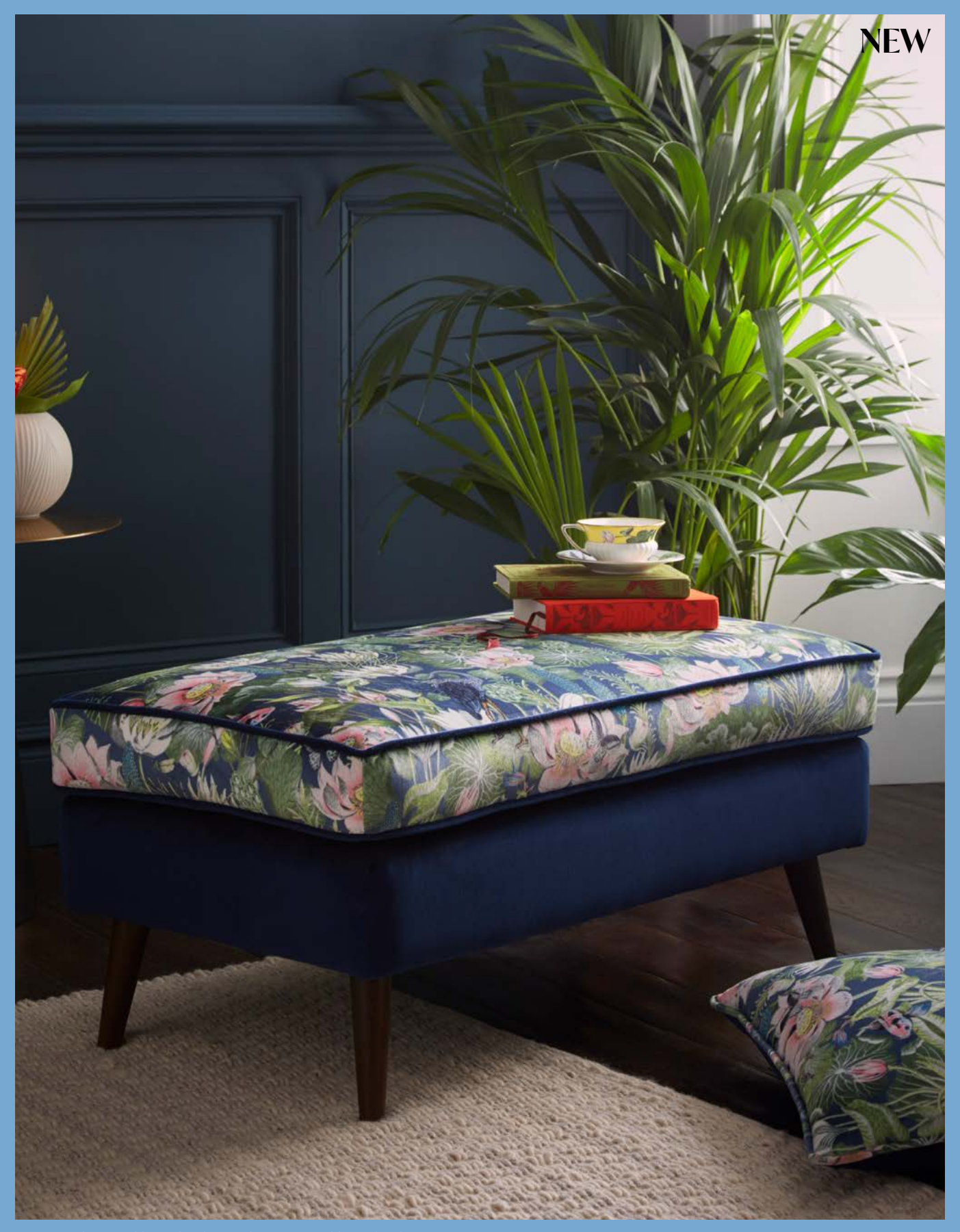
Footstool: Waterlily Midnight Cushion: Waterlily Midnigh

The Wedgwood Waterlily footstool is the perfect place to rest your feet or set a tray of drinks. Upholstered in luxurious, soft velvet and finished with contrasting dark blue piping, its royal blue base highlights the blush tones of the pattern's hand painted waterlilies. Dark wooden legs add a contemporary feel to the piece, which is made in England and designed to suit any interior scheme. Pair with the Waterlily armchair and matching velvet cushion.