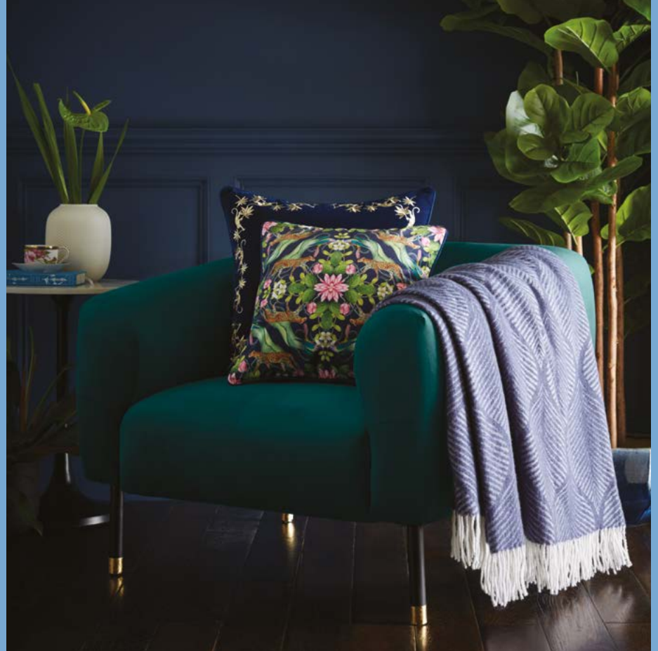
(Above) Top to bottom Bedlinen : Folia Smoke Cushions : Sapphire Garden Midnight, Menagerie Midnight Throw : Folia Midnight