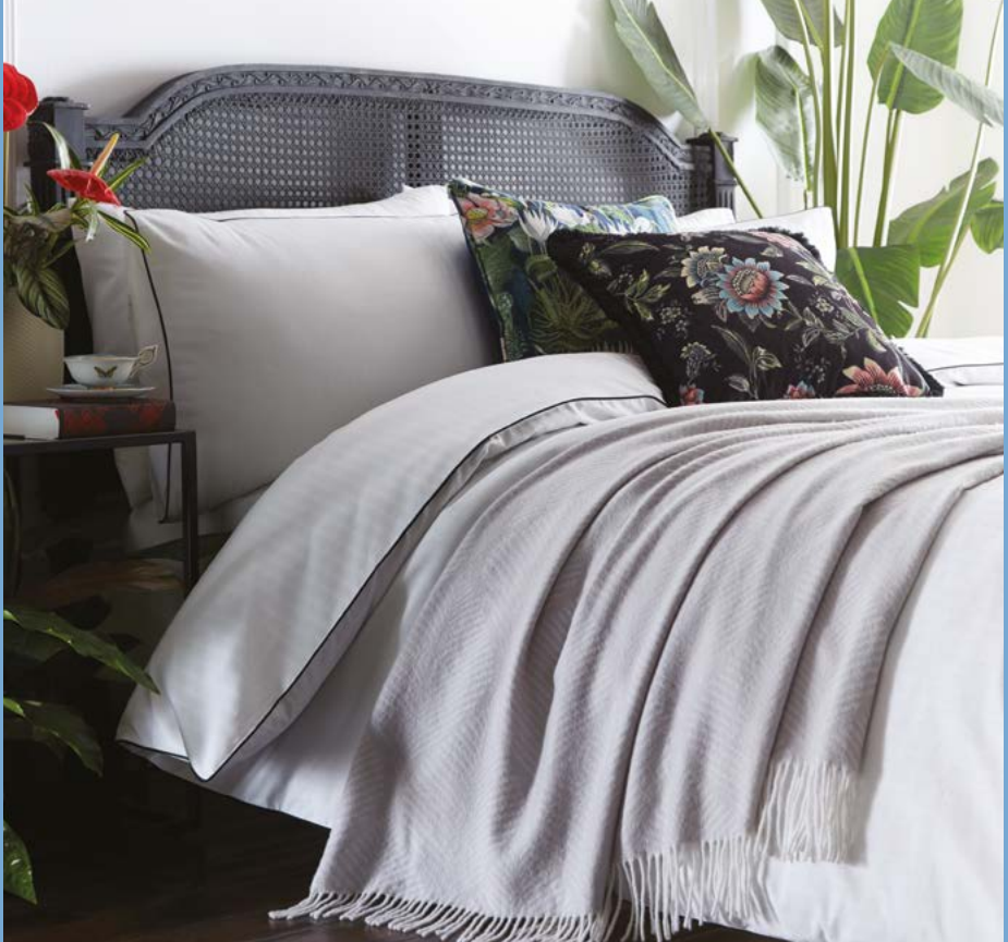
(Above) Top to bottom Cushions: Waterlily Midnight, Tonquin Noir Throw: Folia Smoke Bedlinen: Folia White