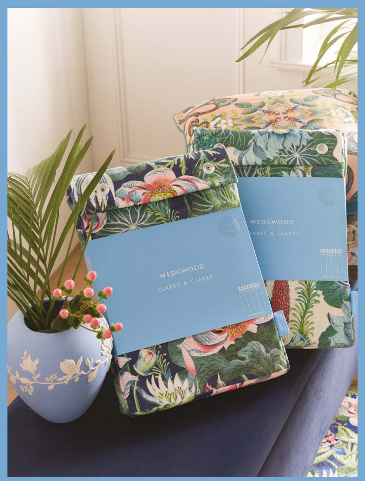
Ceramics: Magnolia Blossom Large Jasper Vase Curtains left to right: Waterlily Midnight, Waterlily Natural Cushion: Emerald Forest Blush