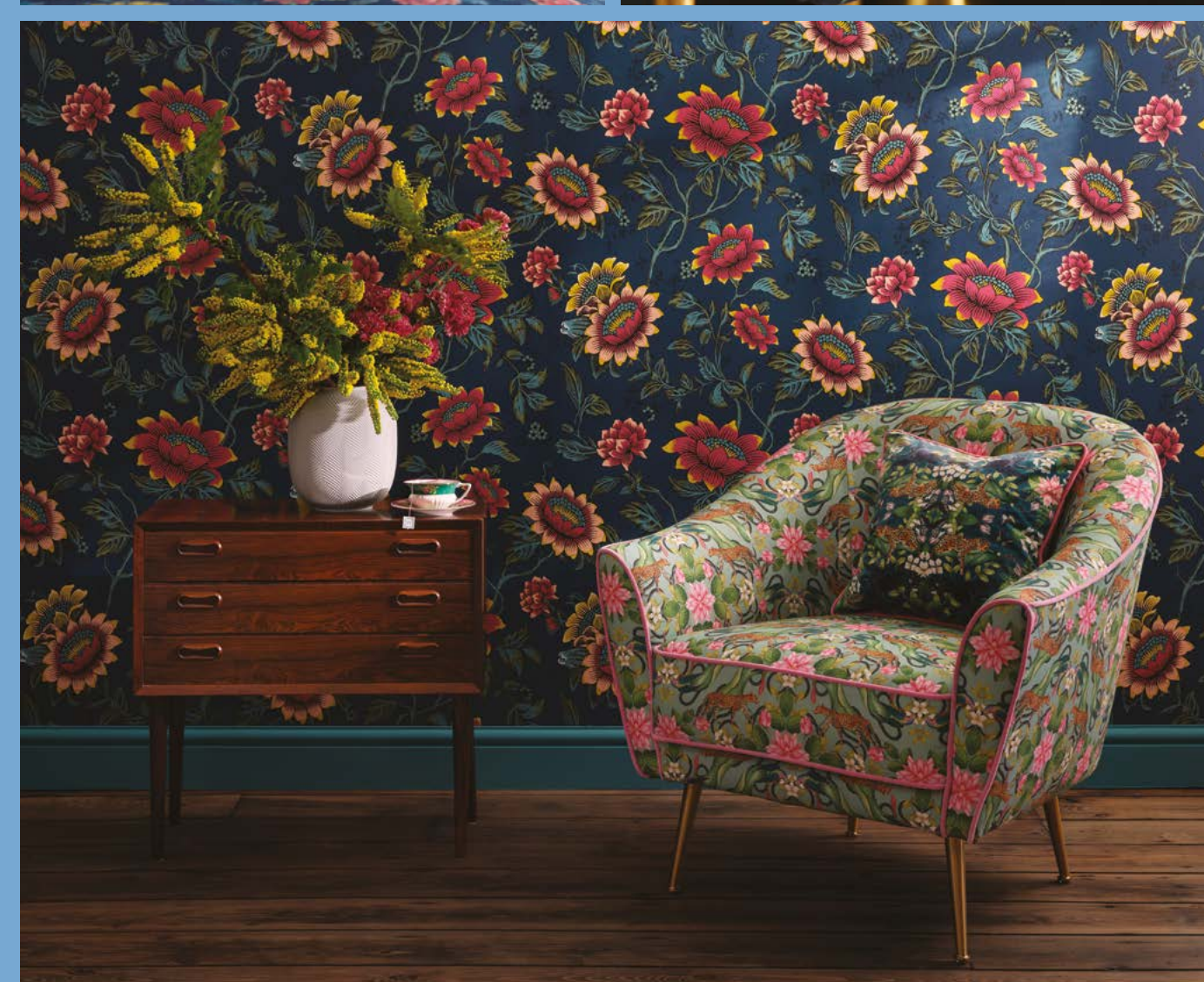
(Top left) Cushion: Firefly Emerald Bedlinen: Tonquin Midnight (Top right) Ceramics: Paeonia Blush Tea for one Bedlinen: Tonquin Midnight (Bottom) Ceramics: Jasper Folia Dove Grey Rounded Vase, Wonderlust Pink Lotus Teacup & Saucer Wallcovering: Tonquin Midnight Armchair: Menagerie Aqua Fabric Cushion: Wonderlust Tea Story Teal Velvet Fabric