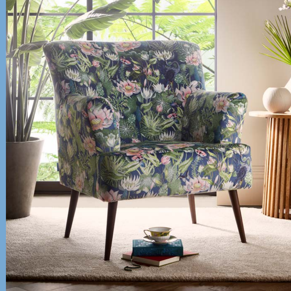
(Above) Top to bottom Armchairs: Waterlily Blush, Waterlily Midnigh

The Wedgwood Waterlily footstool is the perfect place to rest your feet or set a tray of drinks. Upholstered in luxurious, soft velvet and finished with contrasting dark blue piping, its royal blue base highlights the blush tones of the pattern's hand painted waterlilies. Dark wooden legs add a contemporary feel to the piece, which is made in England and designed to suit any interior scheme. Pair with the Waterlily armchair and matching velvet cushion.