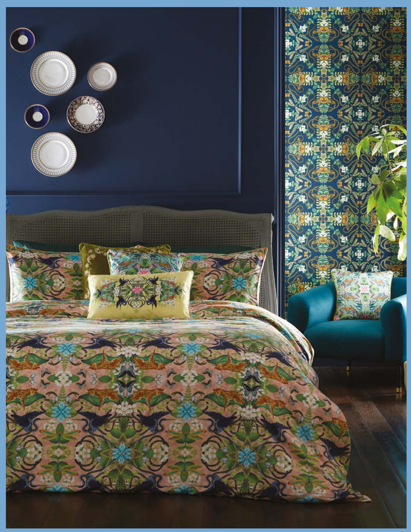
Bedlinen: Wonderlust Tea Story Blush Cushions front to back : Wonderlust Tea Story Citron, Menagerie Aqua, Sapphire Garden Olive Ceramics left to right: Wonderlust Sapphire Garden Mug, Renaissance Gold Saucer, Renaissance Gold Dinner Plate, Renaissance Gold Side Plate, Florentine Accent Wallcovering: Wonderlust Tea Story Teal