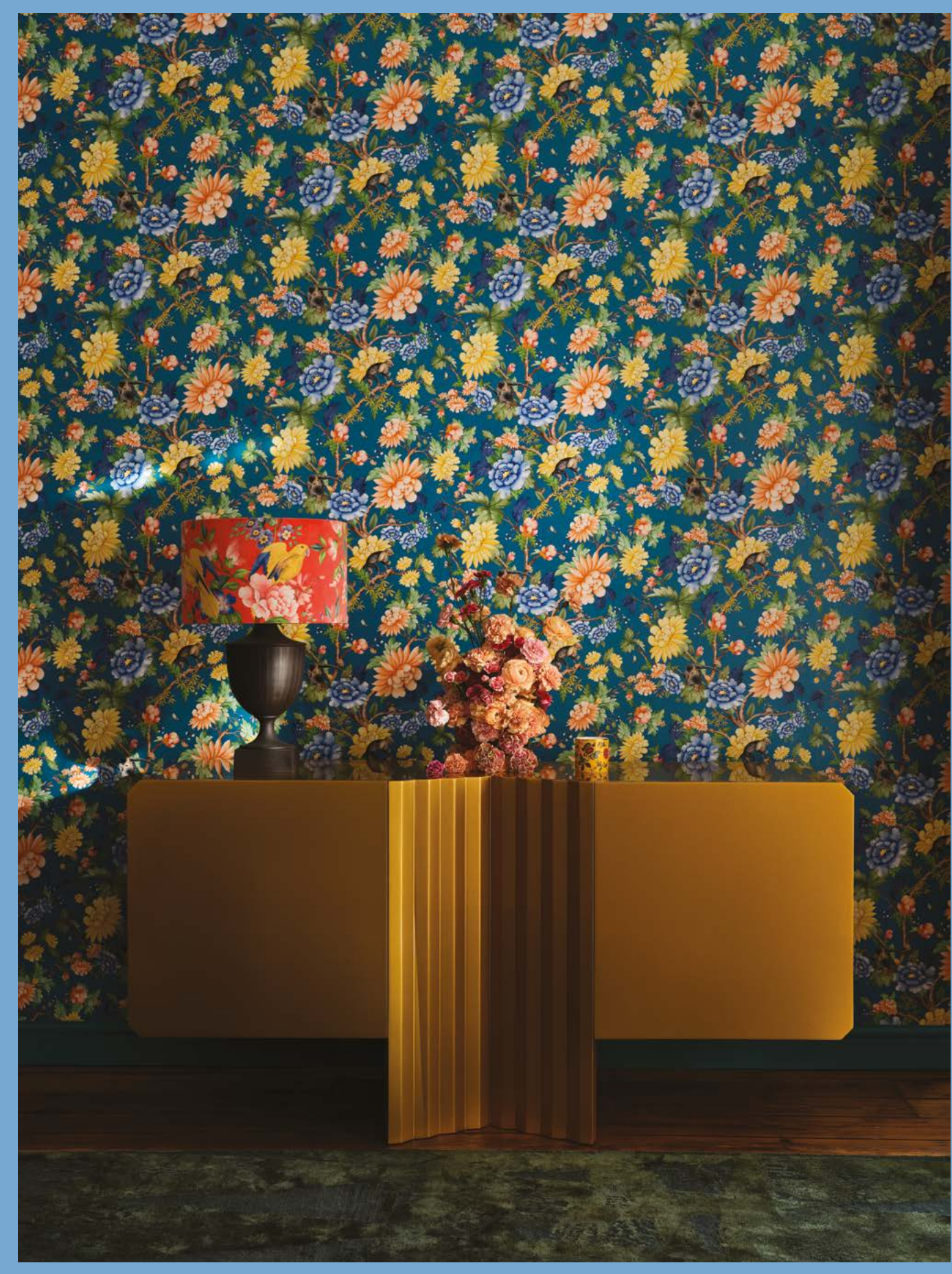
Wallcovering: Sapphire Garden Sapphire Lampshade: Golden Parrot Coral Velvet Fabric Ceramics: Wonderlust Yellow Tonquin Candle

Take a voyage of discovery through our Sapphire Garden and make friends with native Rhesus Macaques. Inspired by the Grand Tour from Europe through Asia, this fabric is heavily influenced by Wedgwood's archival patterns. Featuring temple-dwelling monkeys, Indian decorative designs and exotic colours, it will take your interior on a grand tour of its own.