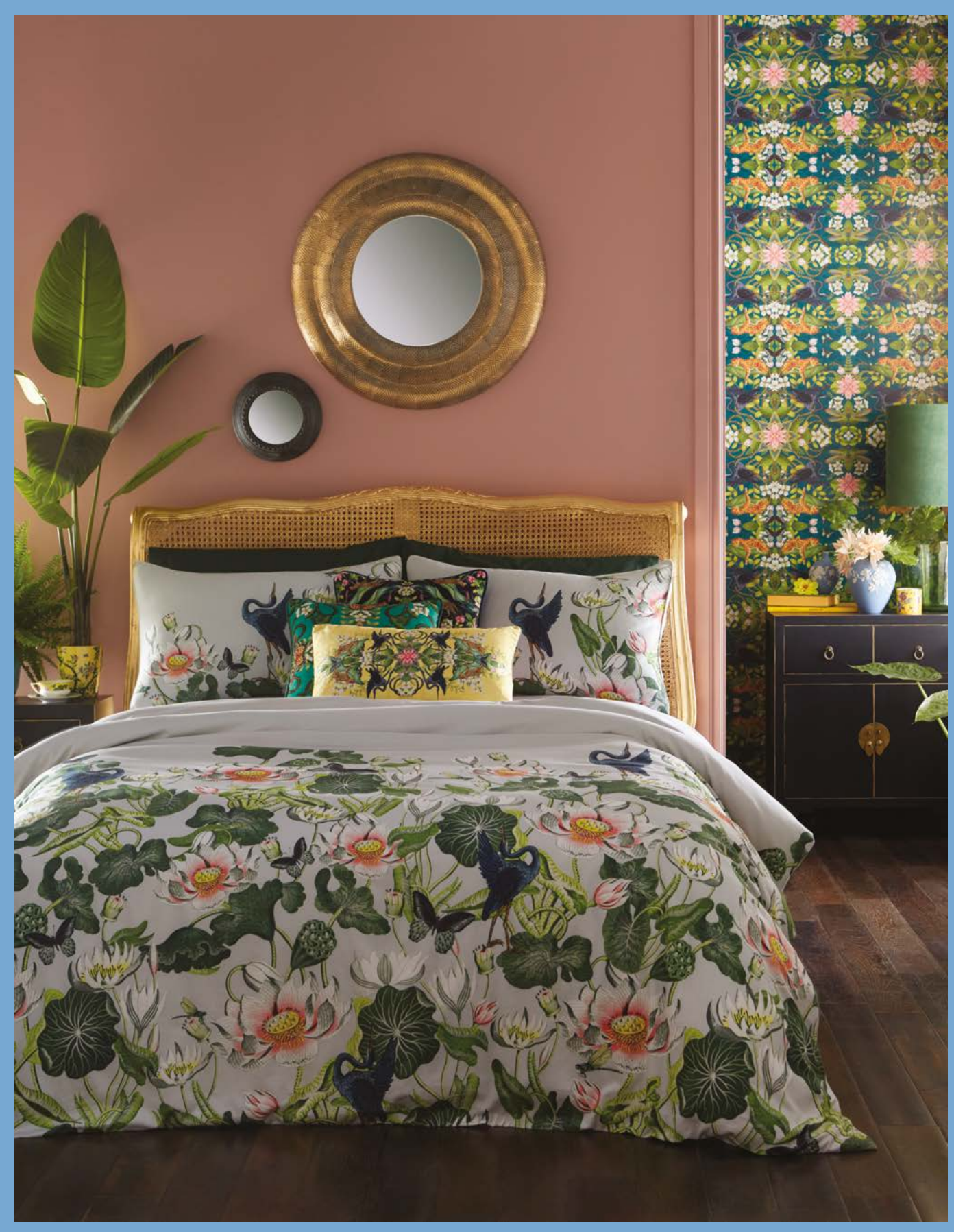
Bedlinen: Waterlily Dove Cushions front to back: Wonderlust Tea Story, Emerald Forest Emerald, Menagerie Midnight Ceramics left to right: Wonderlust Waterlily Teacup & Saucer, Magnolia Blossom Jasper Bud Vase, Magnolia Blossom Large Jasper Vase, Wonderlust Yellow Tonquin Candle Wallcovering: Wonderlust Tea Story Teal

The original Waterlily pattern today has been developed in colour as part of Wedgwood's new Wonderlust collection - a wonderful nod to the past, with a modern, creative and eclectic Wedgwood twist. Waterlily Dove is printed onto luxurious 200 thread count cotton sateen.