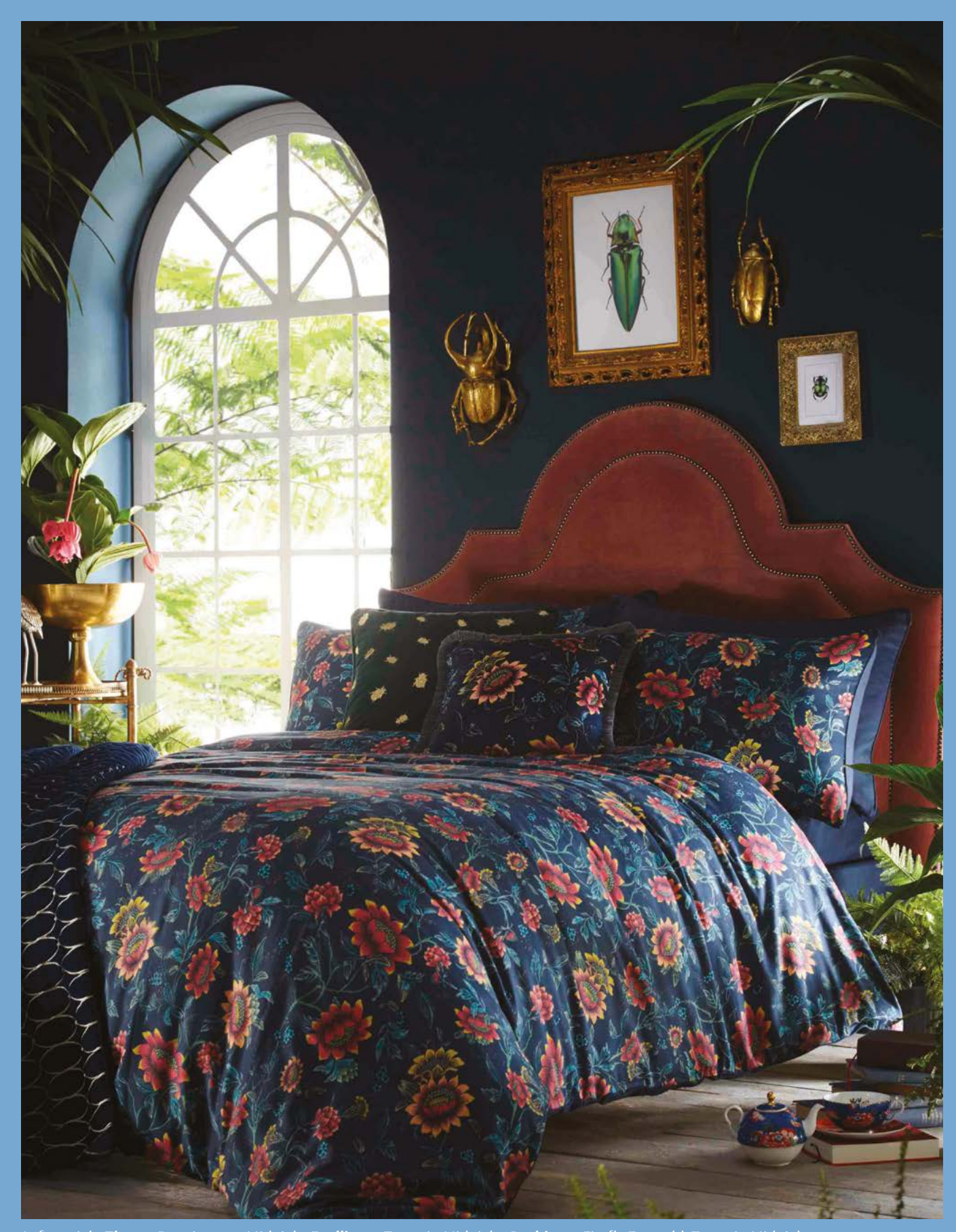
Left to right Throw : Renaissance Midnight Bedlinen : Tonquin Midnight Cushions : Firefly Emerald, Tonquin Midnight Ceramics : Paeonia Blush Tea for one