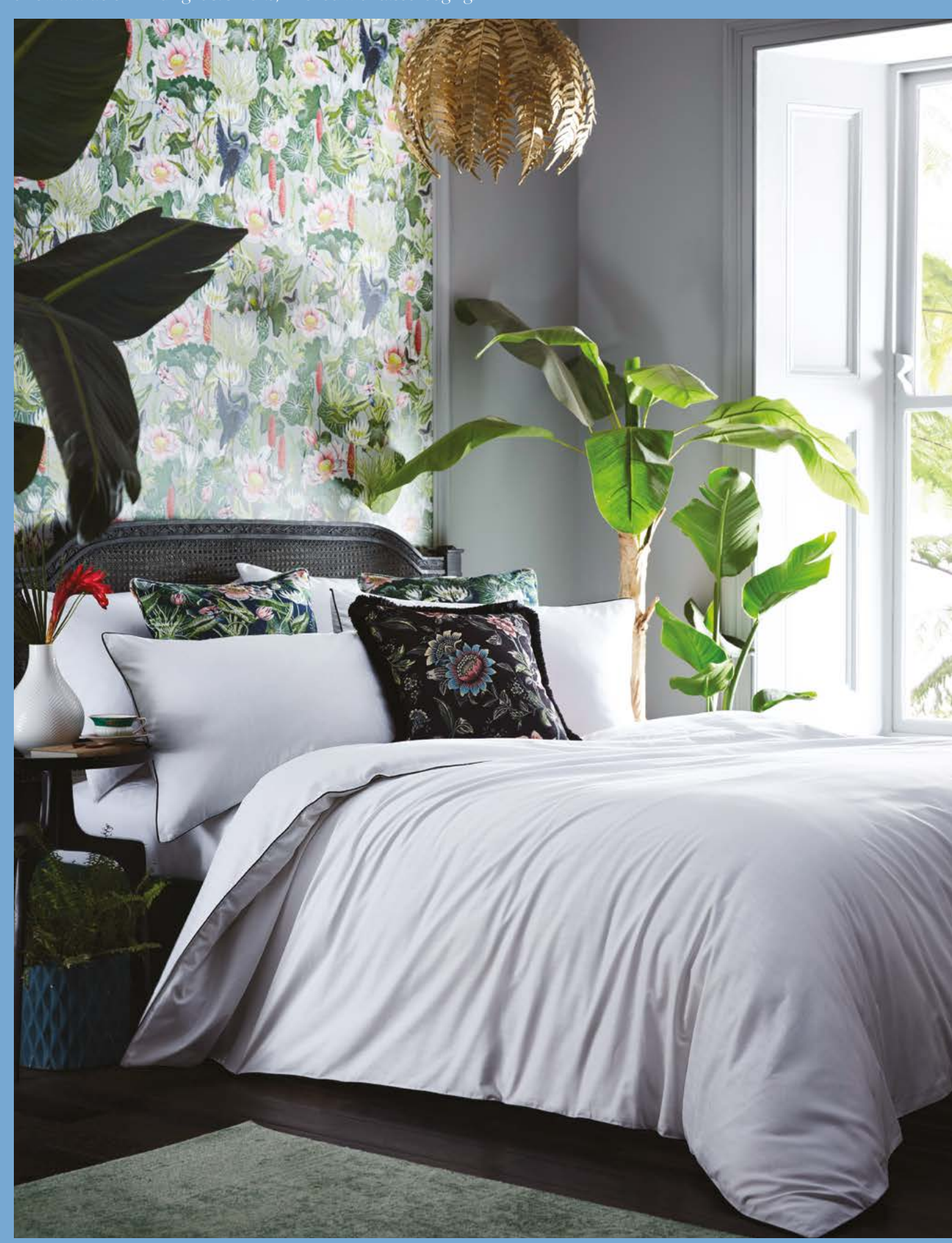
Wallcovering: Waterlily Dove Bedlinen: Folia White Cushions front to back: Tonquin Noir, Waterlily Midnight Ceramics left to right: White Folia Bulb Vase, Wonderlust Pink Lotus Teacup & Saucer

Nature can be good for the soul and for a restful night's sleep. Fresh air and lush foliage are the inspiration for this calming bedlinen set, that's woven from 100% cotton. Available in a choice of two colourways and both framed by contrasting piping, the natural design of blooming flowers and verdant leaves create a relaxing simplicity. Add an extra layer of warmth with our beech leaf inspired throw available in Midnight & Smoke, finished with tassel edging.