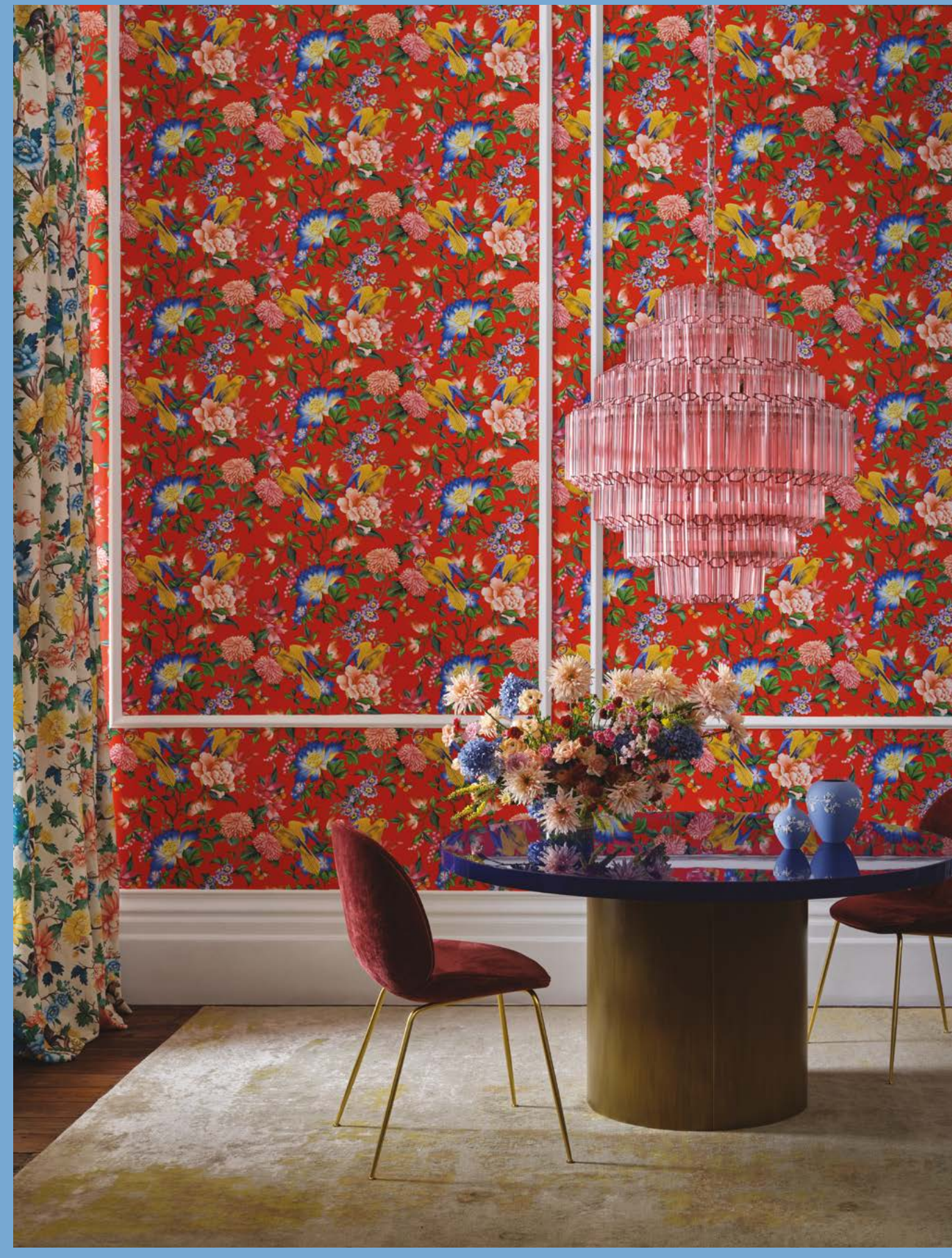
Drape: Sapphire Garden Ivory Fabric Wallcovering: Golden Parrot Coral Ceramics: Magnolia Blossom Large Jasper Vase, Magnolia Blossom Jasper Bud Vase

A Brazilian native, the Golden Parrot can only be found in a small area south of the Amazon River. Despite its striking yellow colour, this beautiful bird is difficult to spot in the wild. Set against a background of bright foliage, the Golden Parrot sits proudly amongst this striking pattern.