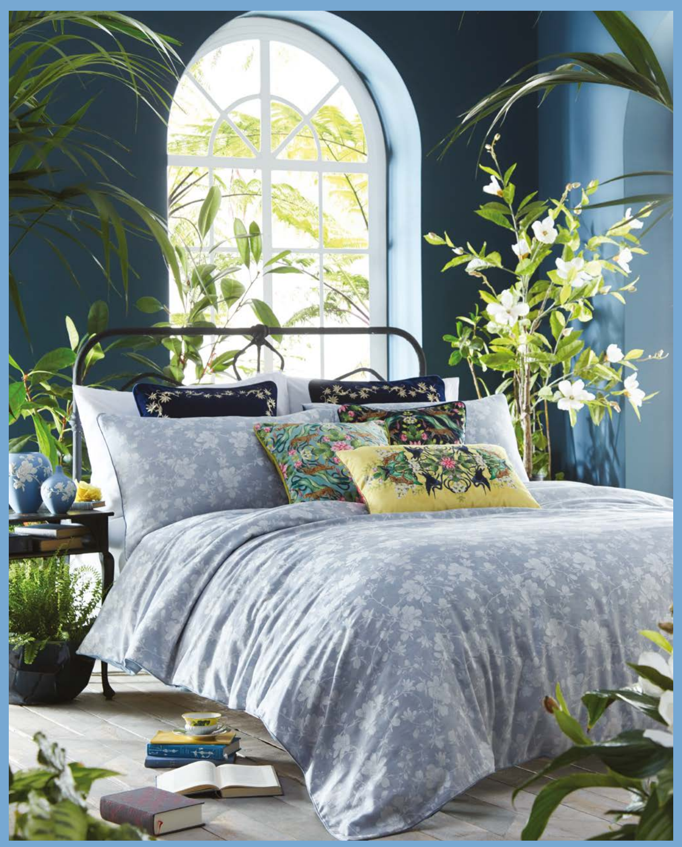
Ceramics top to bottom: Magnolia Blossom Large Jasper Vase, Magnolia Blossom Jasper Bud Vase, Wonderlust Waterlily Teacup & Saucer Bedlinen: Magnolia Wedgwood Jasper Cushions front to back: Wonderlust Tea Story Citron, Menagerie Aqua, Midnight, Sapphire Garden Midnight

Nothing says Wedgwood like blue and white Jasperware. With its quintessentially English colour palette, this duvet set is woven in 100% cotton and encased by a delicate cord piping. A new take on an iconic design, our interpretation includes two matching pillowcases that showcase the same exquisitely sculpted magnolia tree petals as the duvet cover. Available in double, king and super king sizes.