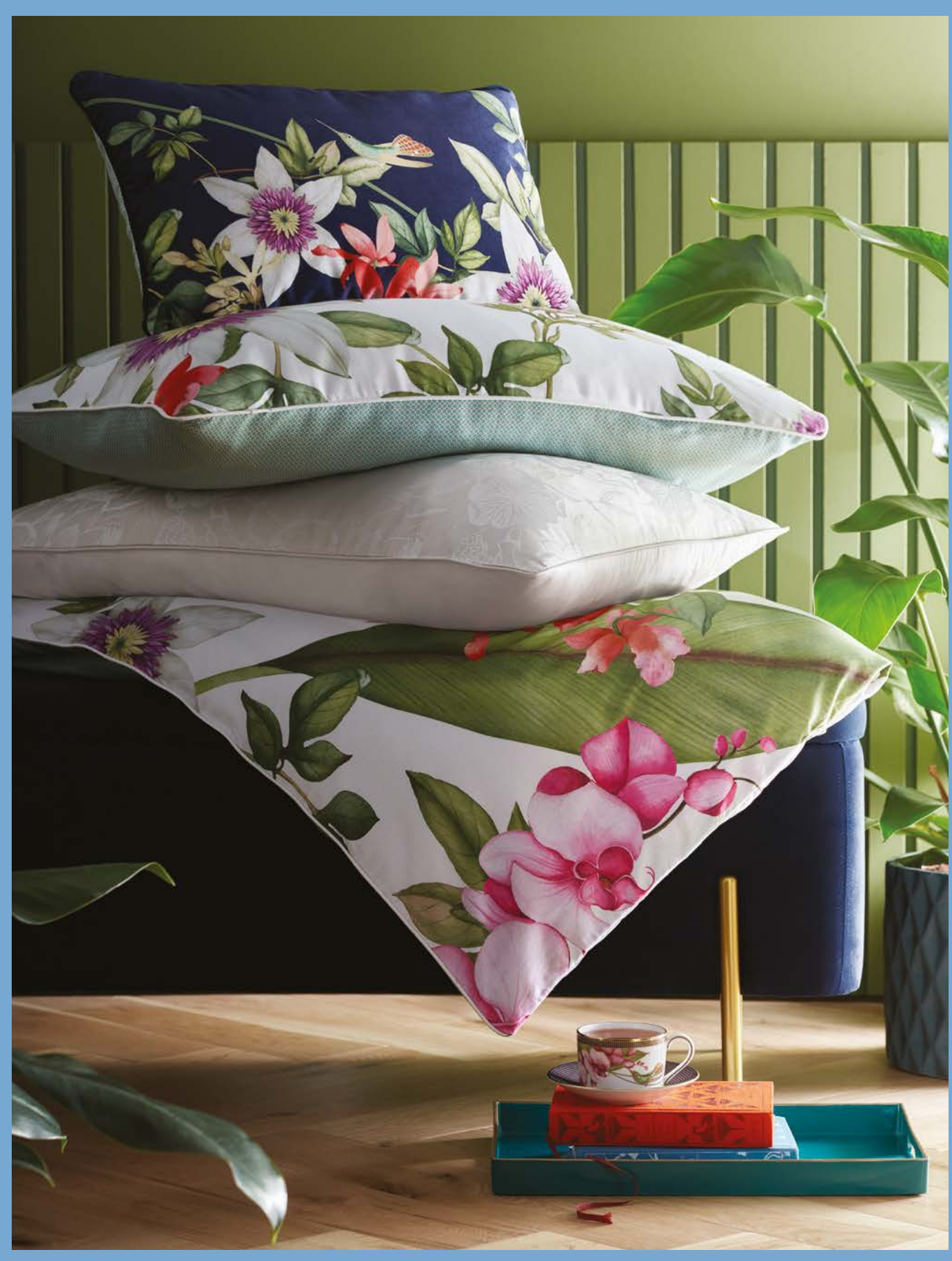
Cushion: Hummingbird Midnight Bedlinen: Hummingbird White, Waterlily Natural Ceramics: Hummingbird Teacup & Saucer