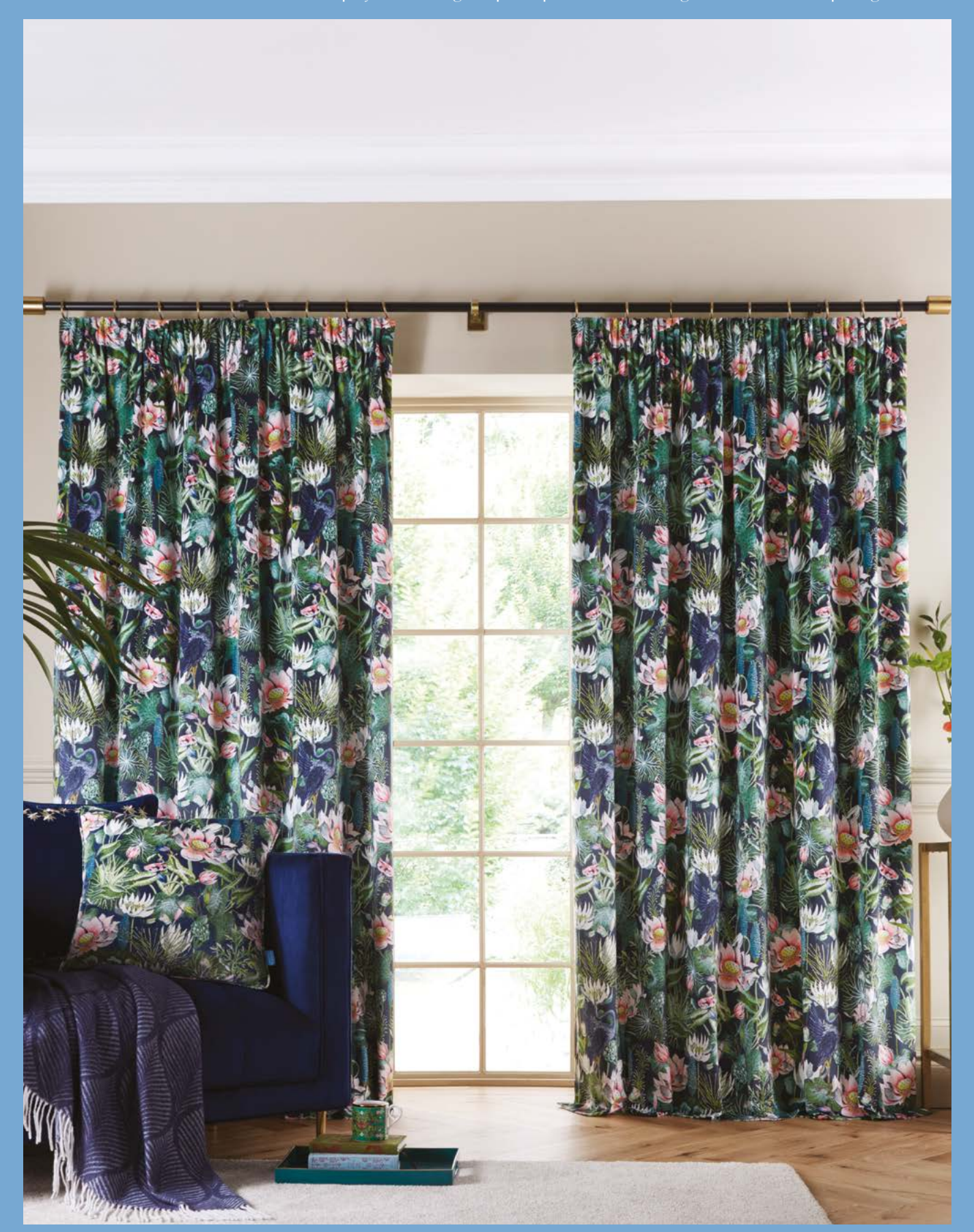
C urtains: Waterlily Midnight Cushions left to right: Sapphire Garden Midnight, Waterlily Midnight Throw: Folia Midnight C eramics: Wonderlust Emerald Forest Mug

These beautiful velvet curtains have a cream polycotton lining and pencil pleat header. Packaged in a fabric envelope bag