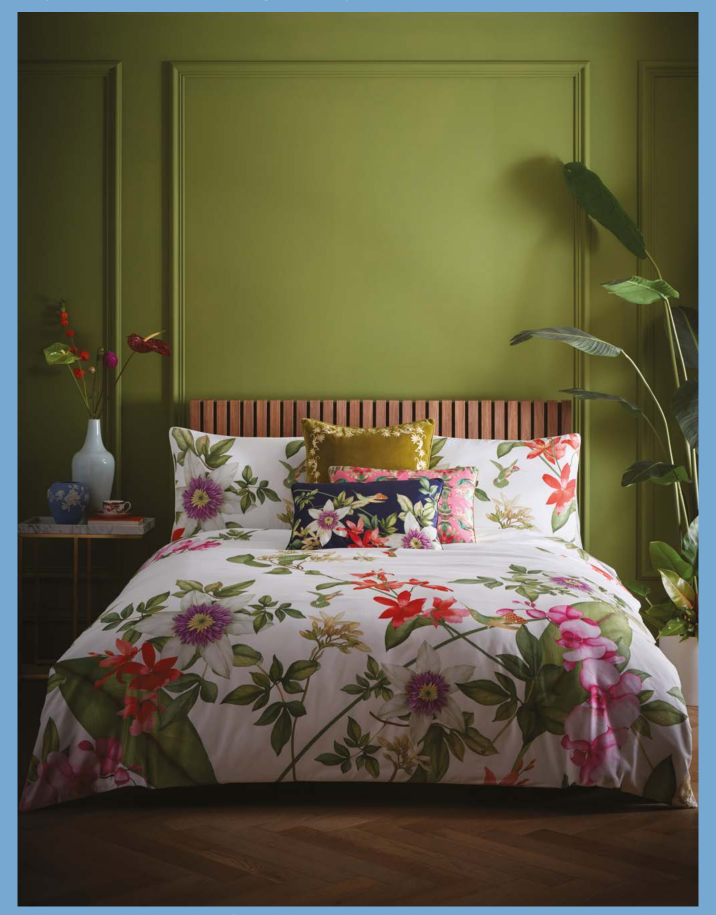
Bedlinen: Hummingbird White Cushions front to back: Hummingbird Midnight, Wonderlust Tea Story Citron, Sapphire Garden Olive Ceramics left to right: Magnolia Blossom Large Jasper Vase, Hummingbird Teacup & Saucer

This warmly coloured scene of delicate hummingbirds and bold tropical flowers is printed on luxurious 275 thread count 100% cotton sateen. Finished with a geometric reverse and ivory piped edging. Two matching pillowcases are included. Complete the look with our velvet Hummingbird accessory cushion.