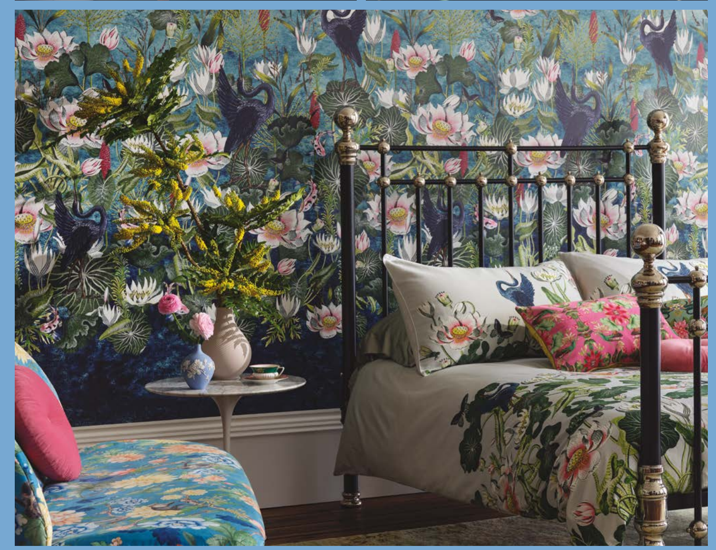
(Top left) Ceramics: Wild Strawberry Teacup & Saucer Peony and White Folia Rose Bowl Wallcovering: Waterlily Dove Sofa: Waterlily Blush Velvet Fabric Cushions left to right: Wild Strawberry Noir, Menagerie Midnight (Top right) Bedlinen: Waterlily Dove Ceramics: Magnolia Blossom Large Jasper Vase (Bottom) Wallcovering: Waterlily Marine Banner Chair: Sapphire Garden Sapphire Velvet Fabric Bedlinen: Waterlily Dove Cushions left to right: Wonderlust Tea Story, Menagerie Aqua Ceramics: Magnolia Blossom Jasper Bud Vase, Jasper Folia Powder Pink Bulb Vase, Wonderlust Pink Lotus Teacup & Saucer

These beautiful velvet curtains have a cream polycotton lining and pencil pleat header. Packaged in a fabric envelope bag