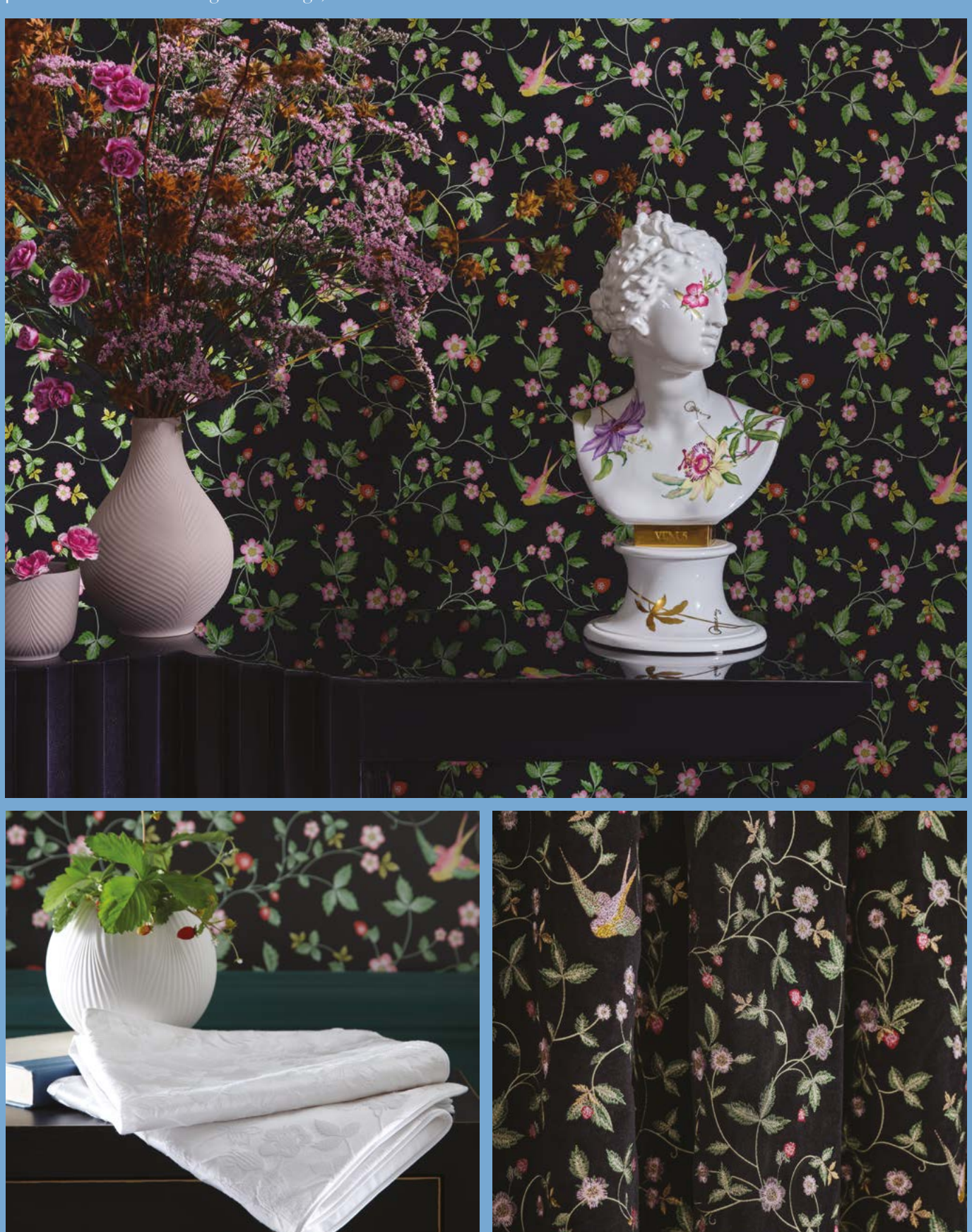
(Top) left to right Ceramics: Jasper Folia Powder Pink Mini Pot, Jasper Folia Powder Pink Bulb Vase, The Floral Eden Venus Bust Wallcovering: Wild Strawberry Noir (Bottom left) Bedlinen: Wild Strawberry White Ceramics: White Folia Rose Bowl (Bottom right) Drape: Wild Strawberry Noir Embroidered Fabric

Feast your eyes on this delicious design from 1964, inspired by fresh, wild strawberries. Recreating the feelings of a lazy English summer, its finely drawn leaves and flowers transport you to a country garden where the smell of cut grass hangs on a gentle breeze. In the distance, a game of cricket can be heard and even if rain does occasionally stop play, it'll never put a halt to that most English of things, afternoon tea.