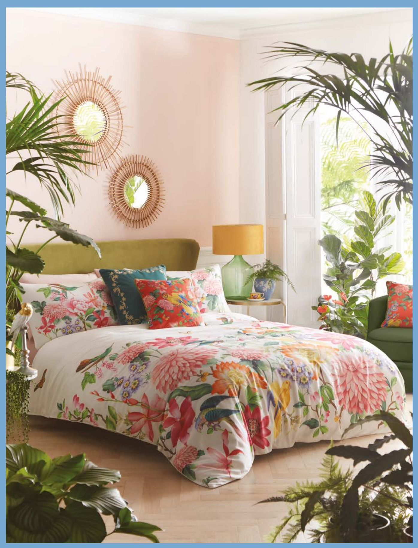
Bedlinen: Golden Parrot Ivory Cushions front to back: Golden Parrot Coral, Sapphire Garden Seagrass Ceramics left to right: Wonderlust Yellow Tonquin Teacup & Saucer, Magnolia Blossom Large Jasper Vase