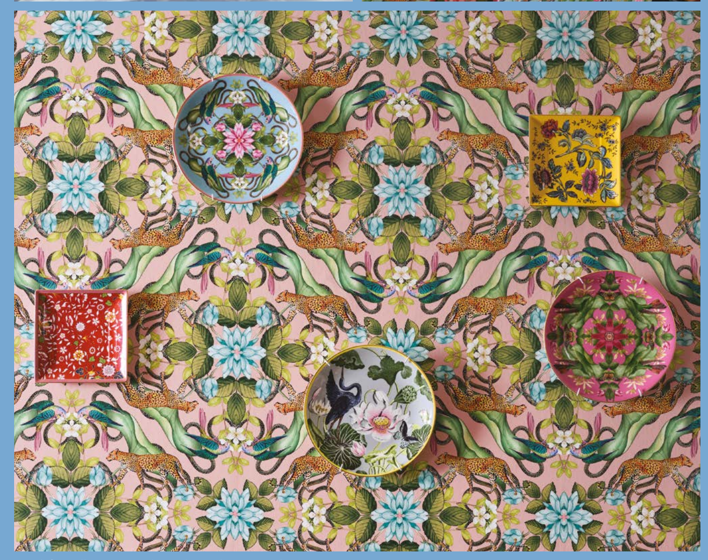
( Top left ) Bedlinen : Magnolia Wedgwood Jasper Cushion : Menagerie Aqua ( Top right ) Wallcovering : Tonquin Midnight Armchair : Menagerie Aqua Fabric Cushion : Wonderlust Tea Story Teal Velvet Fabric ( Bottom ) Wallcovering : Menagarie Blush Ceramics left to right : Wonderlust Crimson Jewel Tray, Wonderlust Menagerie Plate, Wonderlust Waterlily Plate, Wonderlust Yellow Tonquin Tray, Wonderlust Pink Lotus Plate