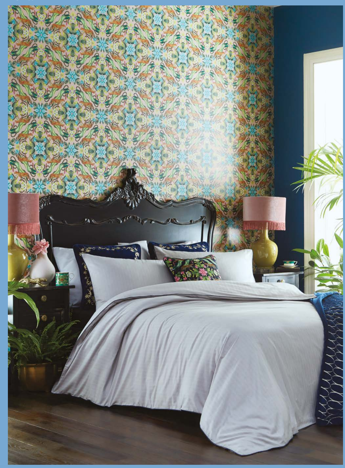
Wallcovering: Menagerie Blush Ceramics left to right : Jasper Folia Powder Pink Bulb Vase, Wonderlust Emerald Forest Mug, Wonderlust Pink Lotus Teacup & Saucer Bedlinen : Folia Smoke Cushions front to back : Menagerie Midnight, Sapphire Garden Midnight Throw : Renaissance Midnight