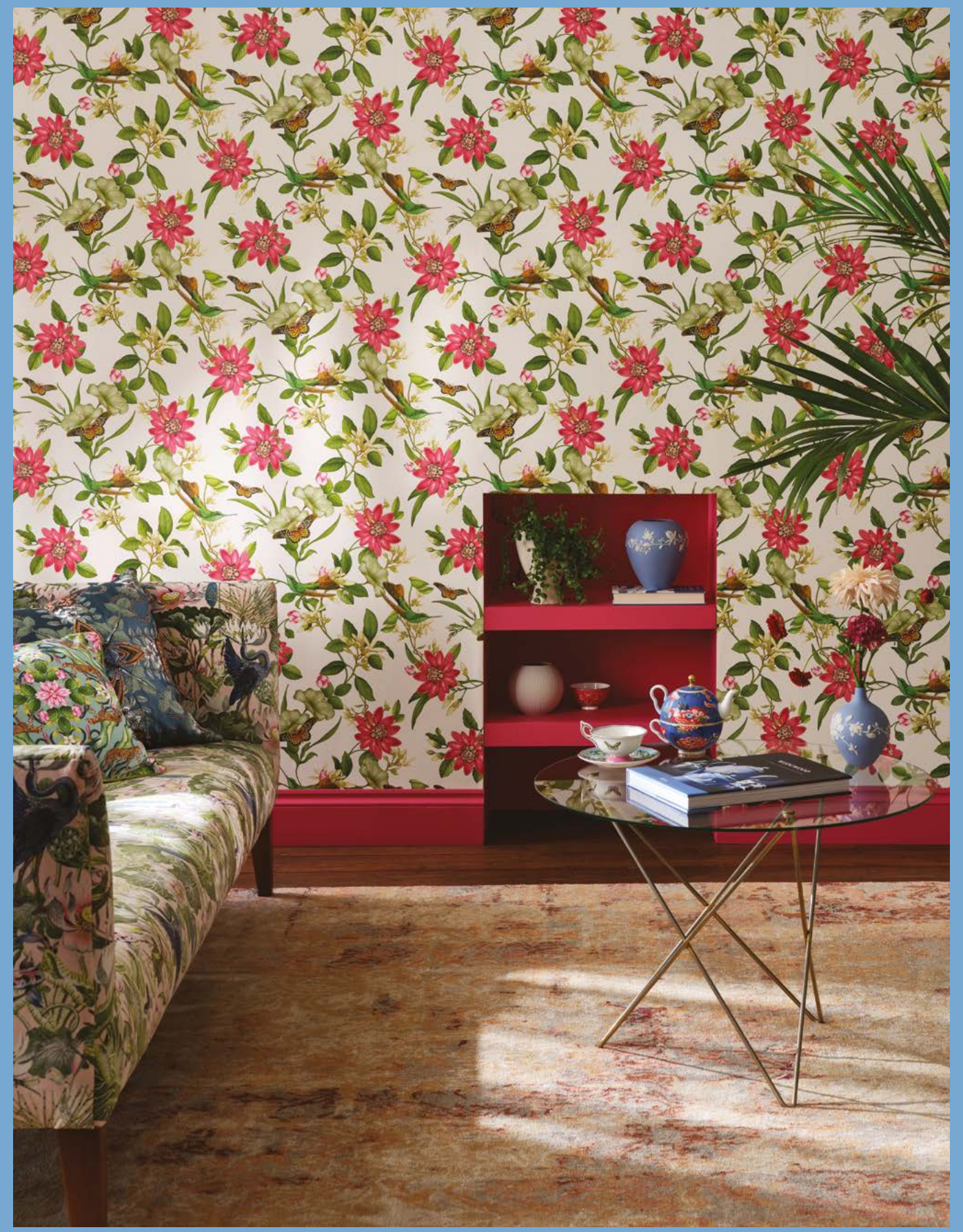
Wallcovering: Pink Lotus Ivory Sofa: Waterlily Blush Velvet Fabric Cushions left to right: Menagerie Aqua, Emerald Forest Teal Jacquard Fabric Ceramics left to right: Jasper Folia Warm White Rose Bowl, Wonderlust Crimson Jewel Bowl, Wonderlust Menagerie Teacup & Saucer, Magnolia Blossom Large Jasper Vase, Paeonia Blush Tea for one, Magnolia Blossom Jasper Bud Vase (Back page) left to right Throws: Folia Midnight, Folia Smoke Cushions: Sapphire Garden Midnight, Waterlily Midnight Curtains: Waterlily Midnight, Waterlily Natural Ceramics: Wonderlust Emerald Forest Mug